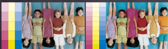
Conventional 8-bit processing BenQ 10-bit processing

Driven by HQV Technology, standard definition video is transformed! Content is de-interlaced, noise is reduced and images are elevated to HD quality through resizing and scaling up to 6 times. Independent pixel processing, true 10-bit color and independent color management deliver astounding image precision, color and clarity.