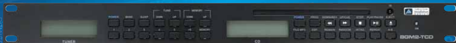
BGM2-TCD AM/FM Tuner Single Disc CD/MP3 player