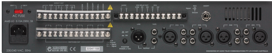
Rack Mounting Standard

Phantom Power (18V DC) is available from all mic inputs. A rear panel phantom power on/off switch is also provided.