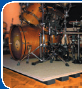
Decking material not included

HoverDeck™ Structural Isolation System PLATFOAM™ www.auralex.com Auralex Acoustics, Inc. Made in the USA