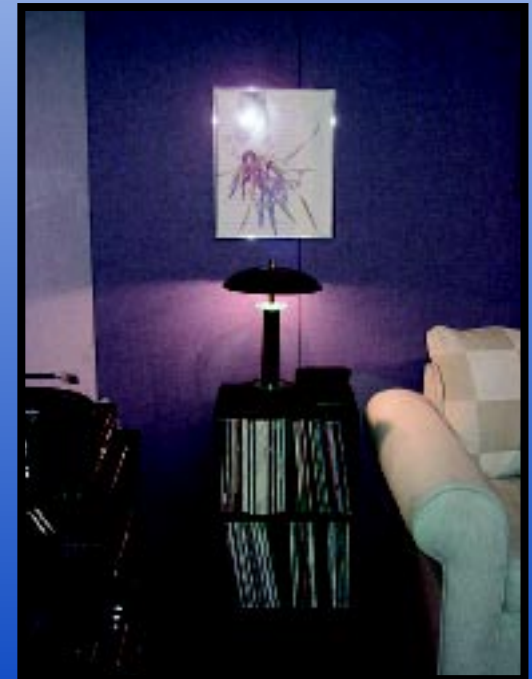
Installation shown of the demo room at Audiophile Systems, Ltd.