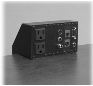
(optional sectional plates shown)