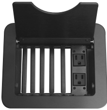
(shown configured as CNK240)