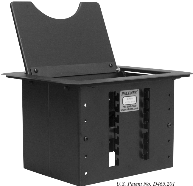
U.S. Patent No. D465,201