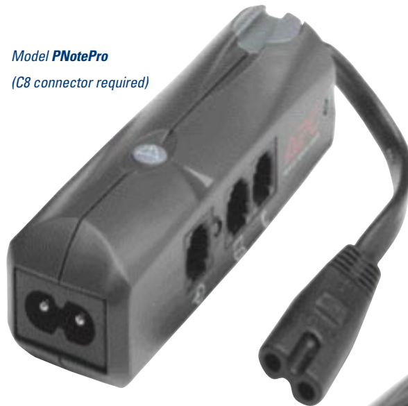
Model PNotePro (C8 connector required)

The SurgeArrest Notebook Pro weighs only 8 ounces. (actual size is: 4.9 in x 1.5 in. x 1.2 in.)