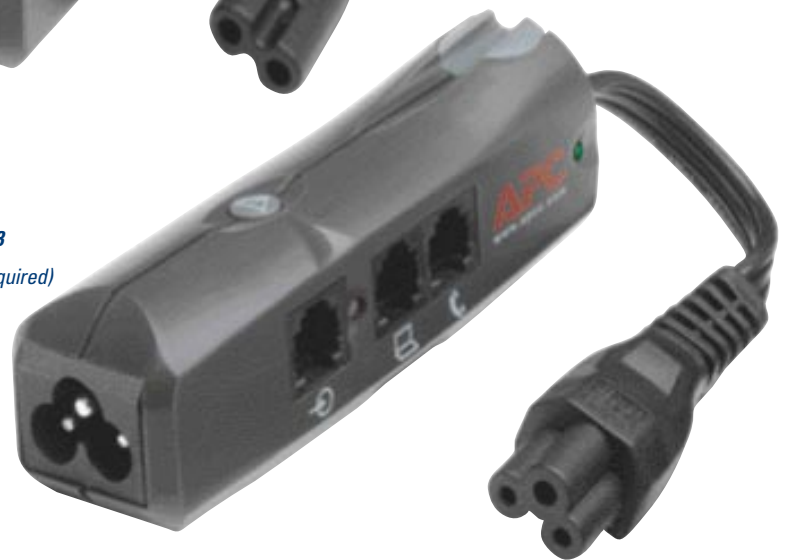
Model PNotePro3 (C6 connector required)

For more information call 800-800-4APC or visit our Web site at : www.apcc.com