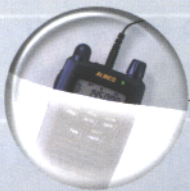
Antenna cap to cover connector