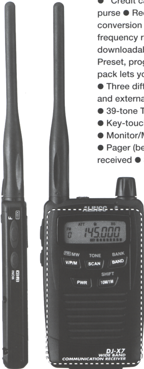
Actual ratio DJ-X7/Credit card

AM/FM/WFM 0.1-1299.995MHz Wide Band Communication Receiver