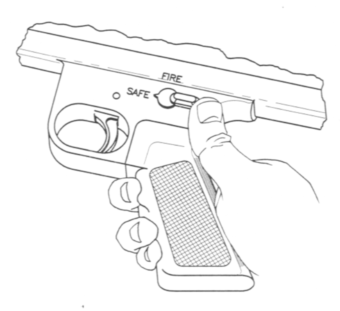
Illus. No. 2-Trigger Block Safety

The trigger block safety is located on the left side of the rifle just above the handgrip. When the safety is in the safe position, an internal cam surface engages the trigger and prevents the rearward movement of the trigger when it is squeezed. NOTE: THIS SAFETY FEATURE CAN ONLY BE ENGAGED WHEN THE BOLT HANDLE IS LIFTED AFTER EACH ROUND HAS BEEN FIRED. IF THE FIRING PIN IS IN A FIRED POSITION, THE SAFETY CANNOT BE PUT ON SAFE.