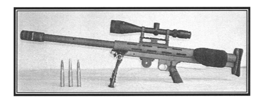
Illus. No. 1-EXTERIOR ILLUSTRATION