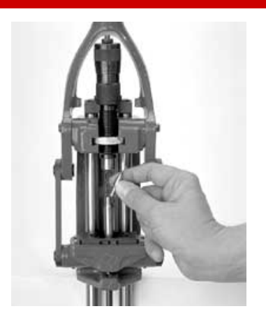
CASE RE-SIZING AND BULLET SEATING