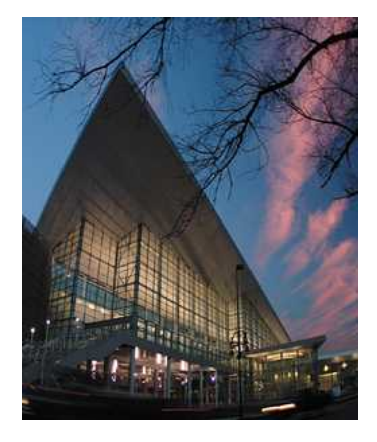
The Colorado Convention Center, home of the Denver Worldcon.