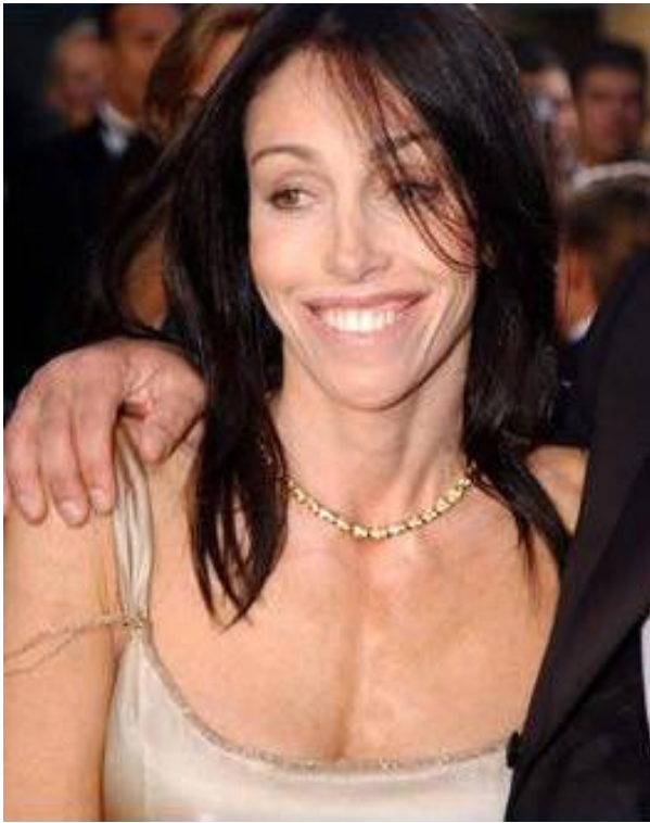
Heidi Fleiss, though not at the meeting, was a topic of conversation.