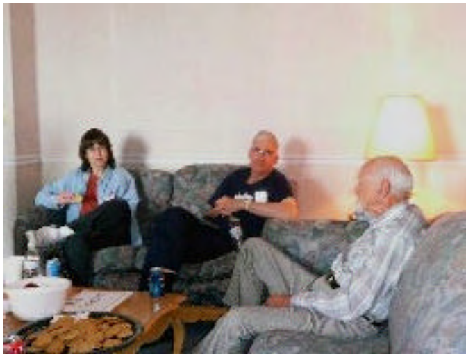
Fans relax in the Non-Smoking Consuite.