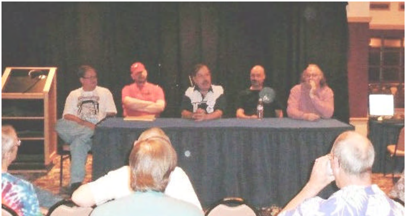
"Where Are We Going?" was the name of the morning fan panel. We didn't figure it out.

I think when fans wax nostalgic about paper fanzines, a lot of it is rooted in that fannish myth.