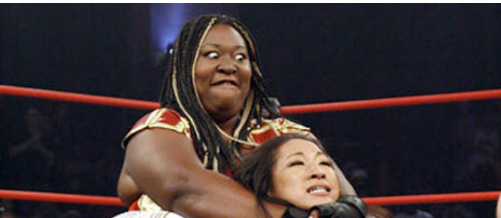
Kong chokes Gail Kim, Against All Odds PPV, 2008