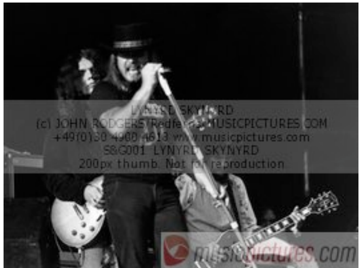
Skynyrd at Knebworth, later than I thought...

[[Holy crap - I got to come visit next time one of those fests is on! I'd always heard there was actually some good music to be had in Texas (especially in the Austin area), but that's a well decent line-up. Skynyrd were on the bill of the Pink Floyd outdoor concert at Knebworth Park (stately home), which would have been around 1972 - I'm recalling this without research on the basis that I think I was 14. I remember a lot of unusual smells which were new to me, but my main memory is of Floyd's performance.