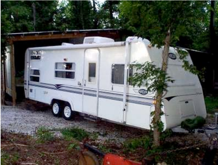
Not mine, but a very similar (and smaller) one

I bought a caravan (US: "camper trailer") a few months back, and it had been sitting at my old boss Tyler's place while I was waiting to find someone who's be willing to tow it to my place in Tennessee for a sum of money I considered less than fuckin outrageous - I put an ad on Craigslist and one bloke wanted $900!