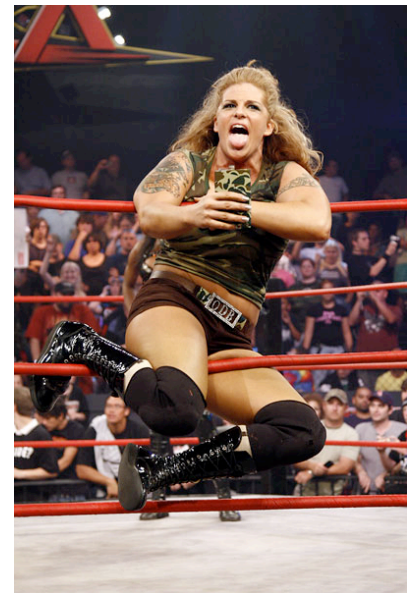
One Dirty Bitch

Hemme's match was replaced by a cluster brawl intended to determine a new #1 contender for the title, with the result going to ODB. Having played up the more humorous aspects of ODB's character in recent months and giving her a more disheveled trailer trash look, TNA now has just three weeks to restore her credibility in time for the next pay-per-view, Against All Odds , which in many ways is shaping up to produce some changes. Kong tends to have extended absences from time to time as she wrestles frequently in Japan and is enormously popular there, so if she's about to embark on another far eastern trip the title will need to change hands. ODB was always one of the more likely knockouts to be able to stand up to Kong in terms of size and strength.