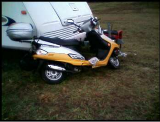
Still life, my stuff...

The inevitable happens - I get pulled over. According to the somewhat grumpy Washington County deputy, all I have been told about the freedom to ride 49cc scooters about the highways of Tennessee is total hooley. He keeps me standing in the cold for at least a half hour until I am handed three citations: no tags, no insurance, no license (the latter possibly carrying a year in jail) and a court date of February 18th in Jonesborough. I politely ask what the procedure might be to get a tags for the thing, since there is no actual title document. He has no idea, but with an air of grim seriousness probably hiding sadistic delight he informs me that I must not ride the scooter. It's at least 10 miles from where I need to be, and approaching noon. I prepare myself for a long push, but not before the scooter itself, as if in resignation, topples off the stand and smashes one of the wing mirrors.