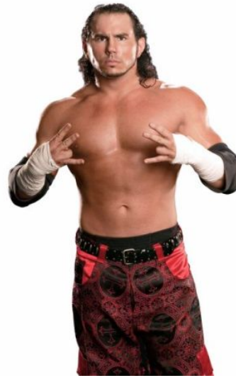
The Pretty Boy

Unlike the Mitey Arnie The K (unless he's changed his mind about them), I'm not at all a fan of either of the Hardy brothers, Matt and Jeff, or Mutt and Jeff as they would likely be christened by more cynical Brits. Both do terrible promos, both have made a reputation based on "high-risk" spots (i.e. a lot of leaping off the ropes and missing) and both appear to have gone to the same grimacing school and graduated magna cum laude , which means their matches more often than not consist of them getting whupped around the ring and hideously overselling the other guy's moves until some lucky break allows them to turn the match and score the pin and limp off carrying expressions of great pain, though possibly not as much pain as a cold-eyed appraiser might endure in watching them.