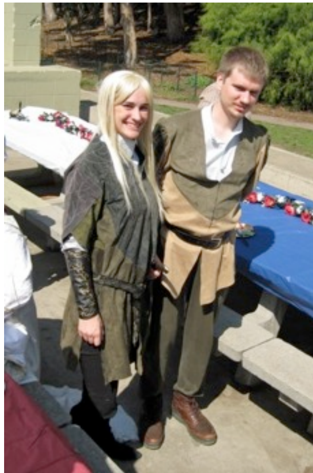
Legolass and Legolas