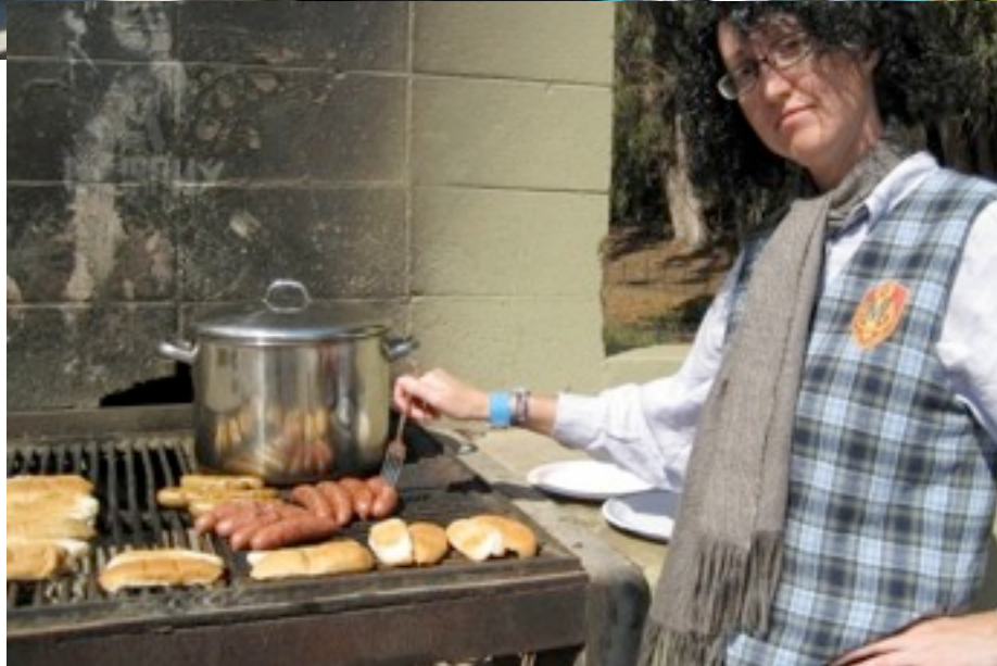
Hobbit Jonas Brother Barbecueing