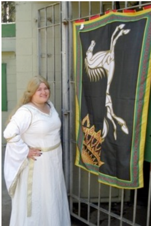
Eowyn, Lady of Rohan

Picnic that was held last September 26 at Pine Lake in Stern Grove. Everyone comes in costume and there are skits, dances, readings, recitals, a raffle and a trivia contest in addition to the potluck picnic. What a great way to celebrate Bilbo and Frodo Baggins' birthdays!