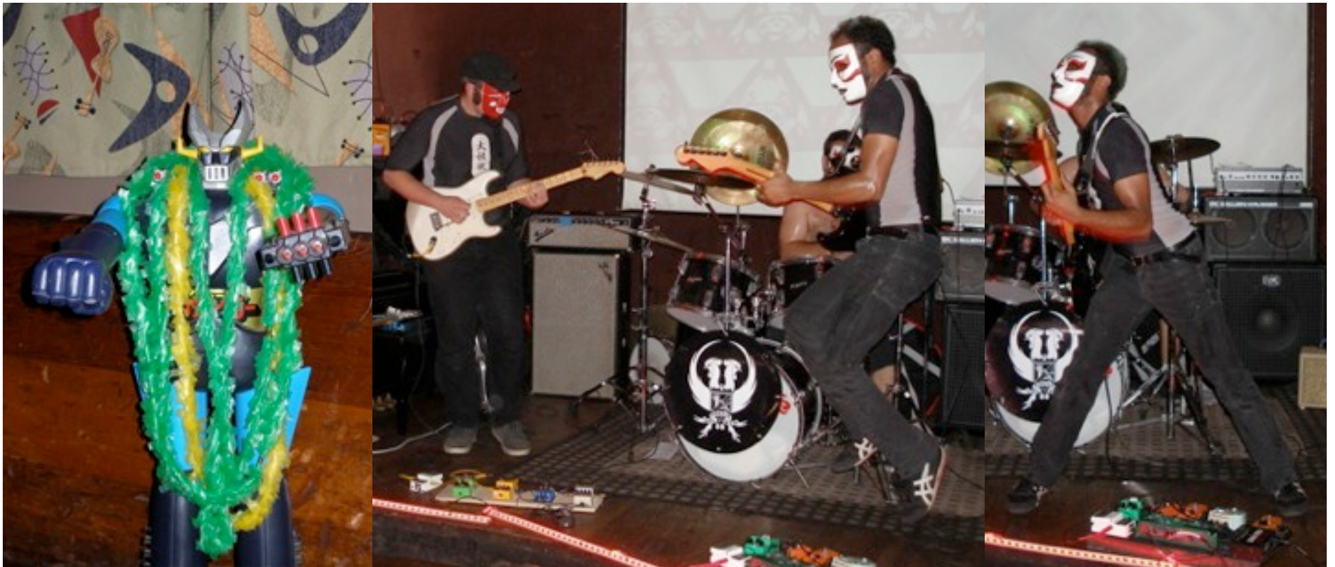
Daikaiju at the Hotel Utah

Although there is no indication that the book is part of a series other than the subtitle "A Novel of the Dominion," it feels as though it could very well be, and I certainly wouldn't mind seeing a sequel or even something focusing on another character within the same universe.