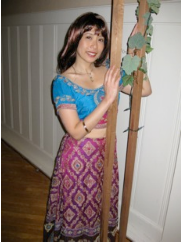
Me as Nandi