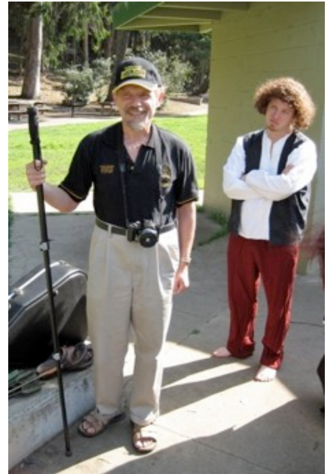
LOTR Tourist and Skeptical Hobbit