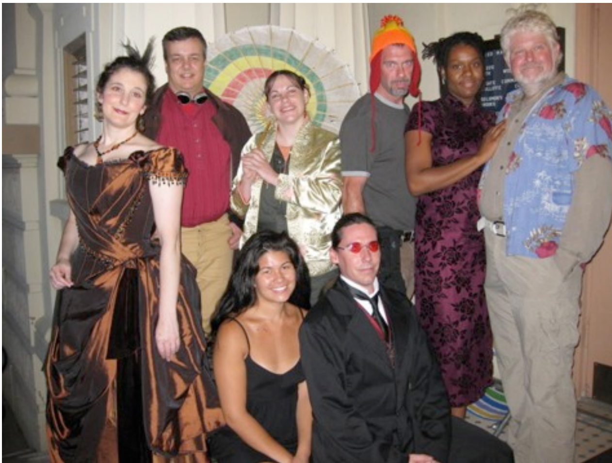
Almost Full Cast of Firefly Characters