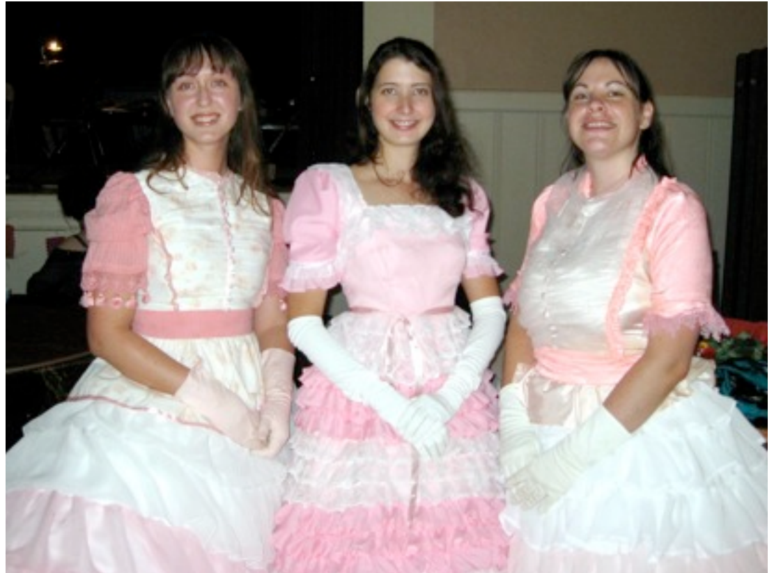
Three Layer Cake Kaylees