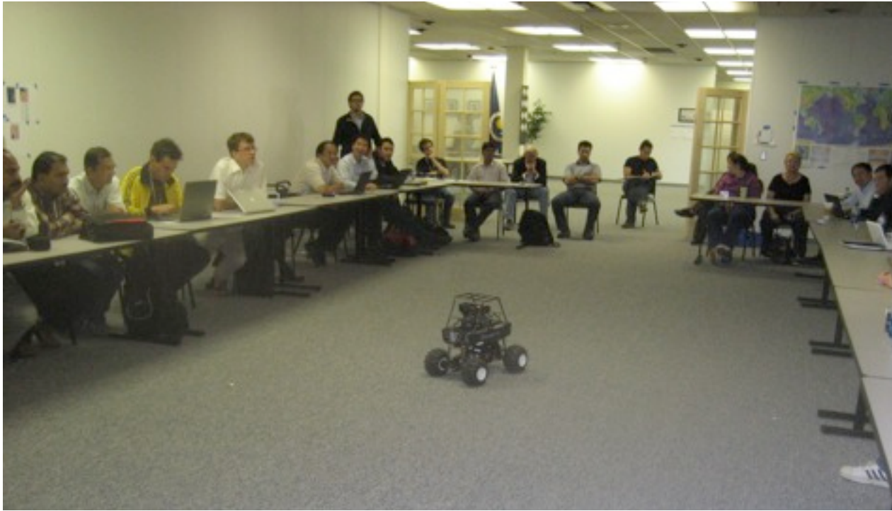
Attendees of the ISU presentation