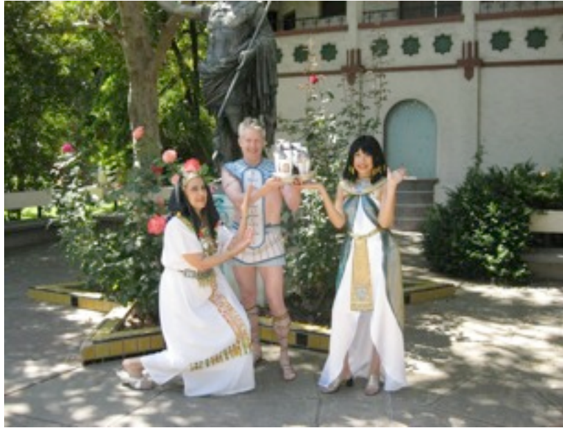
Walking Like an Egyptian