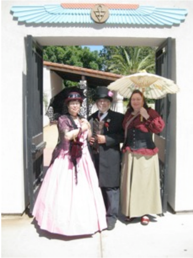
Steampunk Ladies and Gentleman

capturing it for posterity. There were enough photographers with us anyway.