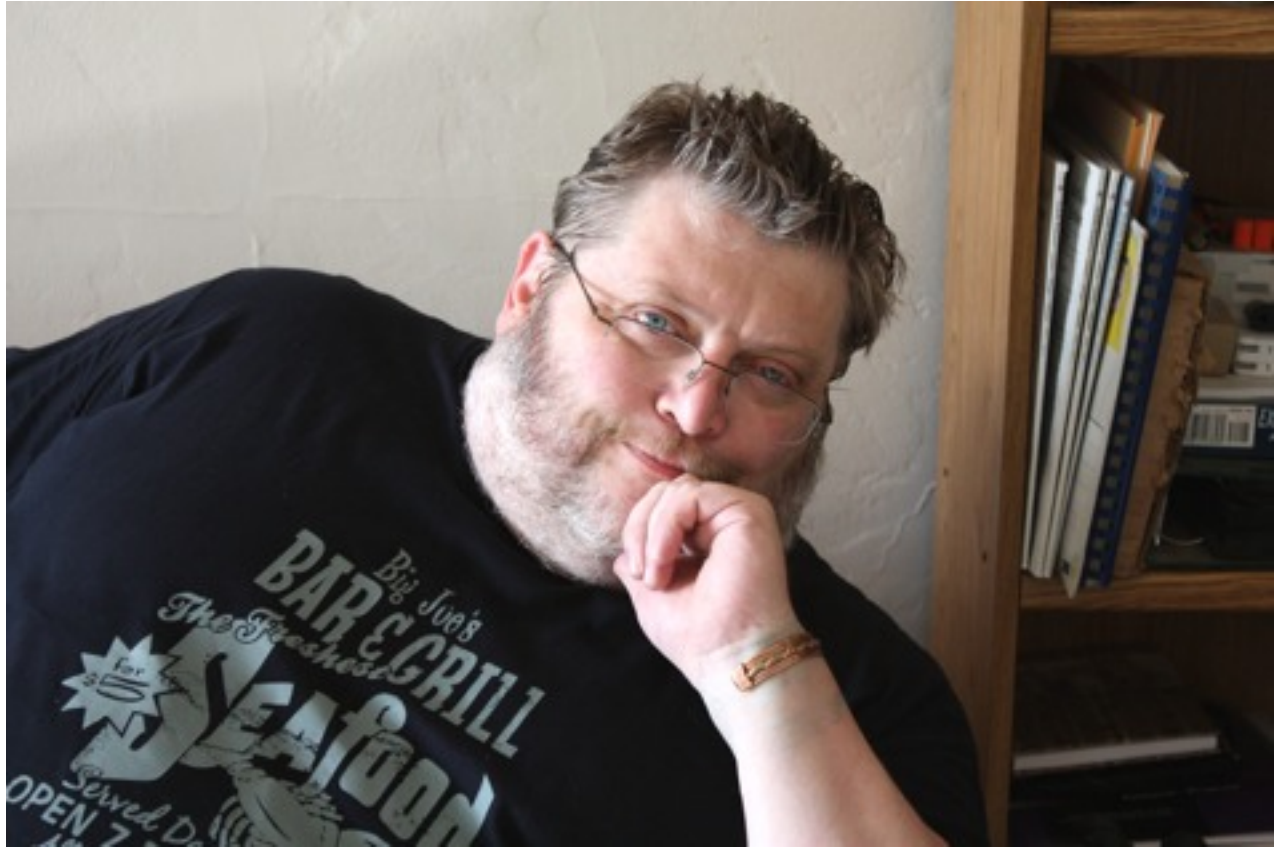
Fan about town

Now, Some Fantastic will help, but what we need is more writing about what's out there in film/books/stories/music/etc. that's all in one place. A zine that has a fannish take on pro material. Heck, if I hadn't just launched a new monthly, I'd give it a try, but really, I think it's someone else's turn. Someone out there wants to start a zine that takes our angle on the world of SF and gives it to us straight. That might even get me reading again.