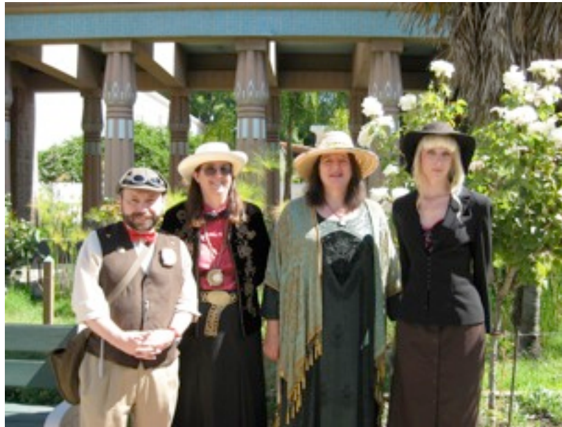
Torchwood Teams from Different Eras