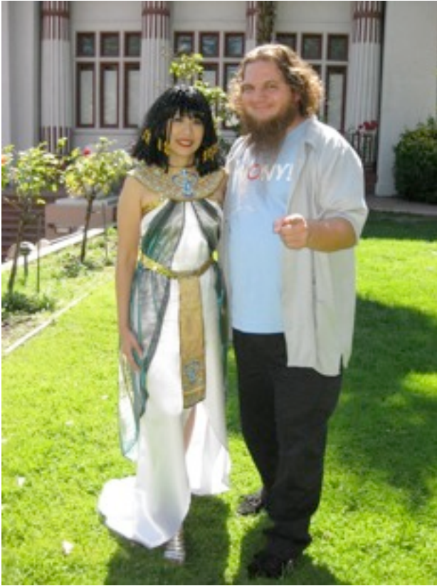
The SF/SF Editors