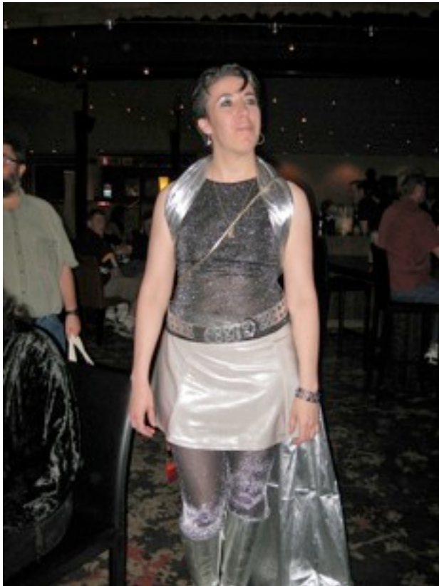
España the Space Girl

I was hoping to go to Montreal for Worldcon last August but realized belatedly that my work schedule would not permit it. I've always wanted to visit that city and suppose I'll have to do so on my own someday. But I was also a bit burnt out on conventions this year