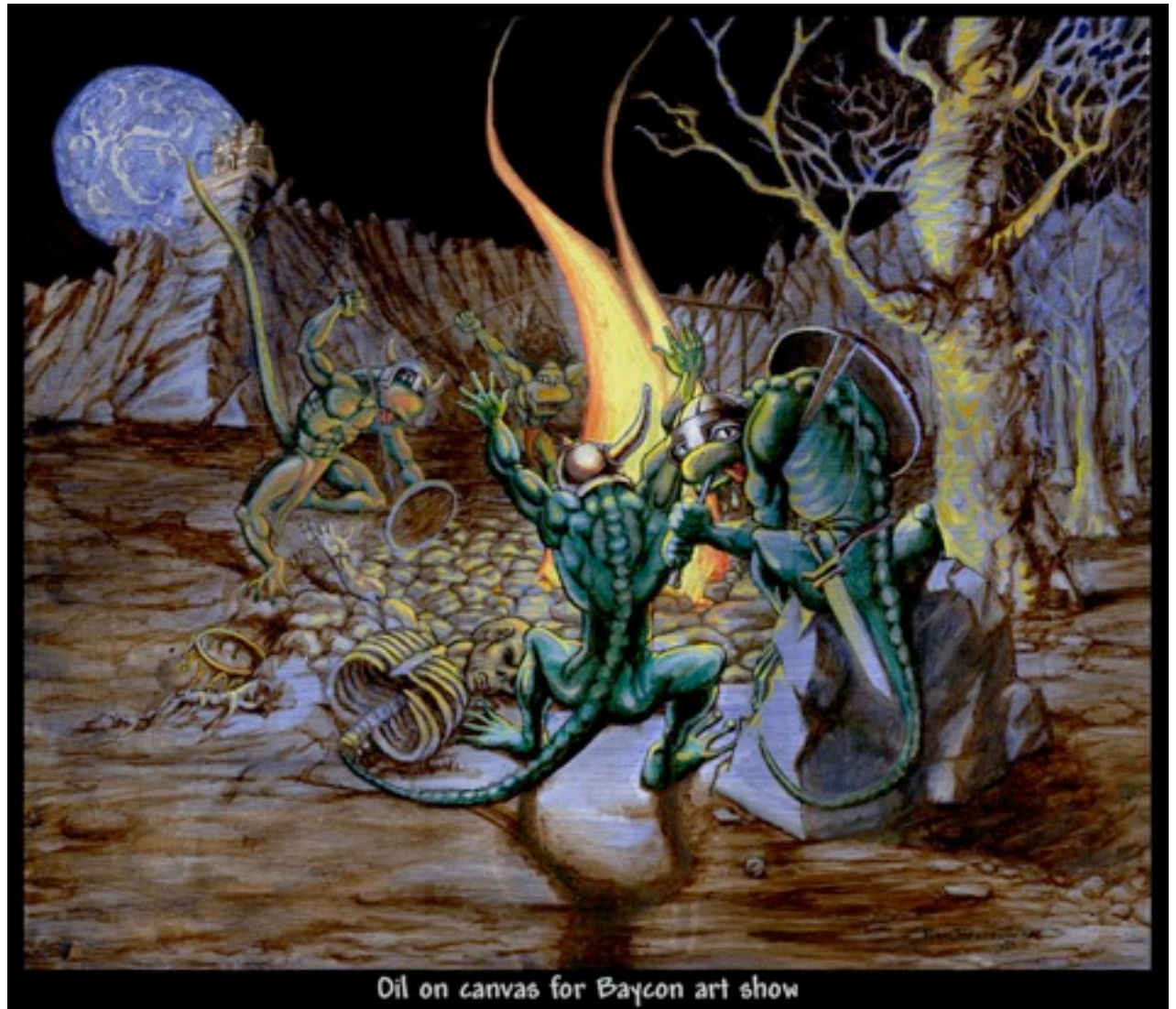
Oil on canvas for Baycon art show

And I can't believe they're doing another Doom Patrol book! I loved the Doom Patrol of the 1960s, but it may actually be time to let them all die.