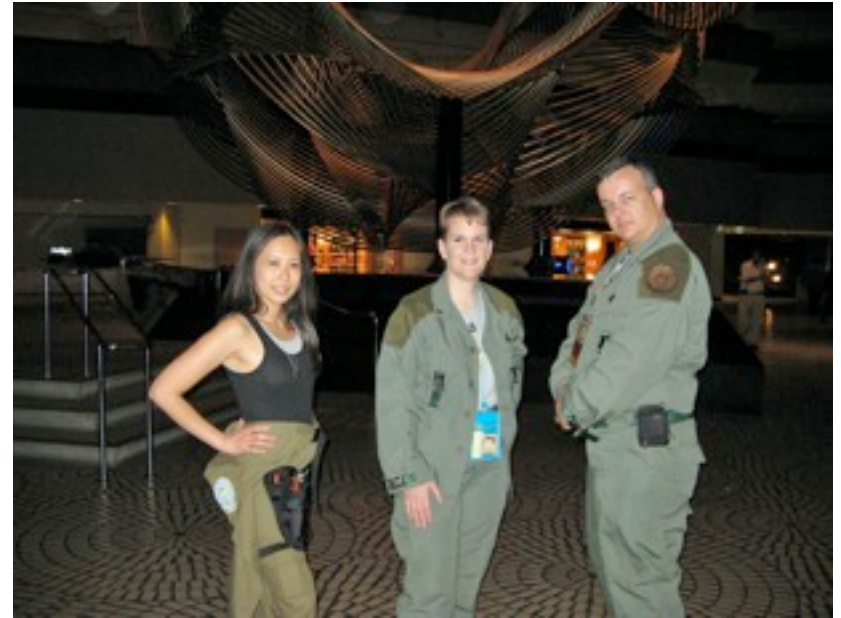
Battlestar Galactica Crew with Wicker Death Star

The incredible feat of planning a con last minute was detailed in España's article in our last issue. This review is my take on it from an attendee's perspective. (Even though I was recruited into becoming the Official Photographer when I arrived at the Eclipse Lounge of the hotel, which served as the main location for the con's activities.)