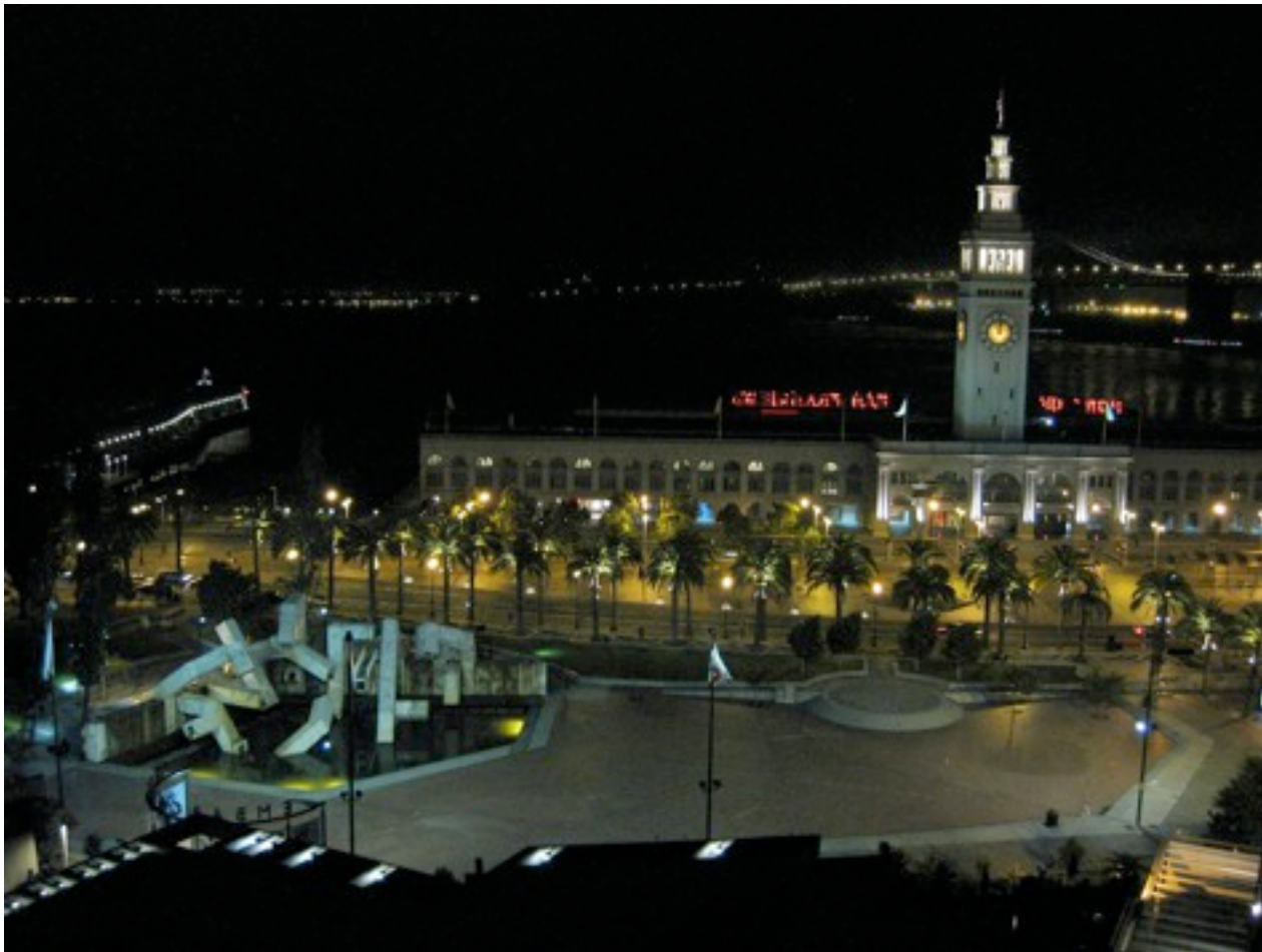
View from the Con Suite Balcony