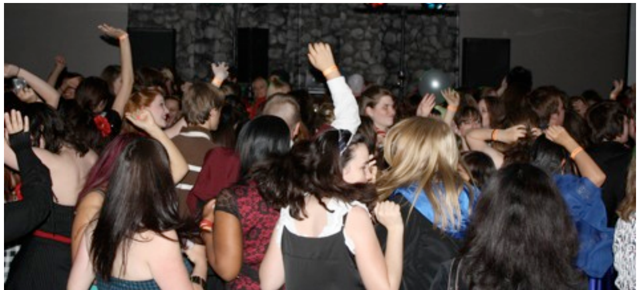
Dancing at the Ball

After the DJ, shaking his head in wonderment, packed his boxes of discs and yielded the stage, it was time for the “Wizard Wrock” bands. Ministry of Music was up first, its five male members busting out rockin’ original tunes, all within the milieu of Harry Potter. They were to be followed by Wingardium Leviosa, but I was already there. When a Voldemort Doppelganger took the microphone and assailed us with powerful vocals, I hollered and waved like a madman. The hour was late, but no one cared. We were in Harry’s world, and nothing else mattered. I had found the reason people came to the convention: for the sheer, unadulterated joy of it.