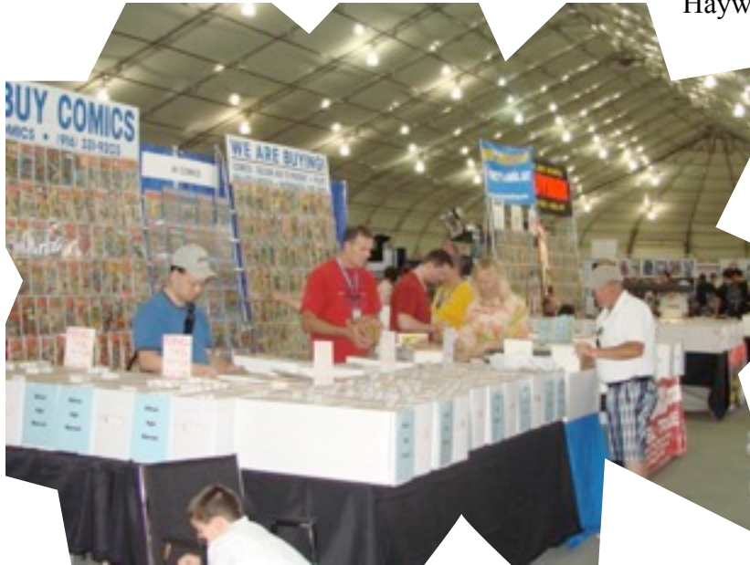
Various Comic Booths