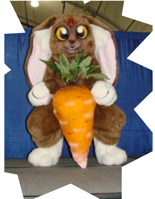
Best in Show Winner Ryo Ohki from Tenchi Muyo