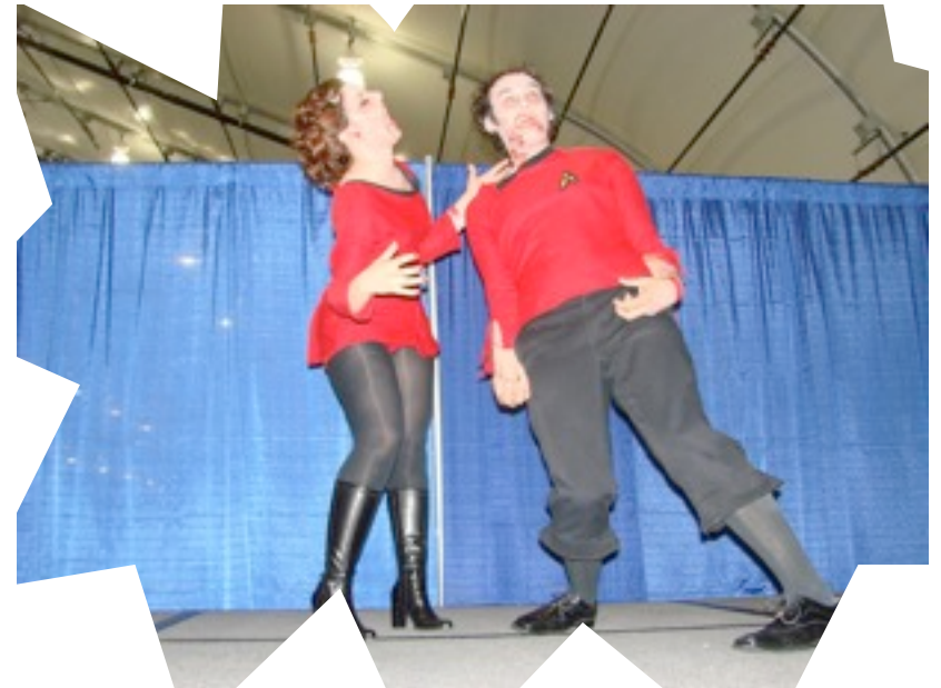
Star Trek Red Shirts Zombie Skit