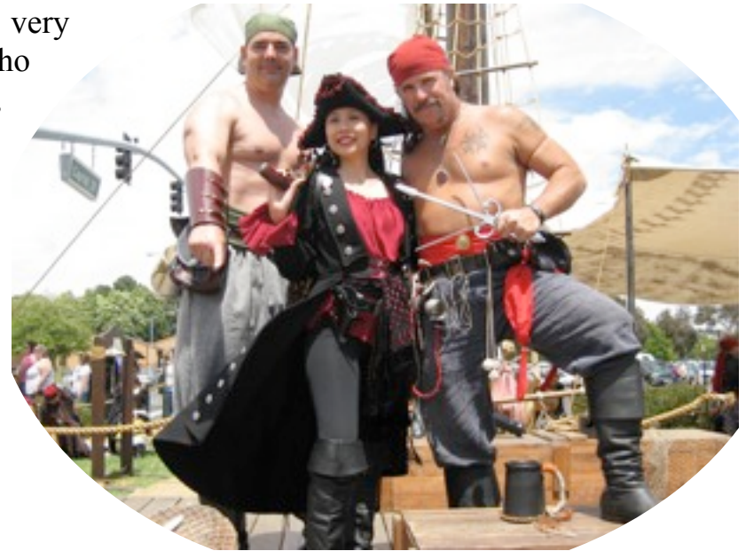
My Pirate Crew

Filipina at all) at BayCon. She introduced me to several of her Filipino friends who are all into sci fi and fantasy. I suppose the younger generation has caught up. In my high school and college days before I moved to the U.S., there were only a handful of us in the Philippines who had these