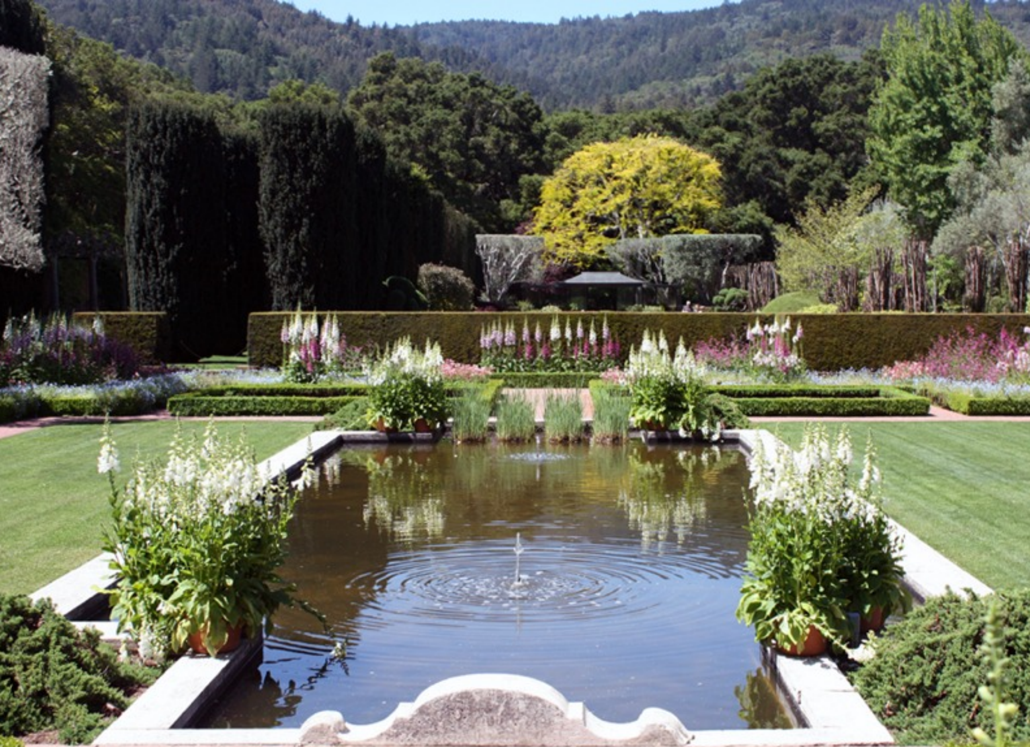
The Sunken Garden