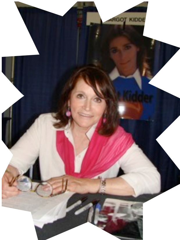
Margot Kidder aka Lois Lane

Atomic Man from The Simpsons , a Jedi, a Sith, a crazy sports fan, V for Vendetta , and many anime characters. In fact, the Best in Show was awarded to a rather large Ryo-Ohki from the Anime Tenchi Muyo . As stated, the cosplay was fun to watch and, I'm sure, to participate in. Guest Jane Wiedlin (from the Go-Gos and The Surreal Life ) hosted it enthusiastically. Next year we are definitely considering entering our son in the contest. In addition to award