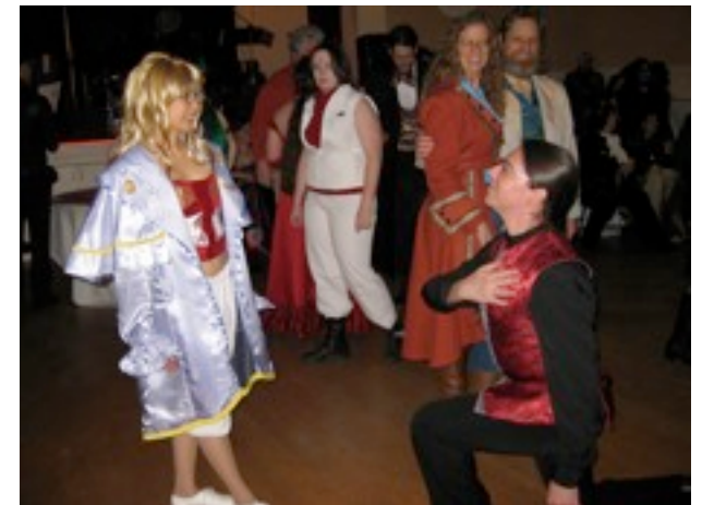
Lucrezia and Tarvek