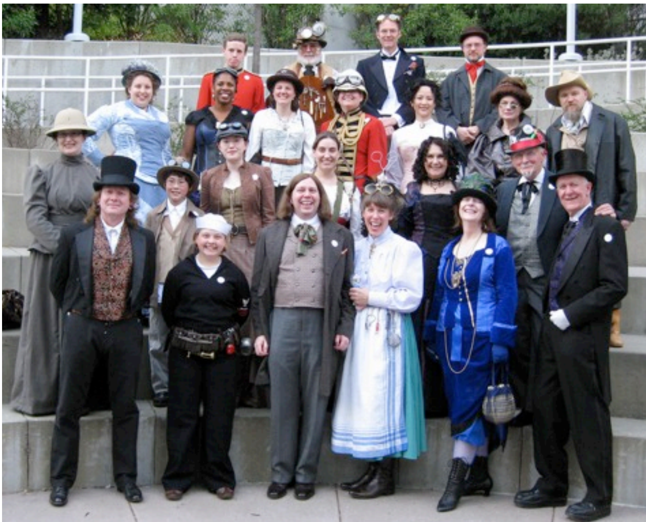
GBACG Members in Steampunk Finery

I dressed in a daytime explorer Steampunk outfit that was quite different from my usual evening, more Goth-inspired Steampunk looks. I recently purchased a pith helmet and so I