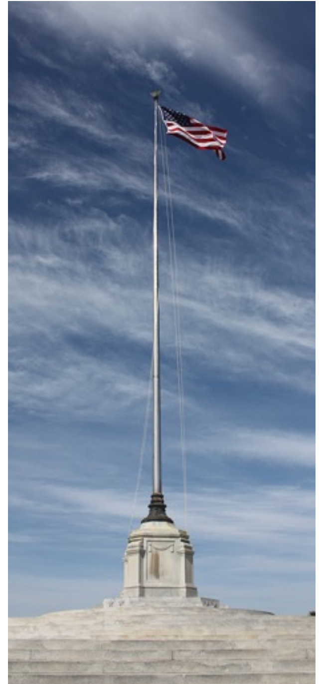
Golden Gate National Cemetery