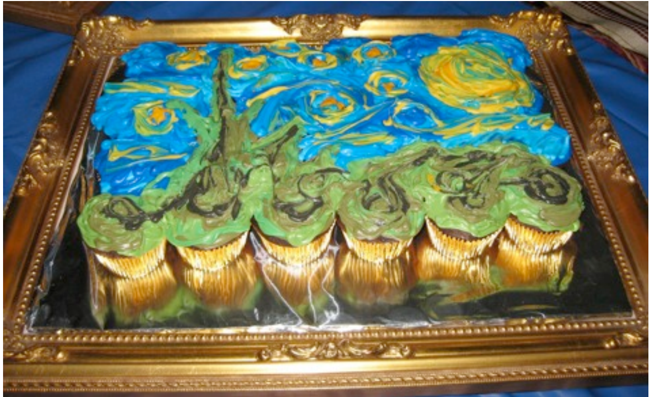
Van Gogh's Starry Night as Cupcakes

I hadn't seen a planetarium show since I was a kid and I was really looking forward to it. Our group occupied the middle portion of the seating area and lots of kids and their parents sat behind us. It's so great to see young people appreciating the wonders of science, particularly astronomy. The announcer welcomed us all, especially those of us in costume, and then mentioned that 2009 is the International Year of Astronomy. This year commemorates the 400th anniversary since Galileo Galilei first created a telescope and turned it toward the heavens. Previous to that, humankind had only seen stars and the planets with the naked eye. Can you imagine what it must have felt like to be the first to view the moon and the planets with greater detail? What a breakthrough for science and the advancement of our species! The speaker then