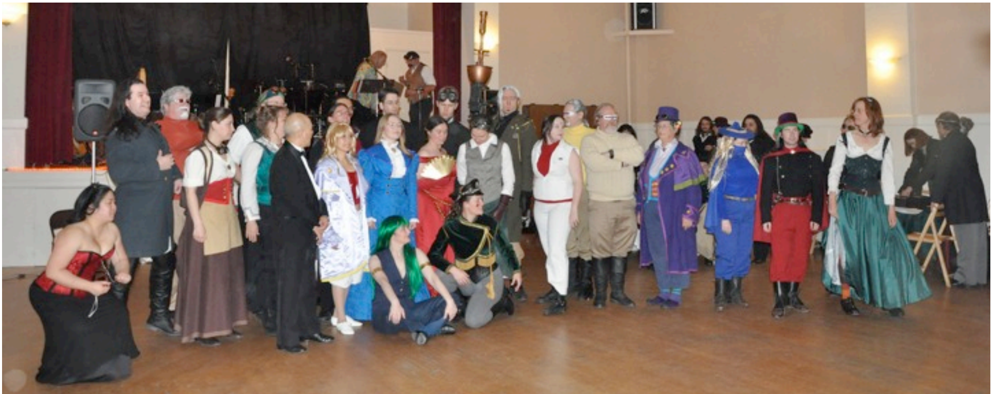
Girl Genius Costumes

The Girl Genius phenomenon started several years ago, and I was aware of it and how popular it was, but I haven't read comic books in years. I find contemporary comics too busy and confusing, and thus hard to read. It's hard enough for me to read books nowadays. Now if there were only audio versions of