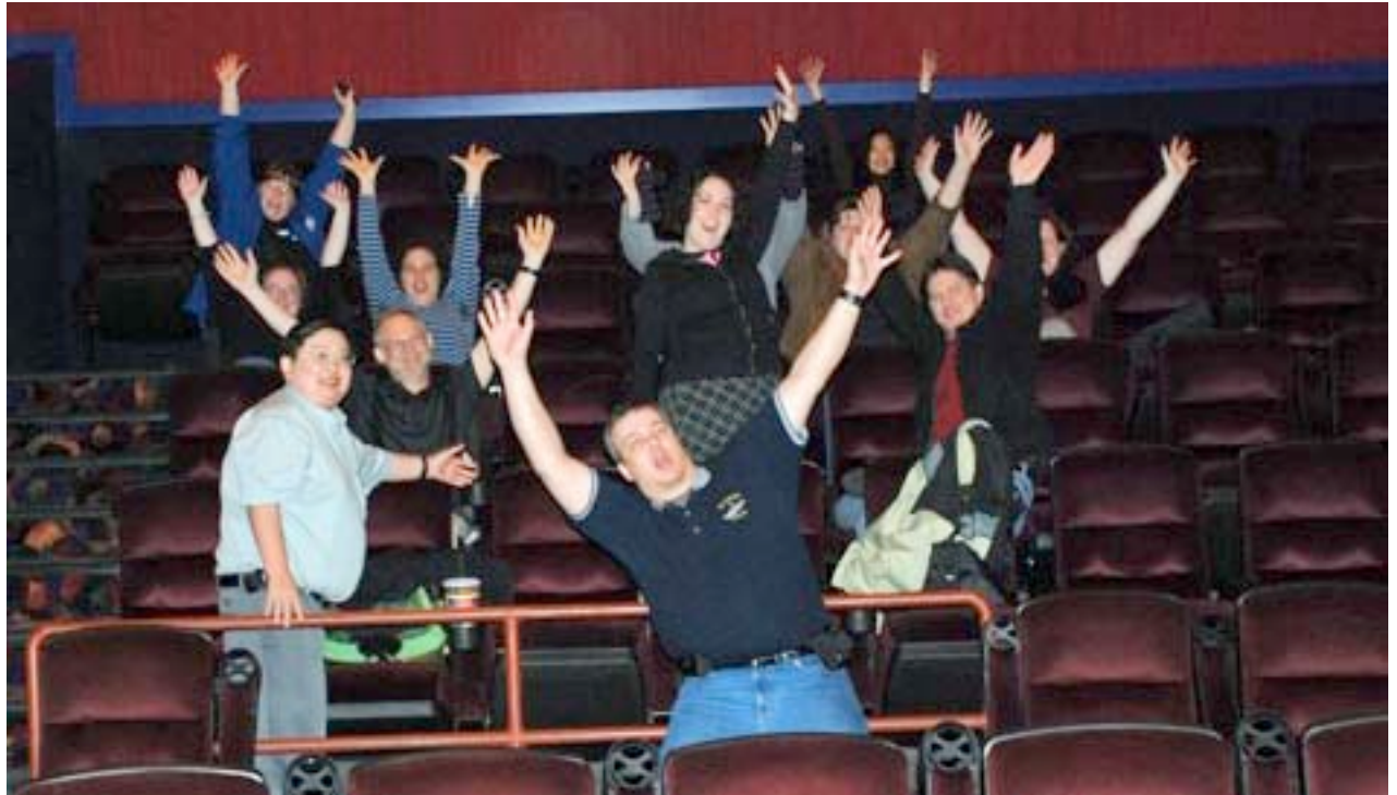
The Birthday Boy and Friends

I got to the theater complex a little late but still in time to join everyone for lunch at Fuddruckers. Our group had a big table as there were at least 20 people who came. Fuddruckers is a fun, colorful, 50s style burger joint. It was the perfect place for a birthday lunch. The selection was more varied than I expected. They even had buffalo burgers. I opted for a Hawaiian veggie burger and frings (half onion