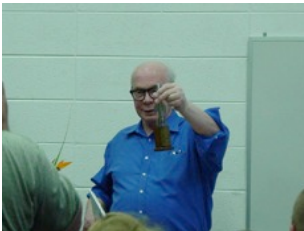
Philip Jose Farmer with 1953 Hugo award as The Most Promising New Talent

The busiest weekend in recent fannish memory happened the opening weekend of Cinequest. There was Potlatch, taking place in the lovely Domain Hotel in Sunnyvale. I wish I could have gone, but you know. I hear that there was great fun and we've got great coverage! There was a lovely WonderCon. I'm hoping to get to both next year, though there's always Cinequest getting in the way.