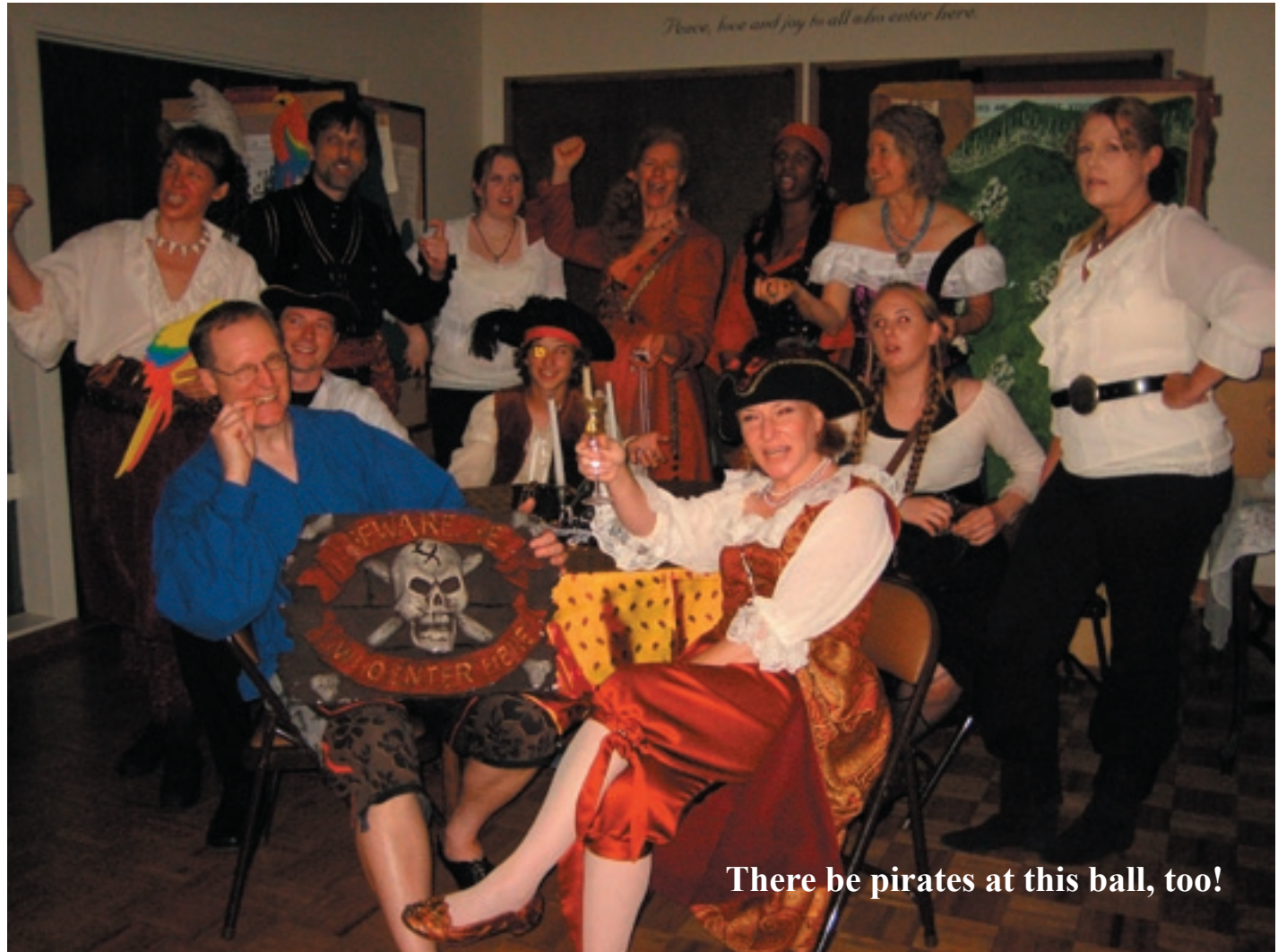
There be pirates at this ball, too!

Surprisingly, very few people used the alcove. Several hung out at the patio, which I suppose was the best place to be as it was cooler