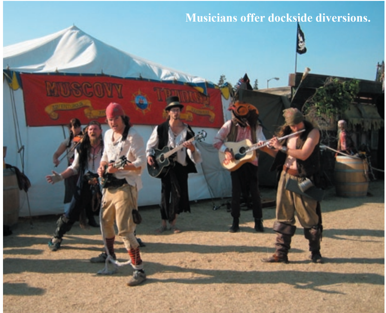
Musicians offer dockside diversions.