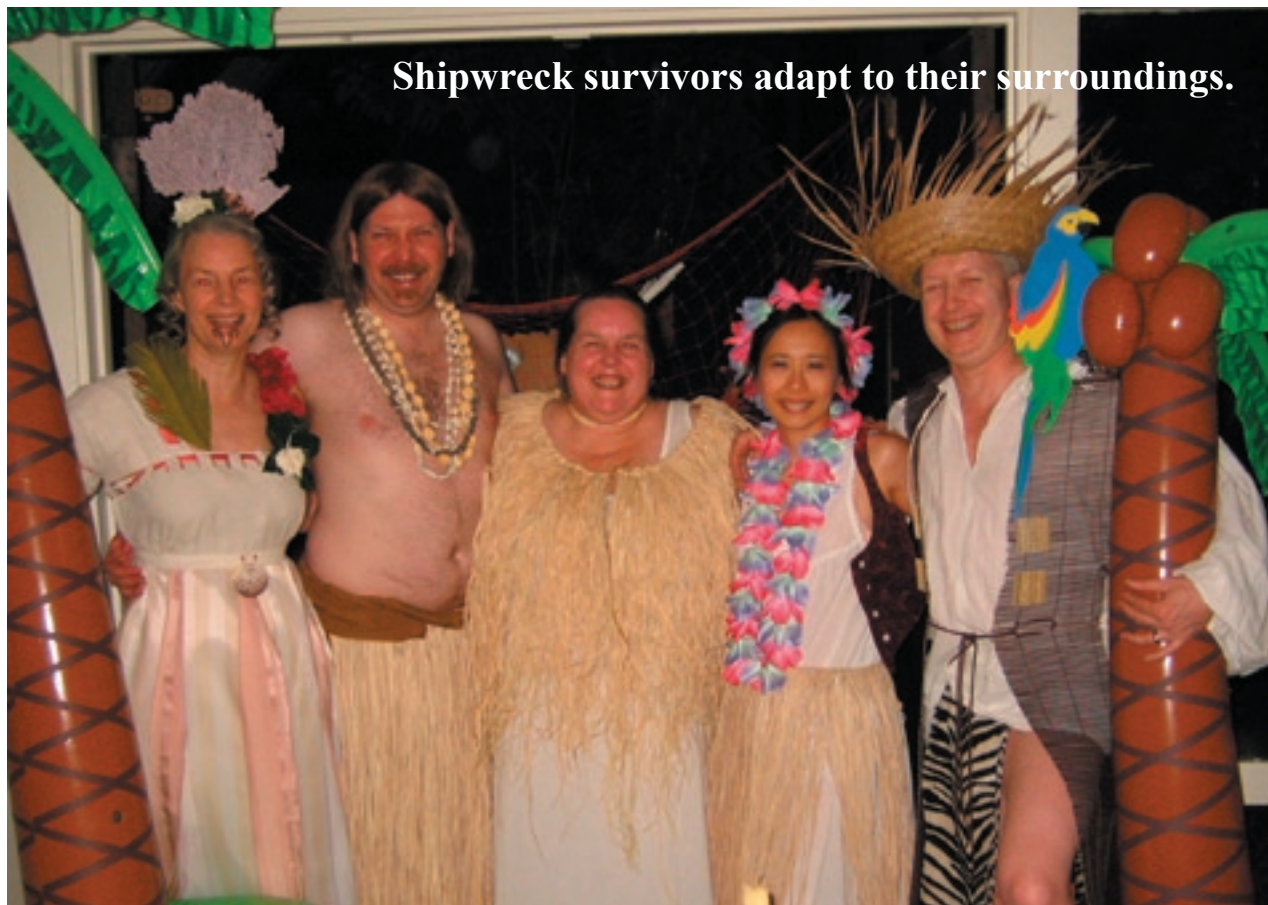
Shipwreck survivors adapt to their surroundings.

Kensington is quite far but the long trek to the Berkeley Hills was worth it. There was a scenic view of the Bay Area right before I got to the Hall. The Hall itself is beautiful as it is surrounded by trees and vegetation. The entrance was through one of the French windows that led