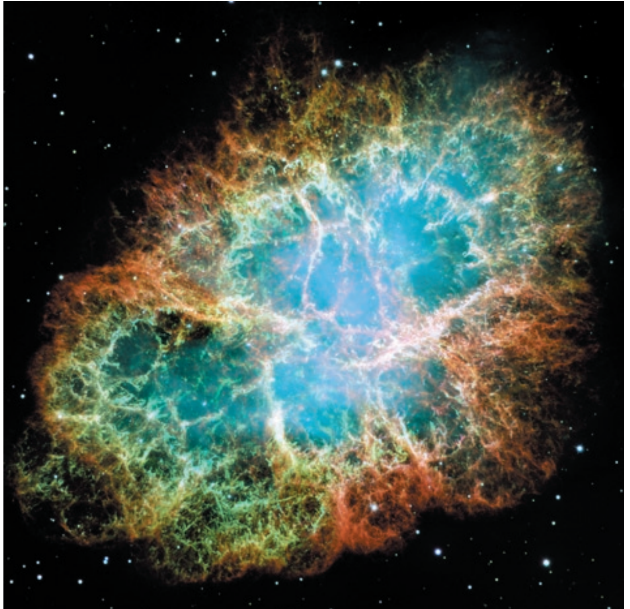
The Crab Nebula as photographed by the Hubble Space Telescope's Wide Field Planetary Camera 2.

Anime/cosplay group usually meets the last Saturday of the month at 1800 hours.