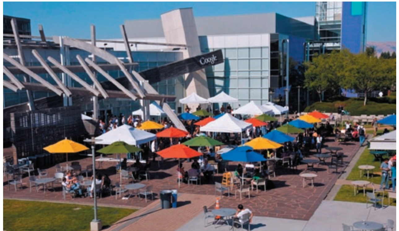
Visiting the Googleplex on a sunny Summer's day.

were modern and artistic. Outside, there was a replica of a T-Rex skeleton. Inside, there was décor everywhere, on the walls and hanging from the ceilings, and some cubicles looked like tents. There were a lot of techy visuals and fun displays. Employees are free to decorate not just their own spaces but public spaces as well. So there were museum-style photos and posters as well as entertainment and space memorabilia. The most interesting ones were a full size model of SpaceShip One and a Cylon Centurion from