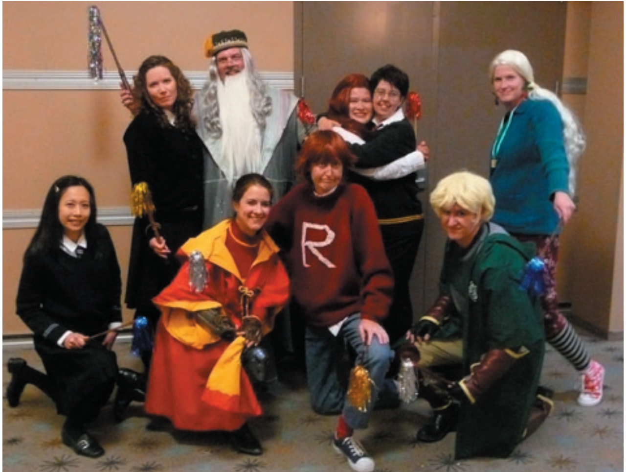
'Dumbledore's Army,' Best Presentation winner in the Masquerade.