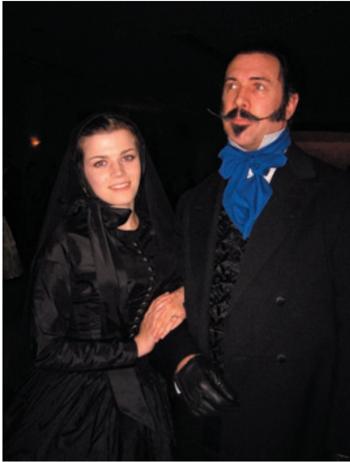
Scarlett and Rhett make a dashing couple at Gone With the Wind Ball.

So there was no help for it, I was going to have to go to both in one evening. I thought