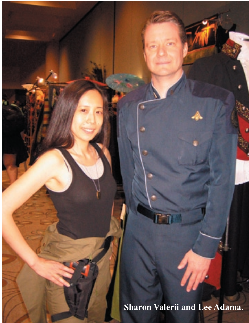
Sharon Valerii and Lee Adama.

A fire truck arrived and it didn't seem like a big deal as there was only one and the firemen didn't look like they were in any hurry. Which was a huge relief as I had at least nine costumes in my suitcase in my hotel room, and not only do