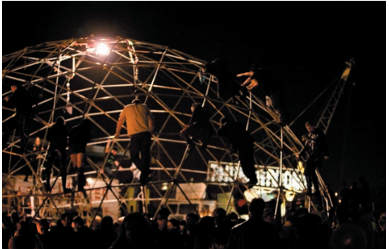
Thunderdome comes to life in San Francisco.