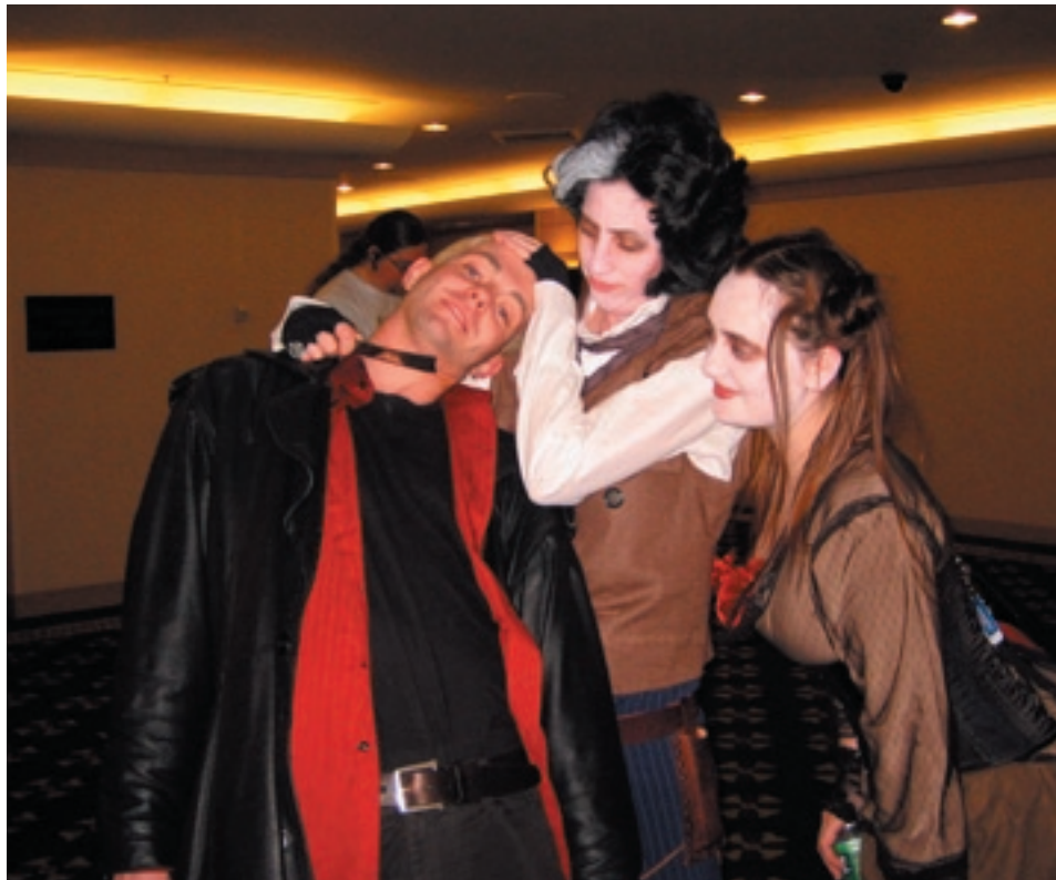
Sweeney Todd and Mrs. Lovett offer Spike a close shave.

I got to the Hyatt earlier than I'd expected on Friday, and checked in at the front desk. The hotel has a beautiful airy and spacious lobby, but it looked quite fancy and sleek. It didn't feel cozy like the Marriott, nor as welcoming as the Doubletree. My room turned out to be on the 13th floor. I almost asked for another room but I told myself not to be superstitious. I thought this might either be an omen of some impending doom or of a devilish great time... so I let it