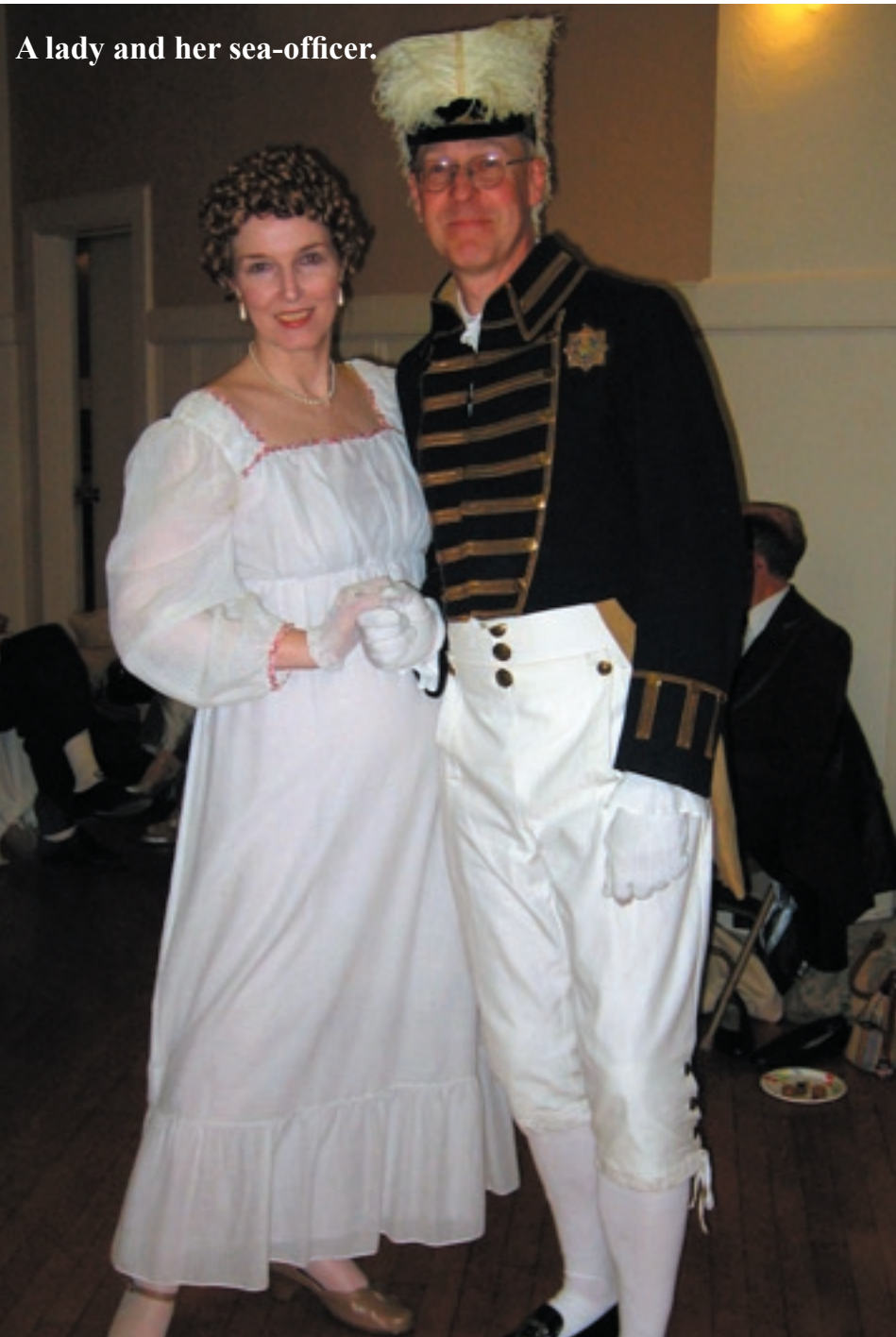
A lady and her sea-officer.

There was also a table with stickers, papers and other