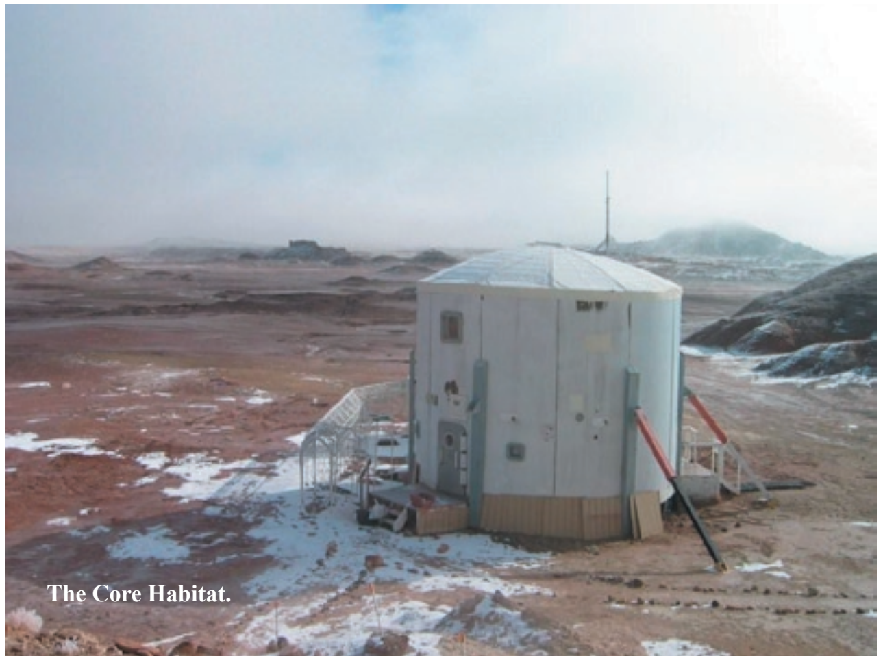
The Core Habitat.