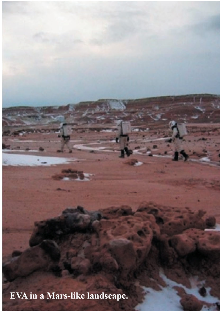
EVA in a Mars-like landscape.

It was as surreal as anything could be, that first evening of our simulation last January. After Firefly was over and the rest of the crew were in their bunks, I paused for a few moments and gazed out through the western porthole. It was well past ten, and a lazy full moon washed the desert floor in a crisp blue light. The habitat’s own lights had been turned off for the night, save for a couple of dim red emergency LEDs that illuminated the rim of the window. I couldn’t help but notice the contrast between the blue and red and the bizarre layered rolling hills of the Southern Utah desert, the floor of an ancient seabed and a location selected for its similarity to the Martian