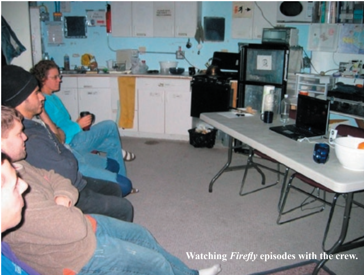
Watching Firefly episodes with the crew.