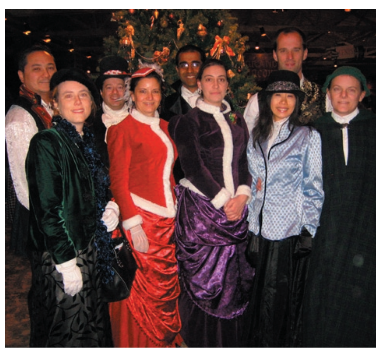
Holiday revelers gather before the tree.

The Cow Palace location is much nicer, with the streets of Old London re-created in a much more organized fashion. You can see all the delightful shops, dining establishments and entertainment halls very easily as you stroll down aptly named areas such as Nickelby Road and Fagin's Alley. The main draw for me, of course, is the first room that you see as you enter the