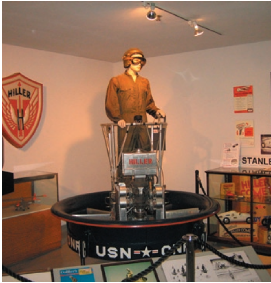
1950s prototype for Hiller "Flying Platform."

Back in the huge atrium area, which I thought at first was just a