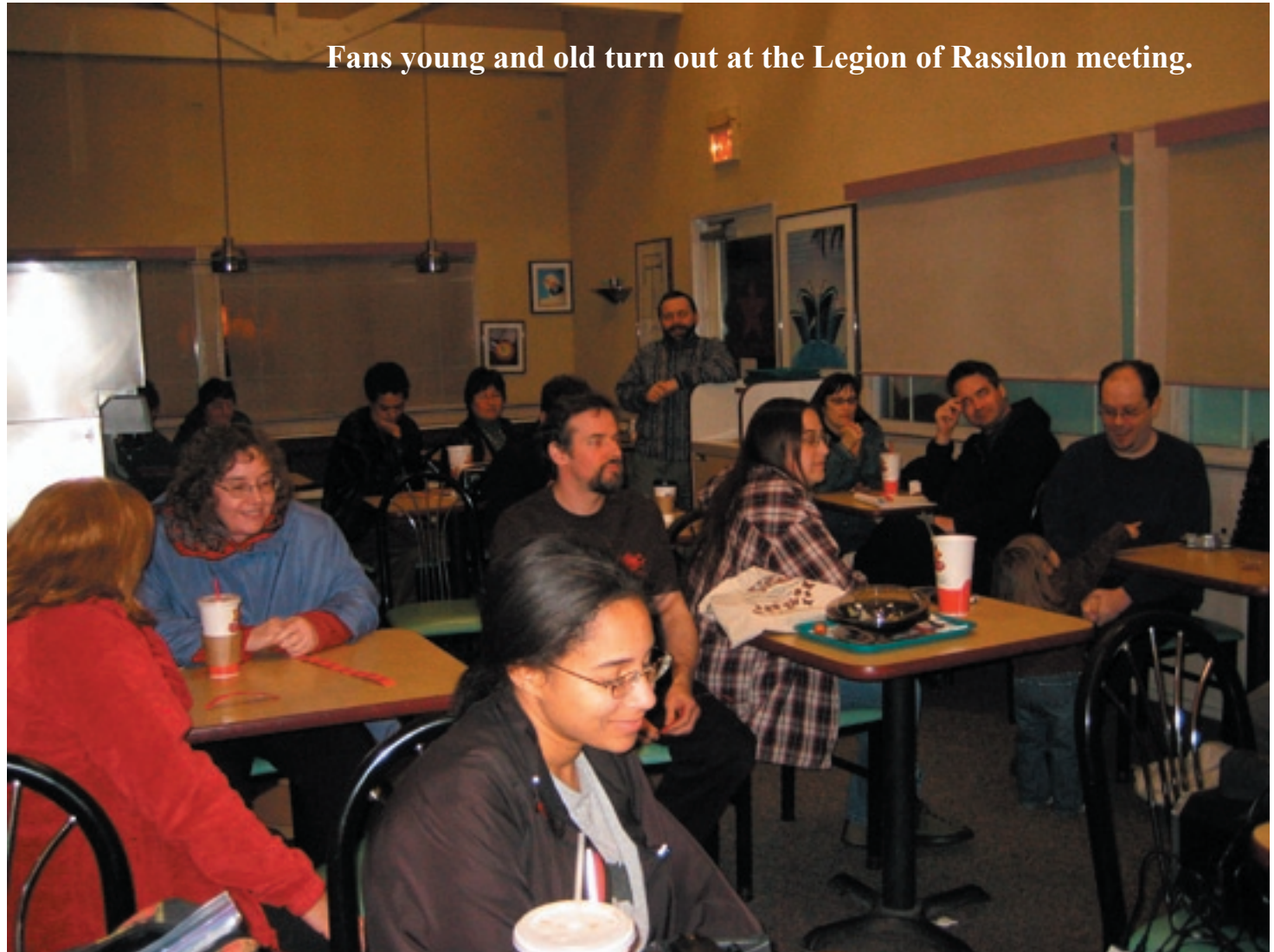
Fans young and old turn out at the Legion of Rassilon meeting.

episode from last year. I'm not sure if I'm in favor of the Doctor being polycompanionous (I made up that word), but I'll probably watch and enjoy it all just the same. So it looks like 2008 will be a busy year for the Legion of Rassilon as well!