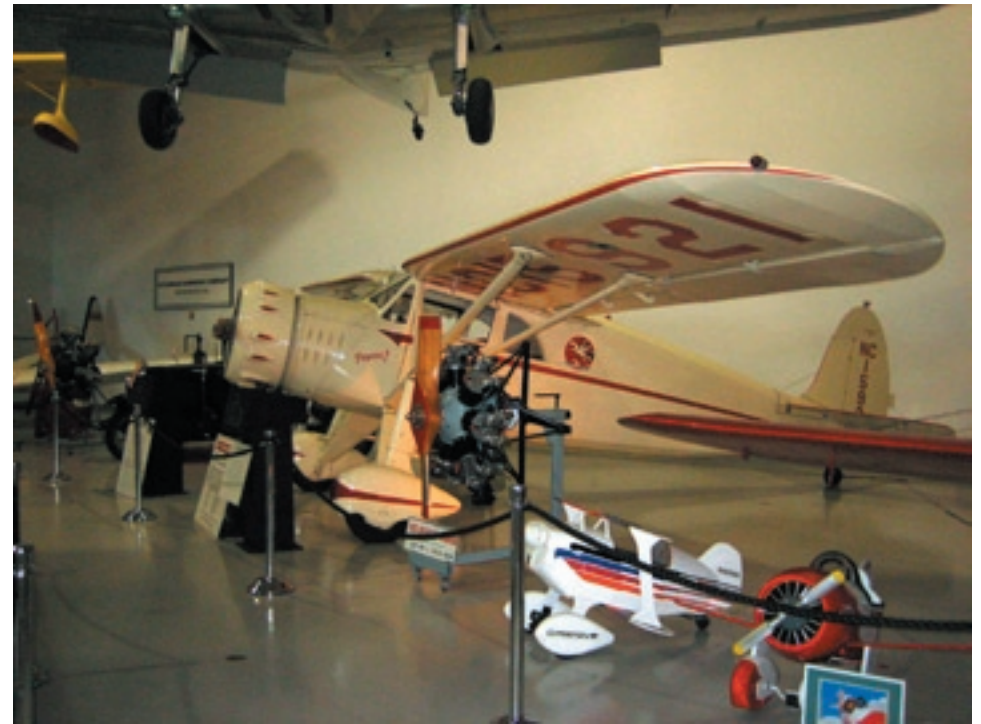
A 1930s Fairchild Monoplane.