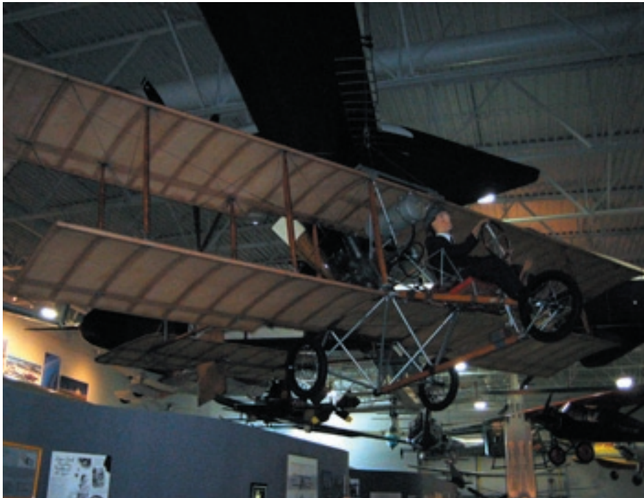
“Little Looper” of the Early 20th Century.

After I realized that I had done all this backwards, I went back into the museum and saw it in the order in which it was meant to be viewed. Then it made more sense to me that the museum was organized by decades,