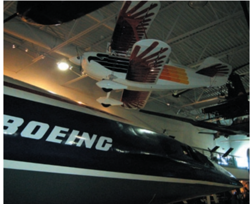
A Christen Eagle II biplane soars over a mockup of the never-built Boeing SST.