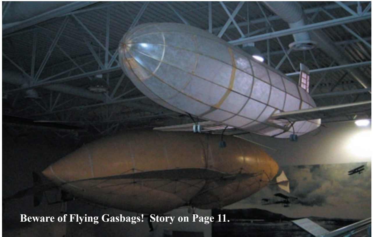
Beware of Flying Gasbags! Story on Page 11.