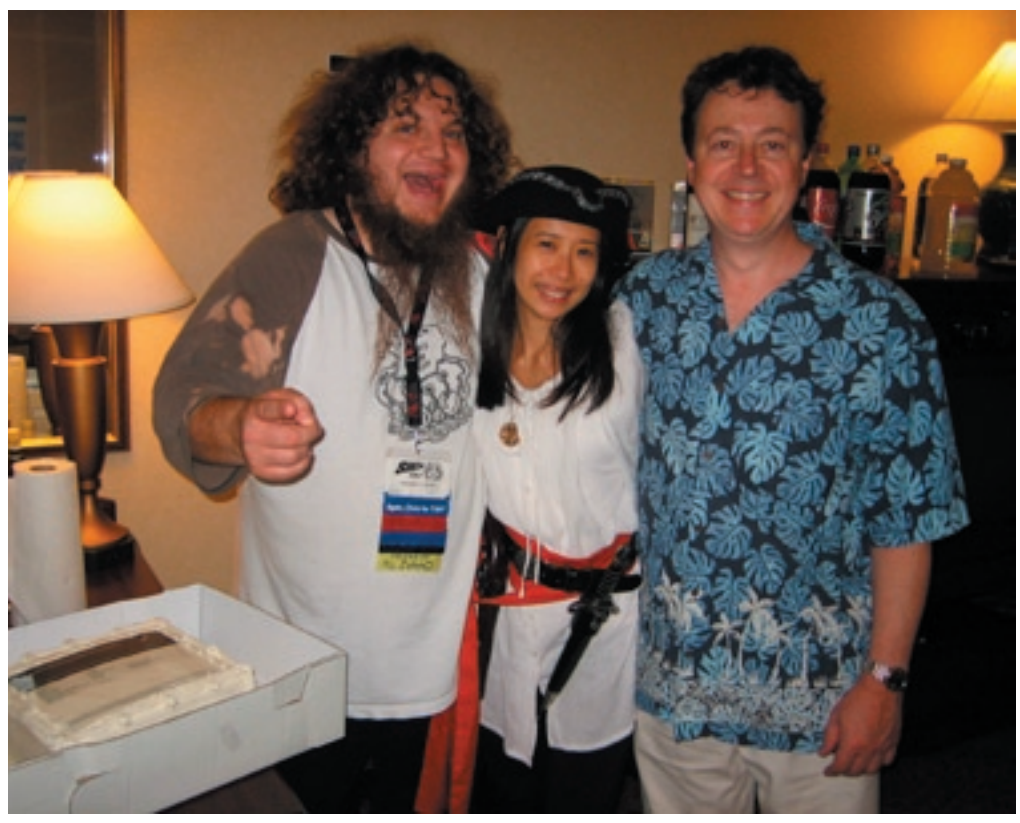
Your intrepid editors in the SF/SF party room.