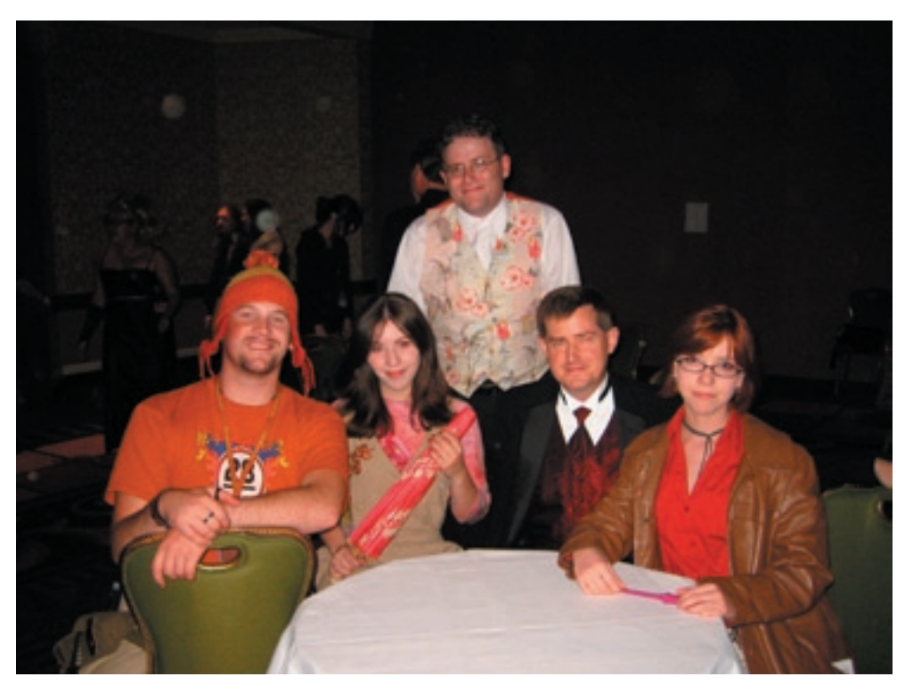
Browncoats at the Hallo-Whedon Hootenanny.