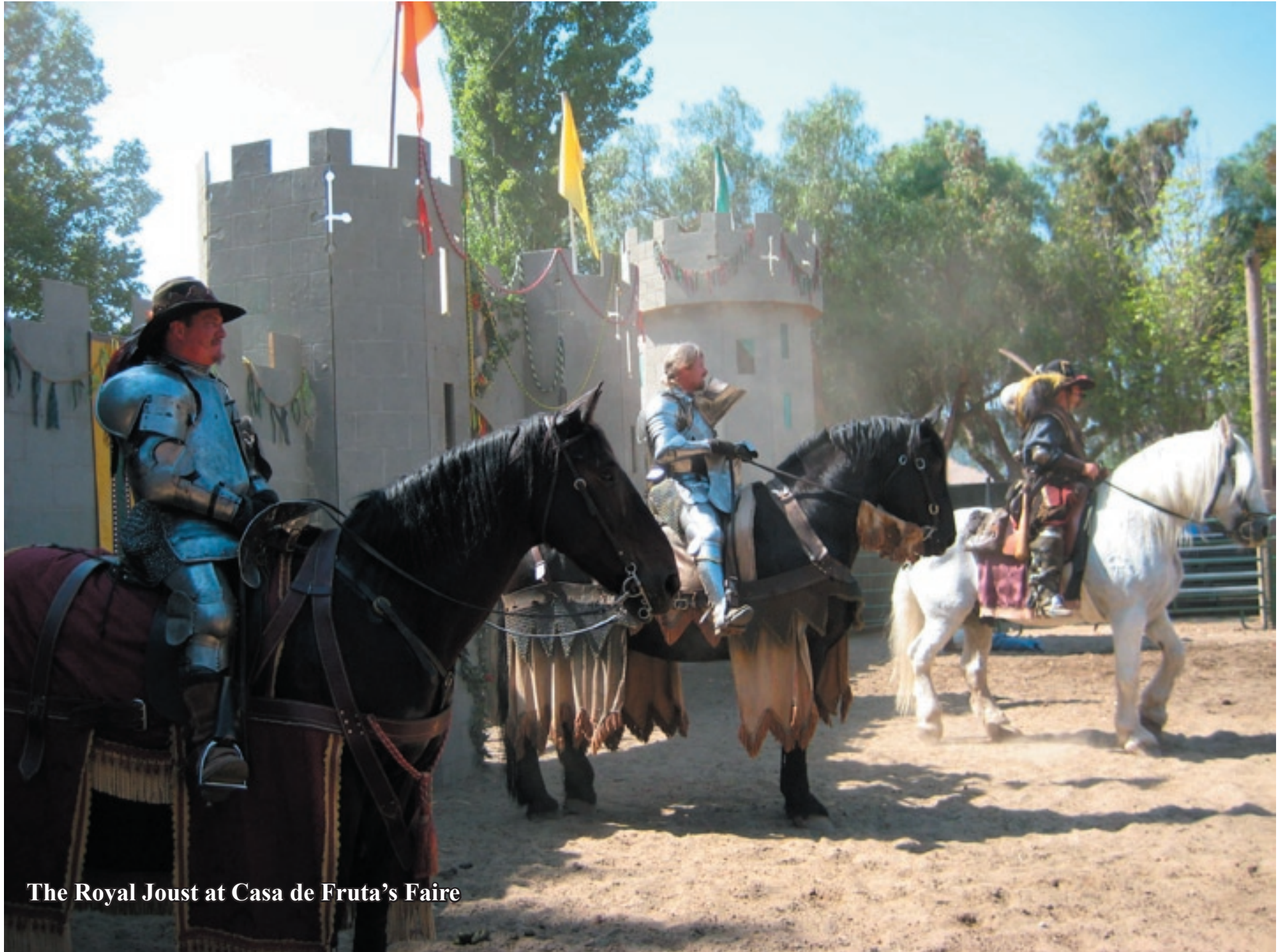
The Royal Joust at Casa de Fruta's Faire