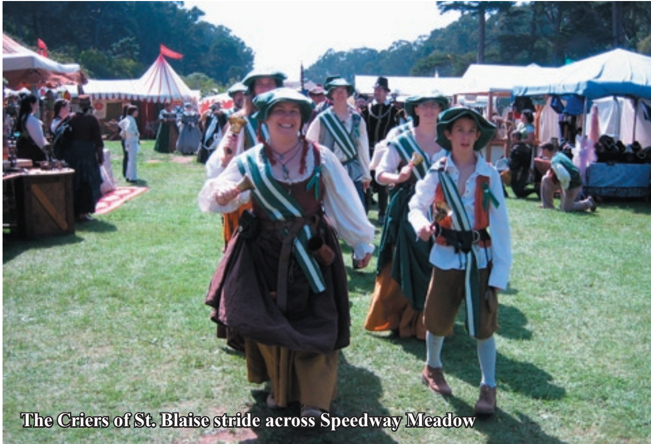
The Criers of St. Blaise stride across Speedway Meadow

them there by chance or by design. We're lucky to have two Ren Faires in the Bay Area now. We used to have only one, in Novato, which I still think was the best. But then again, that might