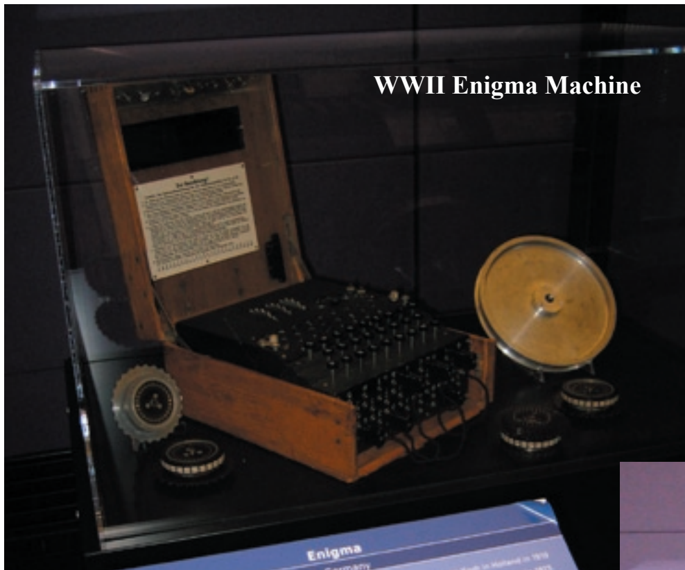
WWII Enigma Machine

View, and Chris was happy to transplant himself back to the area.