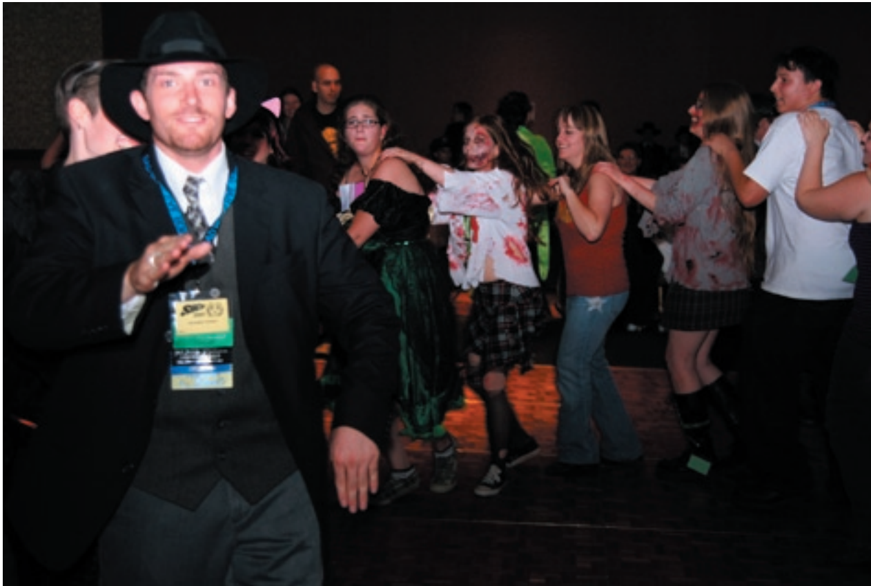
The Browncoats rocked the Saturday Night Shindig.