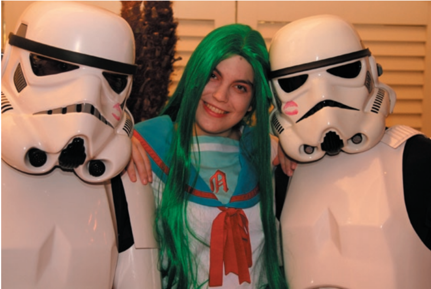
Hall costumes were a highlight.