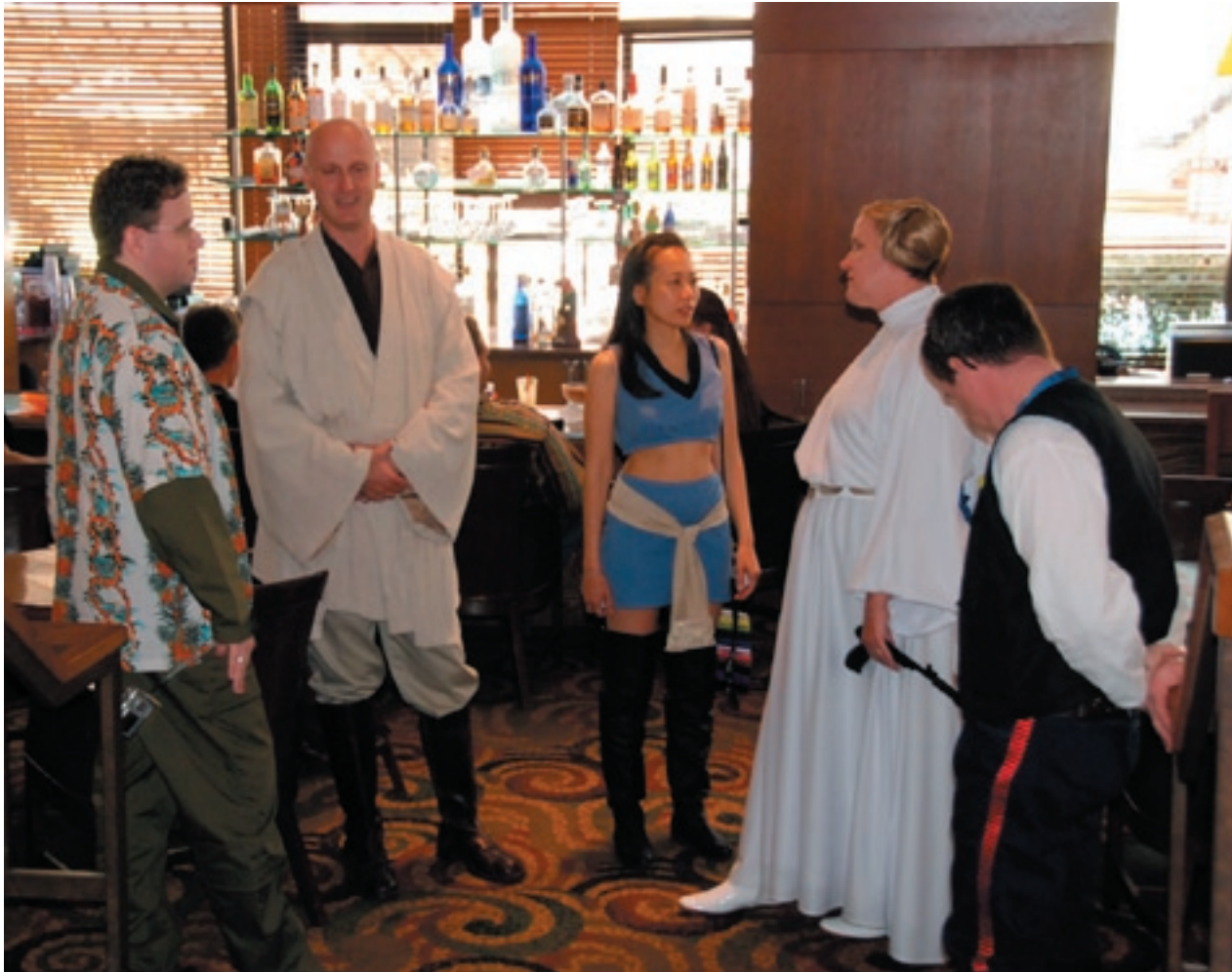
Media fans mingle in the “Quiet Bar.”