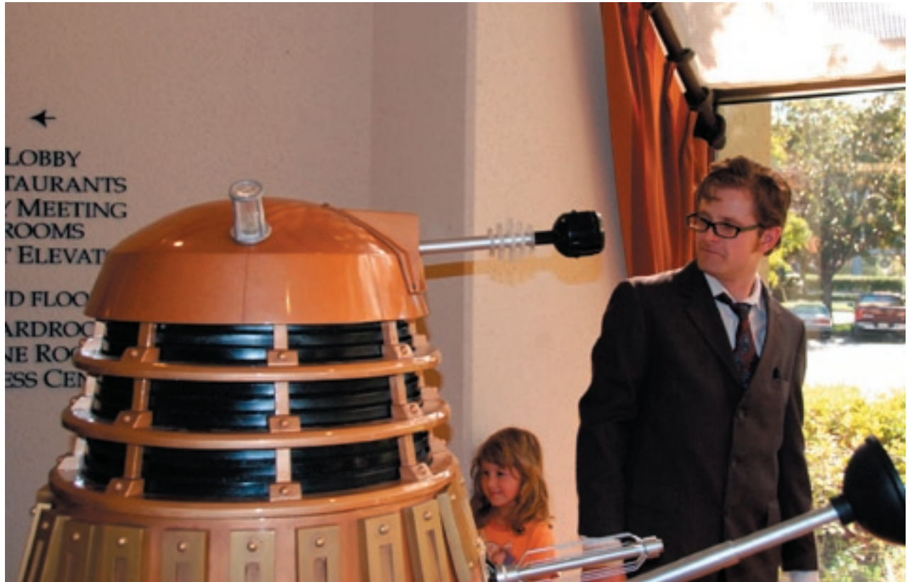
The DoubleTree's lobby hums once again.

This was the biggest problem for the entire con. The program book looked great, had a wonderful Jim Mahfood cover, and was actually well-proofread. The problem was that the schedule in the book was nearly useless. Of the panels that I'd been put on, only one was at