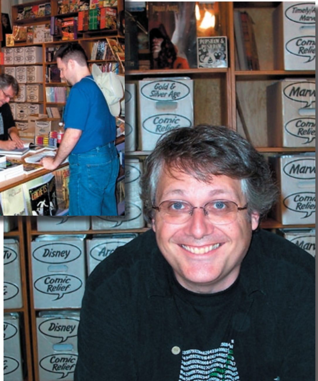
Cartoonist and author Scott McCloud recently visited Comic Relief in Berkeley as part of his nationwide book signing tour.