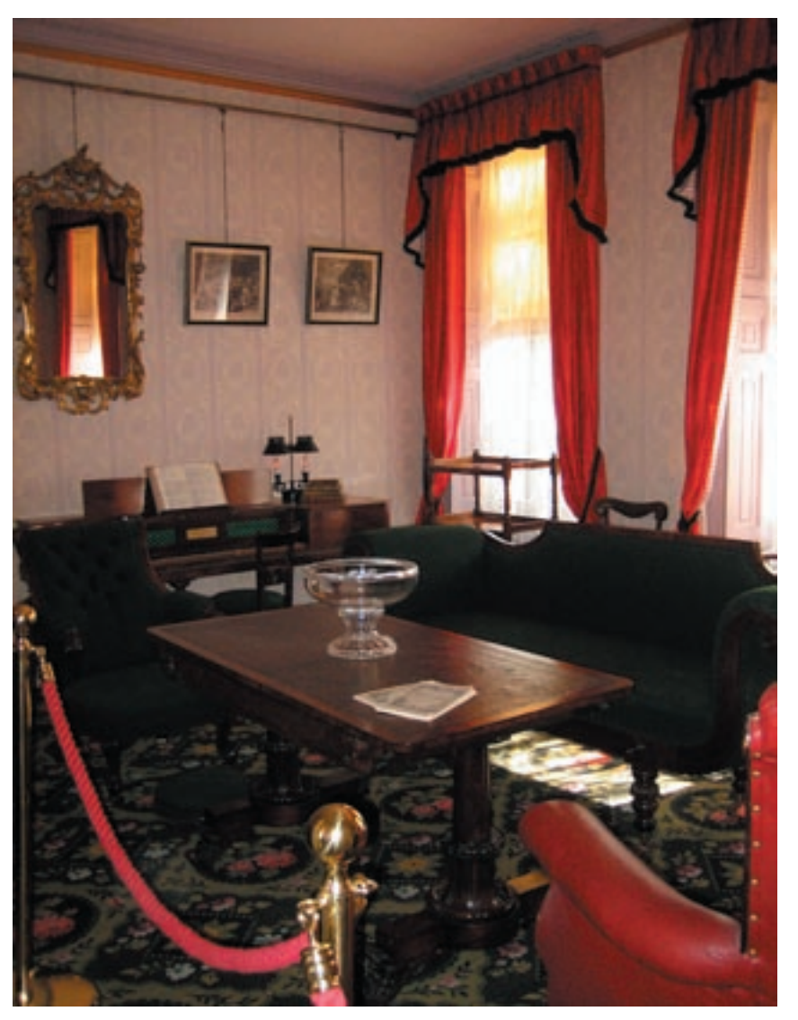
The Dickens Museum in London.

from my hotel. Being part of PEERS as well as loving Victorian dancing and costuming, and the Dickens Fair, of course, I had to see the Dickens Museum. It is actually a four-story townhouse where Dickens lived when he was a child. The