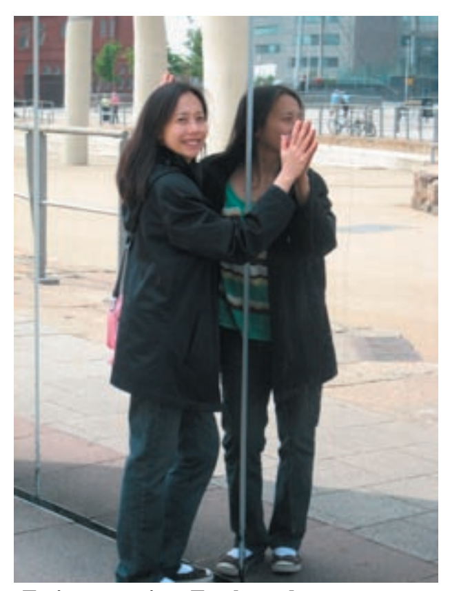
Trying to get into Torchwood.

bedsheets and lunch boxes to books and videos. After an initial stage of wanting everything, I wound up with just a t-shirt, a Sonic Screwdriver torch and an electronic cell phone charm. I only brought a very small suitcase, and I've decided not to spend money on stuff I don't really need. Besides, I already have a Tardis coin bank and