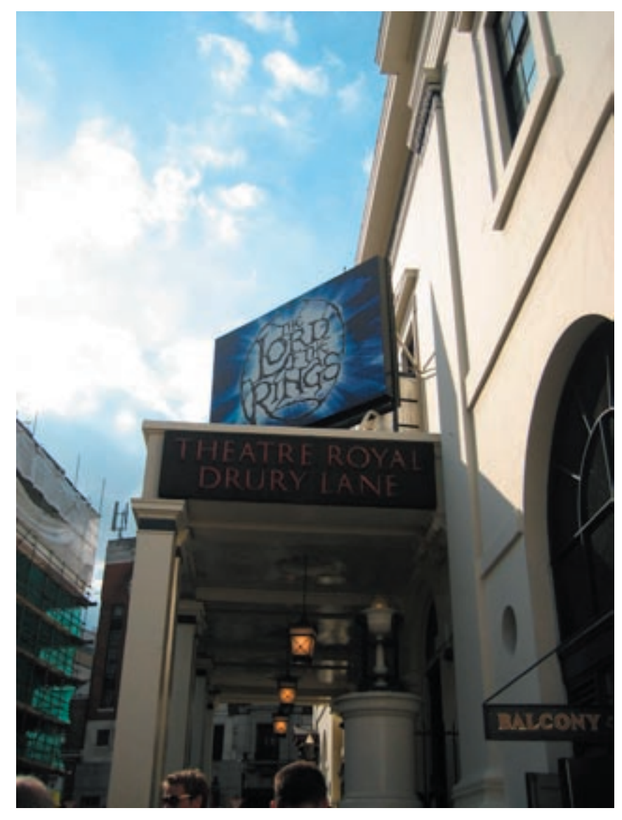
LOTR Musical at The Theatre Royal Drury Lane.

It was quite a thrill to actually be sitting in the orchestra! While we were waiting for the show to start, we were entertained by hobbits who ran around on stage and in the aisles trying to