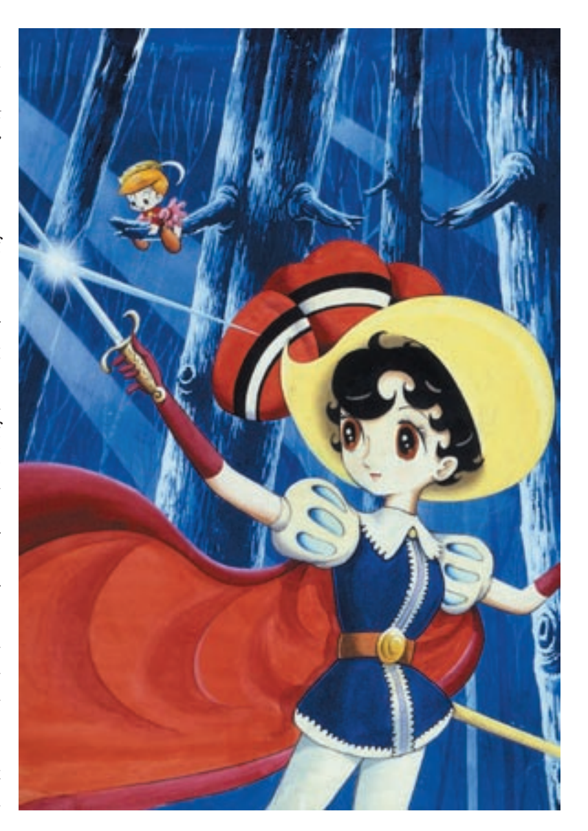
Title page for Princess Knight (Ribon no kishi), 1965, by Osamu Tezuka (1928–1989). Watercolor. © Tezuka Productions. Image courtesy Asian Art Museum

Sequential art has become so commonplace that it takes seeing From the science fiction of these three exhibits together to realize