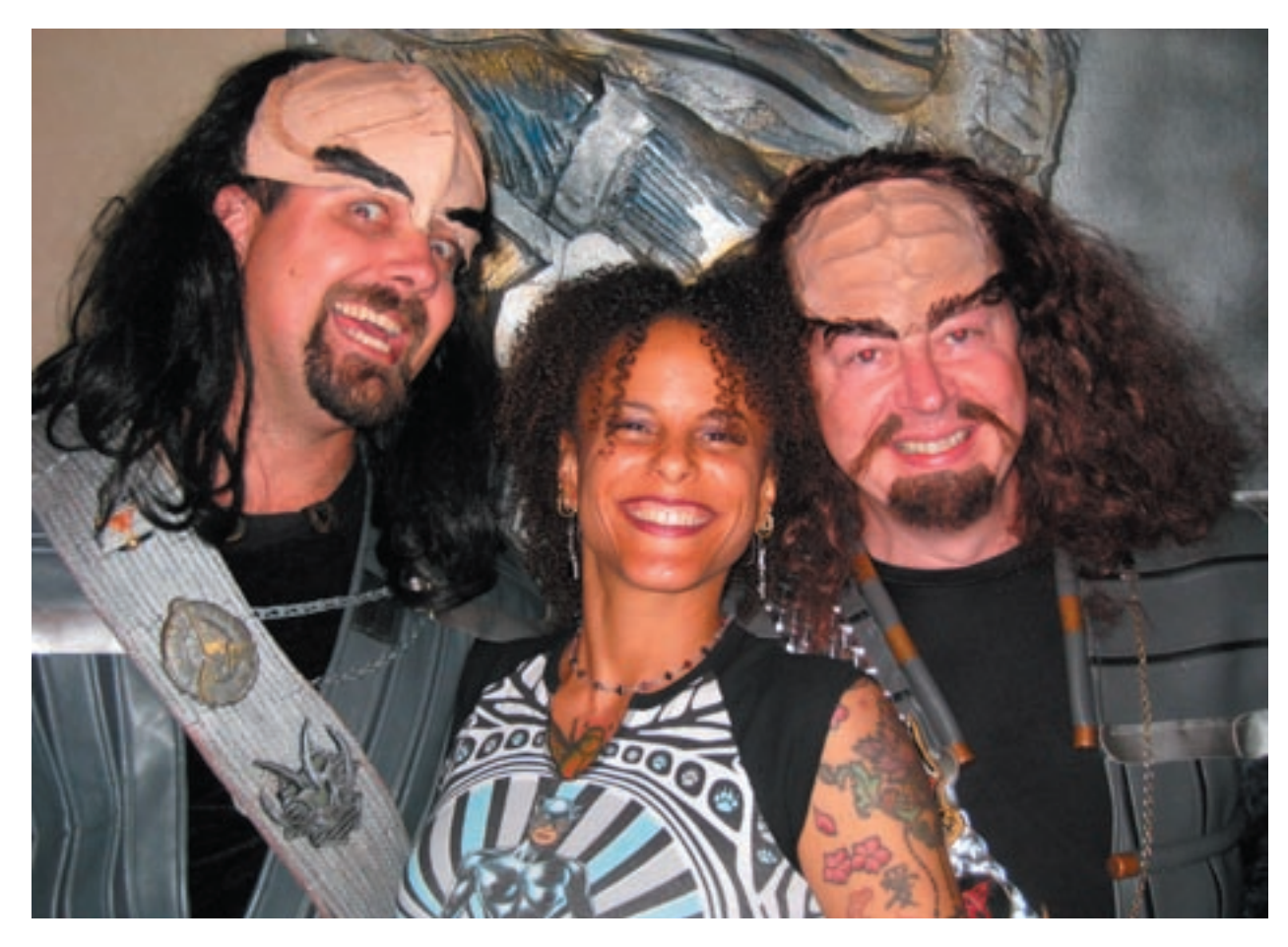
At least the Klingons were there to party!