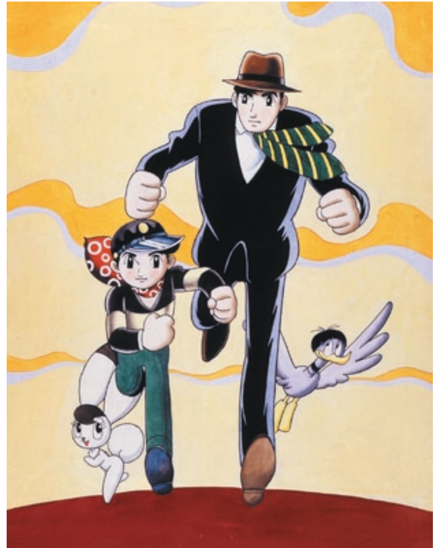
Title page for Wonder 3 (Wanda suri) , 1966 by Tezuka Osamu (Japanese, 1928–1989). Watercolor. © Tezuka Productions.

After enjoying the Taiko performance, I took a quick look around at the manga lounge. This wasn't a fan lounge like at a normal con, it was more of an exhibit space with examples of