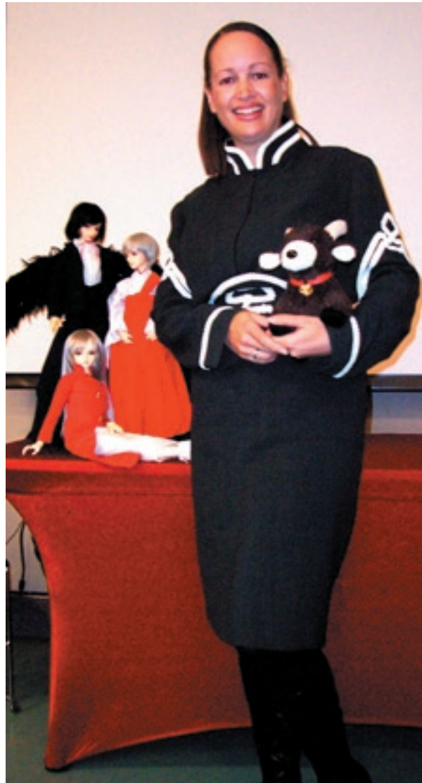
Haines & Dolls

Also amazing was the Yoshitoshi exhibit. These wood block prints are simply stunning.