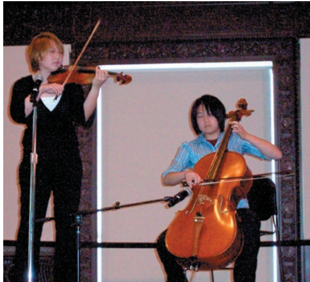
Ramen & Rice