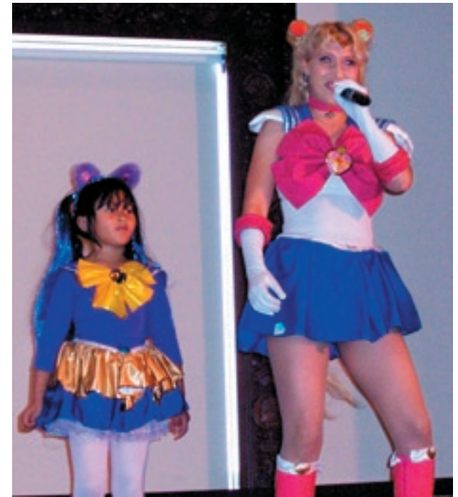
Luna & Sailor Moon

The second entry, Chado from the manga and anime “Bleach,” didn’t have a prepared act, but spurred on by the opening act gave an improvised rendition of “Twinkle, Twinkle,