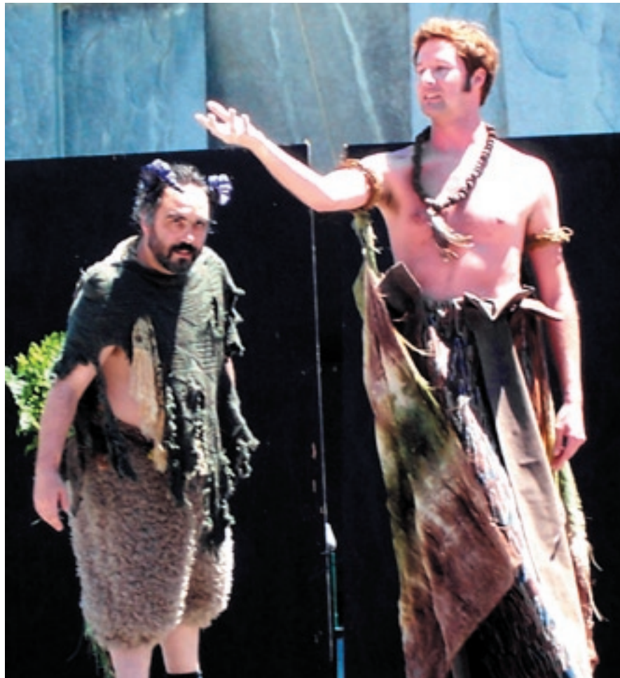
Puck and Oberon

The piece opened up with the lead signer invoking the feminine spirits and all that pseudo-religious Earth Mother mumbo jumbo. This was a pean to hippie-style feminist empowerment raised to a religious fervor,