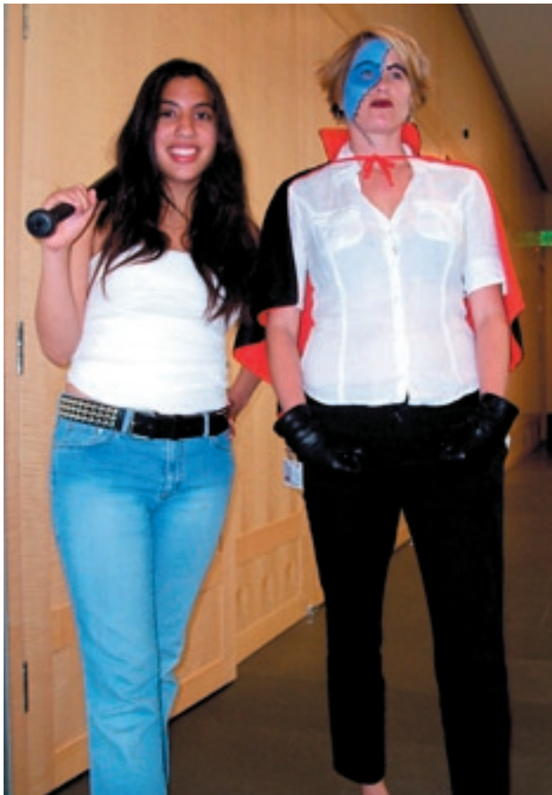
Black Jackie & Friend

Overall, I was surprised by the lack of familiar faces and how few cosplayers there were. There were just a couple of hall cosplayers and there were only six contestants in the cosplay contest. In fact, many of the cosplayers