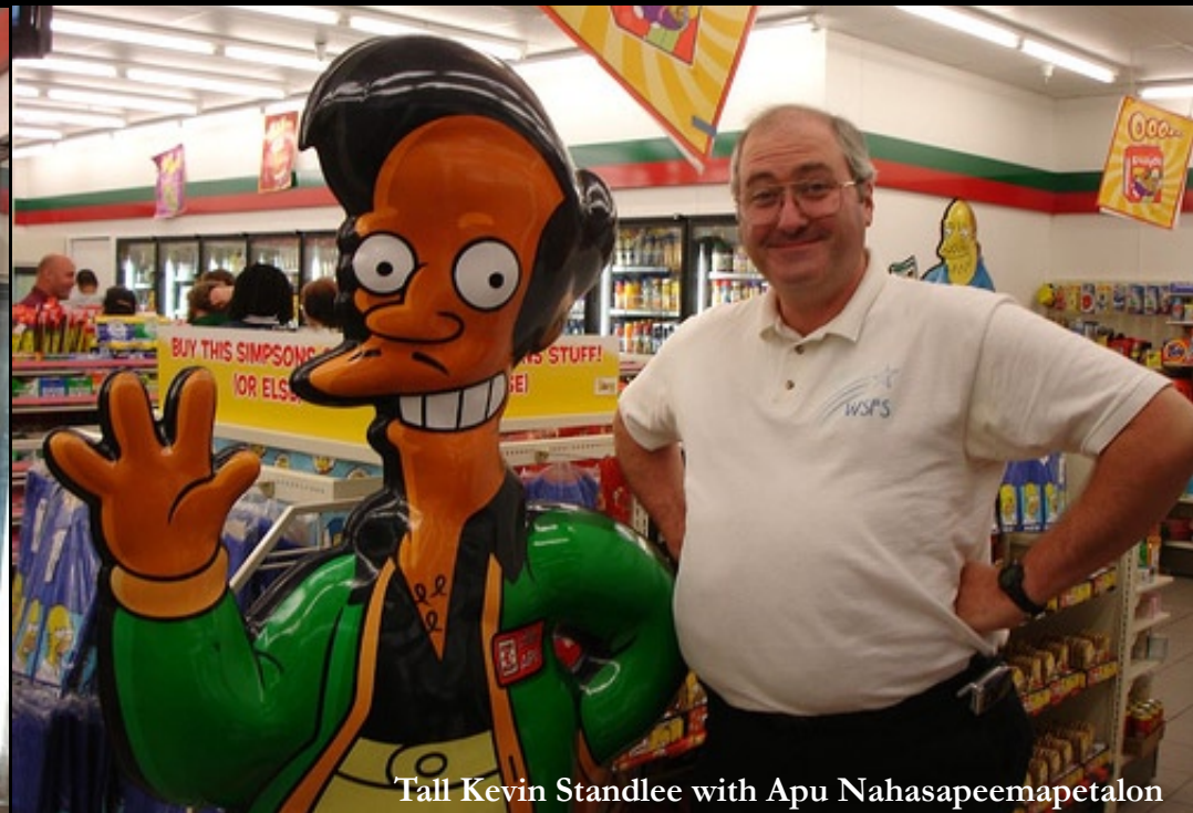
Tall Kevin Standlee with Apu Nahasapeemapetlon