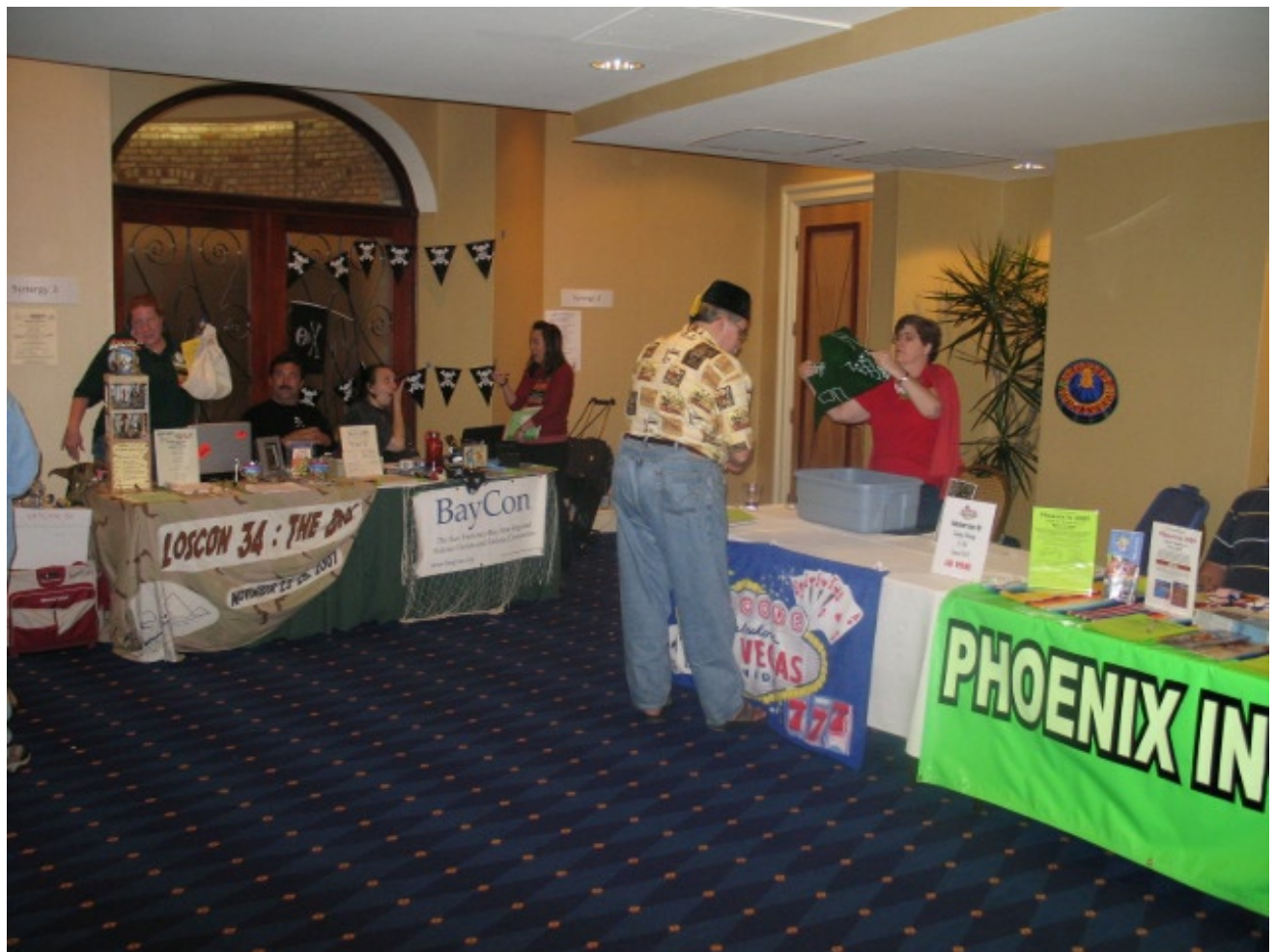
Loscon, BayCon, and the Las Vegas/Phoenix Westercon tables at Westercon 60

My newest project, researching the history of non-SF or music fanzines, has just started and I'm working on movie zines first. It would appear that the first film fanzines came out in the mid-1920s, though there are probably earlier ones. I'll