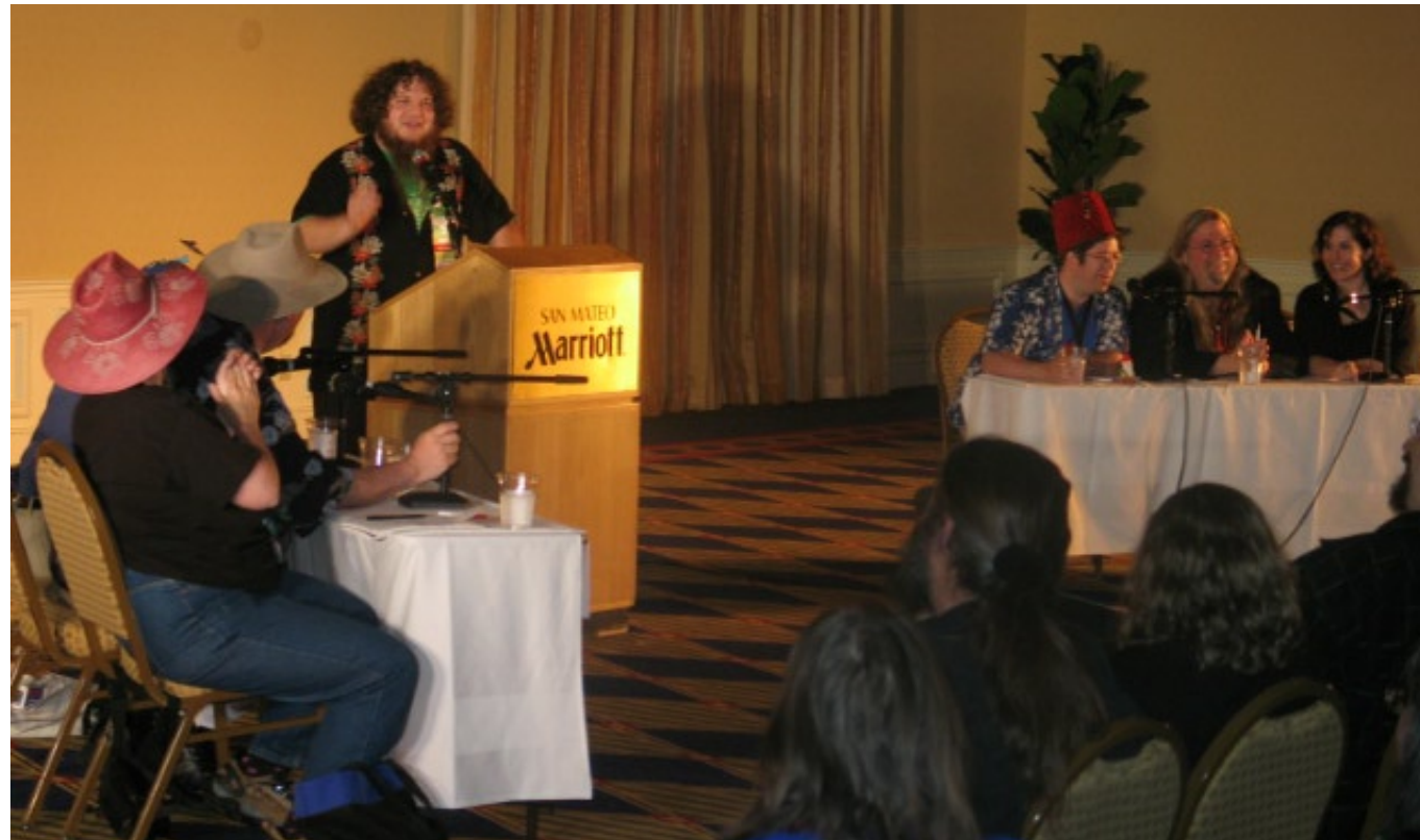
The Says You Game Show at Westercon on July 1st