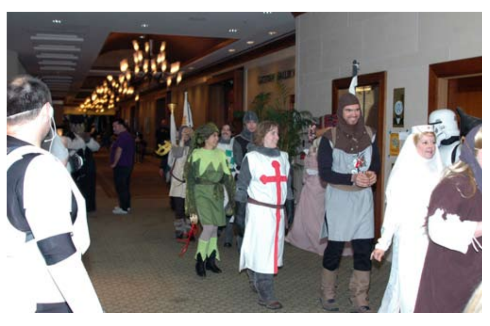
BayCon 2006 Masquerade: Spam-ish Inquisition