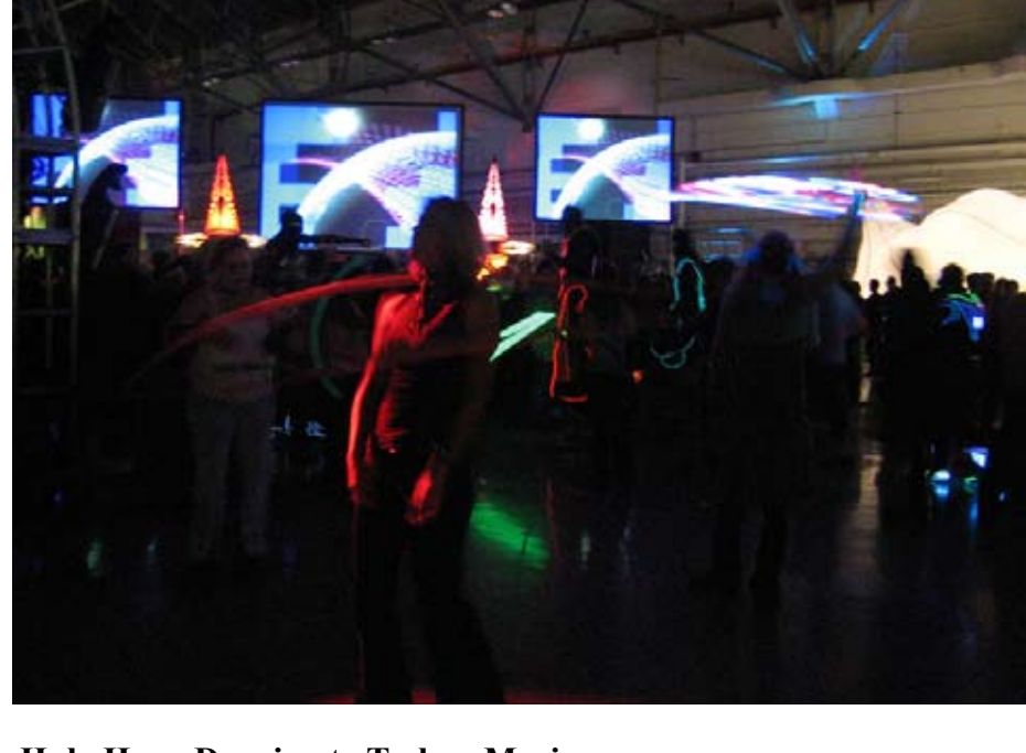
Space Cowboys DJ Art Car

continuously from live DJs (like Plaid from LEDs. the U.K. and Telefon Tel Aviv) and from recordings. Accompanying the music were projections of colorful images on the walls and smoke from smoke machines. There was another, smaller stage for dancing. Several people wore Playa wear (such as the distinctive furry hats, coats and leg warmers coupled with sexy clothing that you often see at Burning Man). A few danced with unlit poi (fire dancing) and hula hoops. And there were lots and lots of blinkies (blinking LED lights). Google had a tent and representatives were handing out Google pins with flashing multi-colored