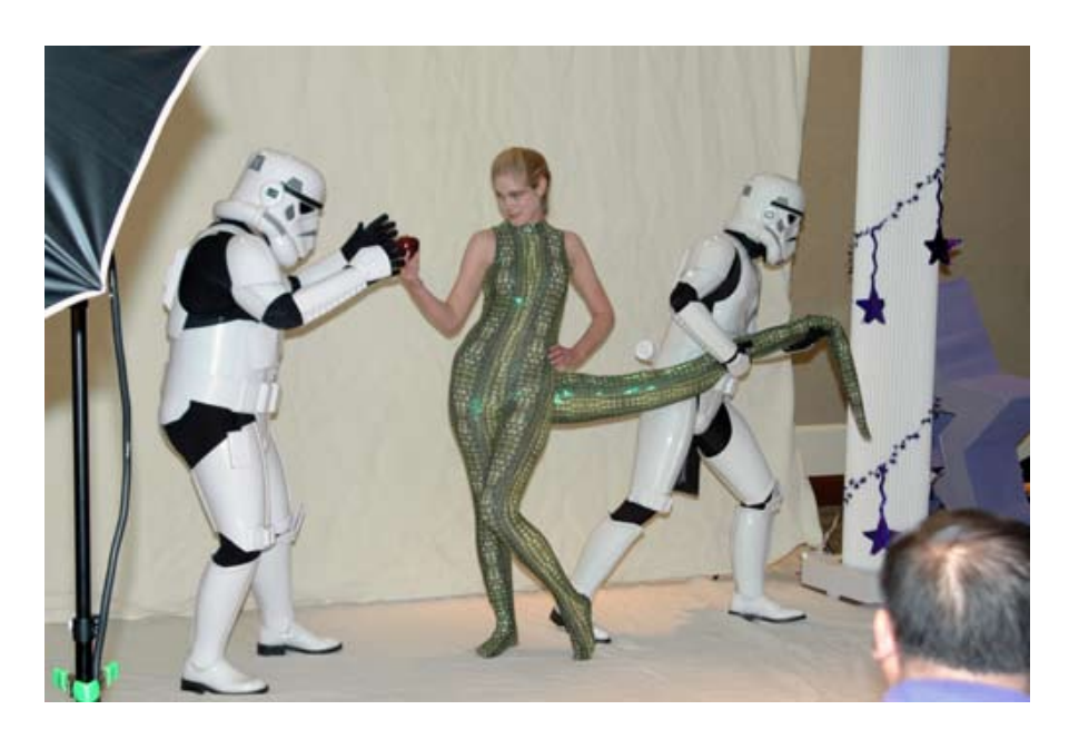
BayCon 2006 Masquerade: Snake Lady and Troopers