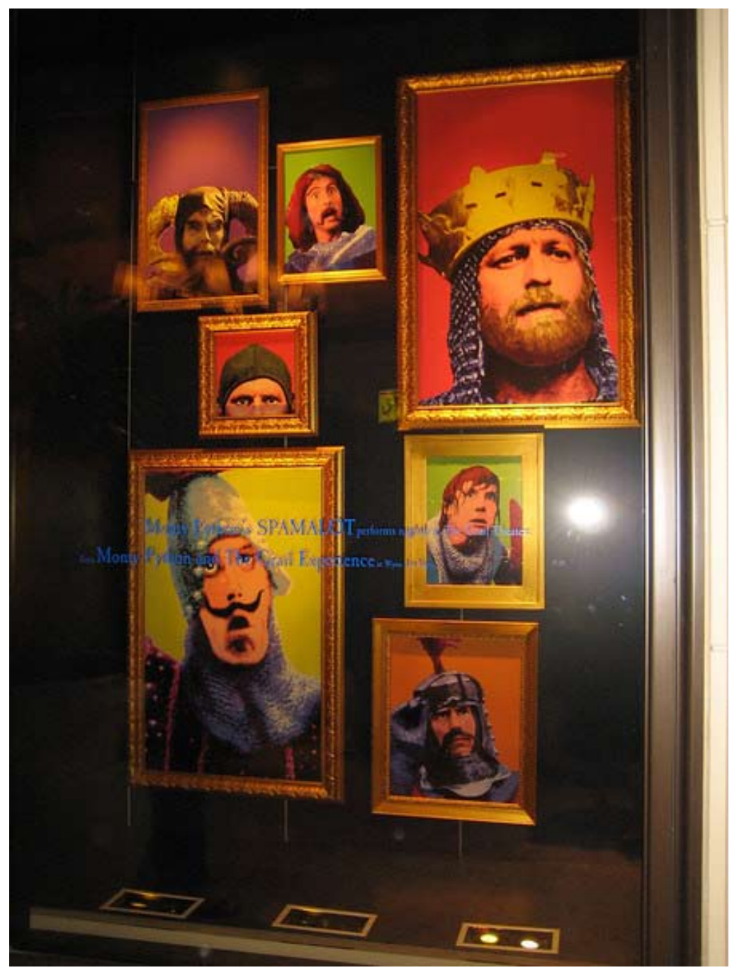
Spamalot Display at the Wynn

But once we got to the speciallydesigned Grail Theater, where Spamalot was playing, you really knew you had arrived in Monty Python -land. There were Pythonesque signs and artwork in the long hallway, at the main lobby, inside the theater... everywhere! It was quite spectacular and surreal at the same time.