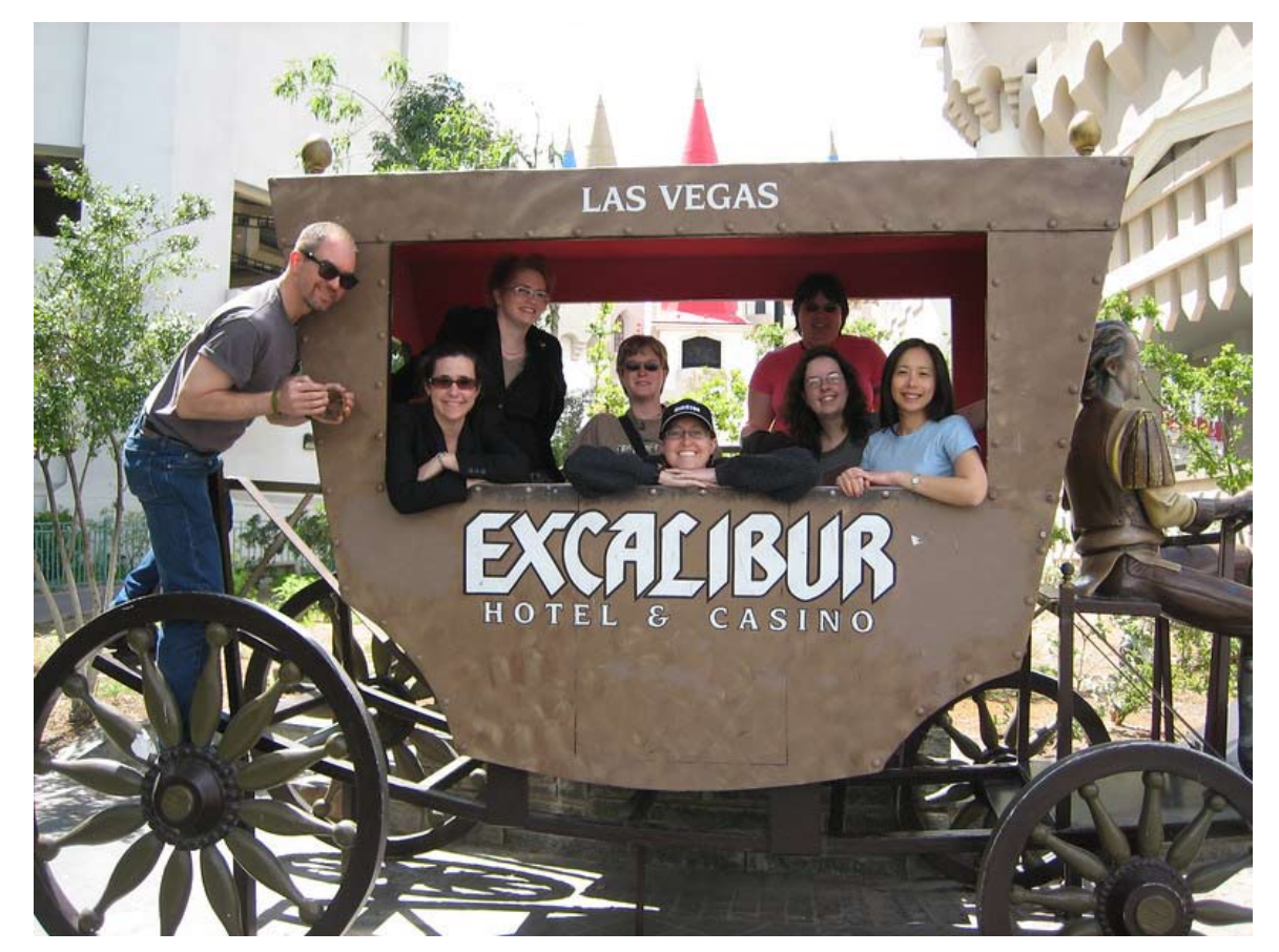
Spamalot Crew at Excalibur

make it along with several significant others family and for work, but never with friends. The adventure began when most of us were Going to Vegas with a big group of on the same Southwest Airlines flight out friends who all like to do the same things of San Jose International Airport. I'd never and have the same interests proved to be flown on that airline or out of that airport a lot of fun. I've been to Vegas before with so these were all firsts. I was half asleep and