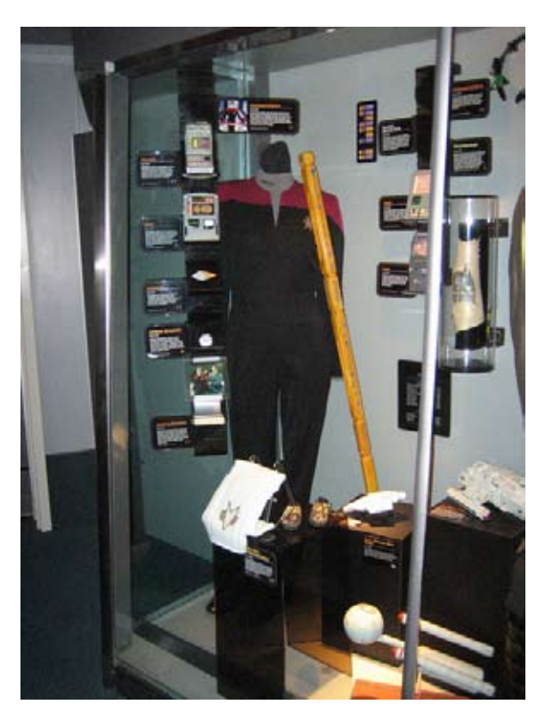
Capt. Janeway Costume at Star Trek Experience

I remembered the "Klingon We got to Vegas with no Encounter" as being fun and original, but problems and checked I didn't enjoy it as much the second time into our hotel, the Best around. I think it's because I already knew Western Mardi Gras what it was going to be about. I'm not going Inn, close to the new to divulge much about it as I don't want to Wynn Hotel where the spoil anyone's first experience. I still highly musical was showing. recommend that every Star Trek fan see it, After checking in, we though. I also felt nauseous afterwards. I'm walked to the nearby very prone to motion sickness (that's why Hilton Hotel, where I I don't do Rotary Waltzes and Polkas), but was surprised to find out I don't remember feeling motion sickness