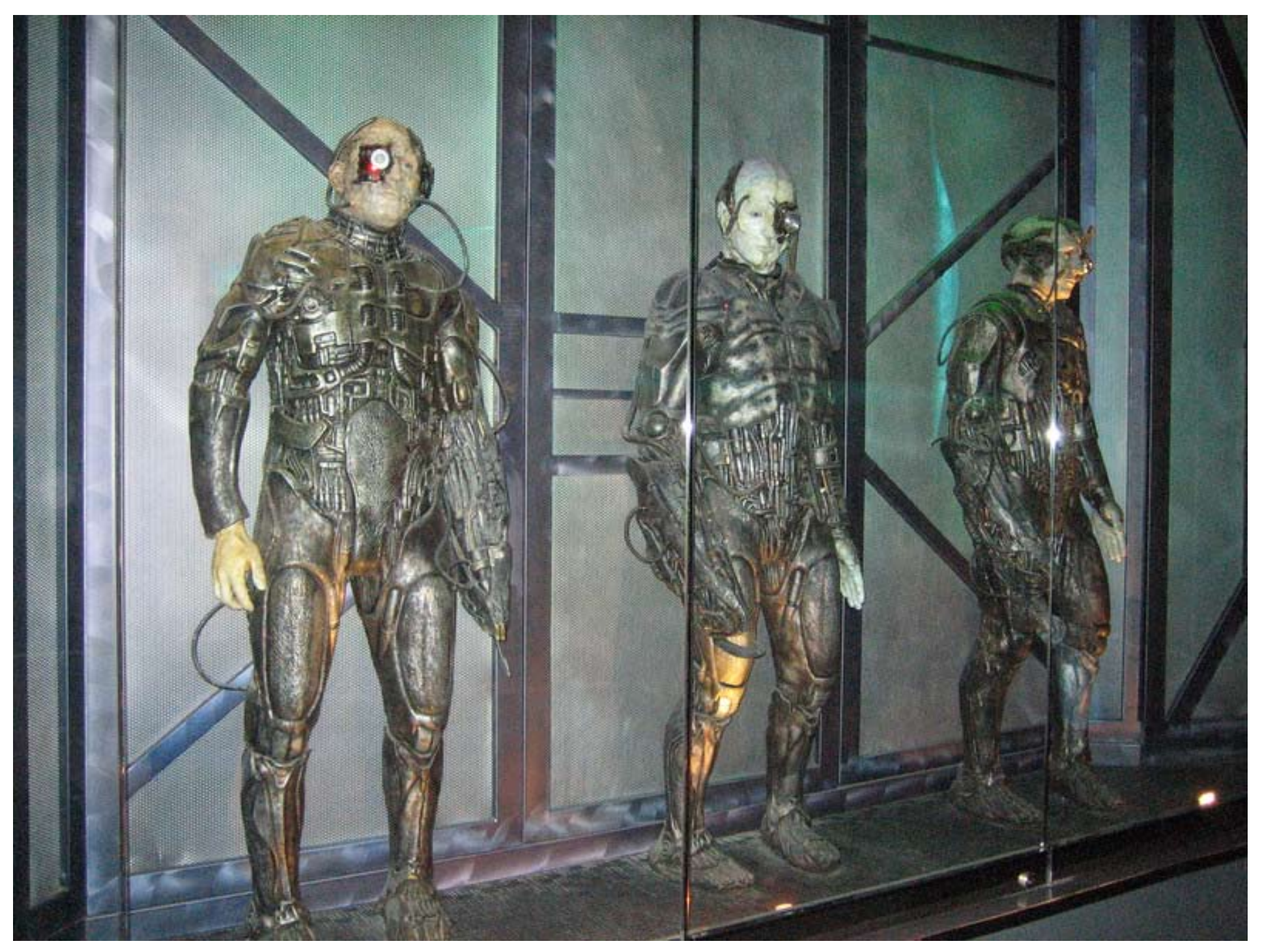
Borgs at the Star Trek Experience