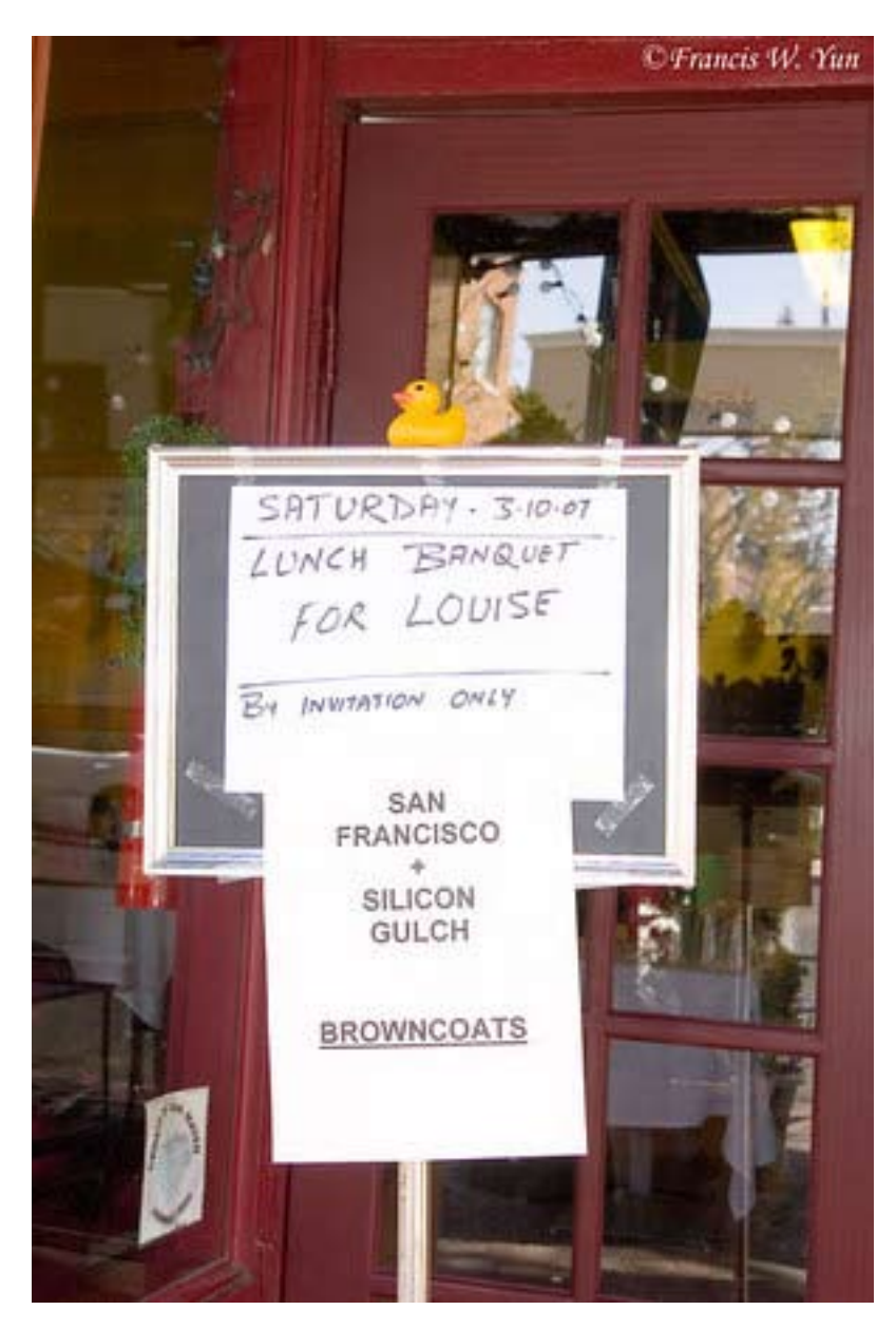
Joint Browncoat Lunch Banquet