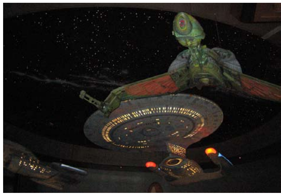
Enterprise and Bird of Prey