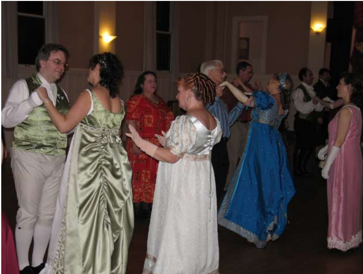
English Country Dancers

(BAERS), was held February 17 at the San Mateo Masonic Temple. Held around Valentine's Day, this particular ball is meant to be a romantic and flirtatious event in the style of the early 1800s.