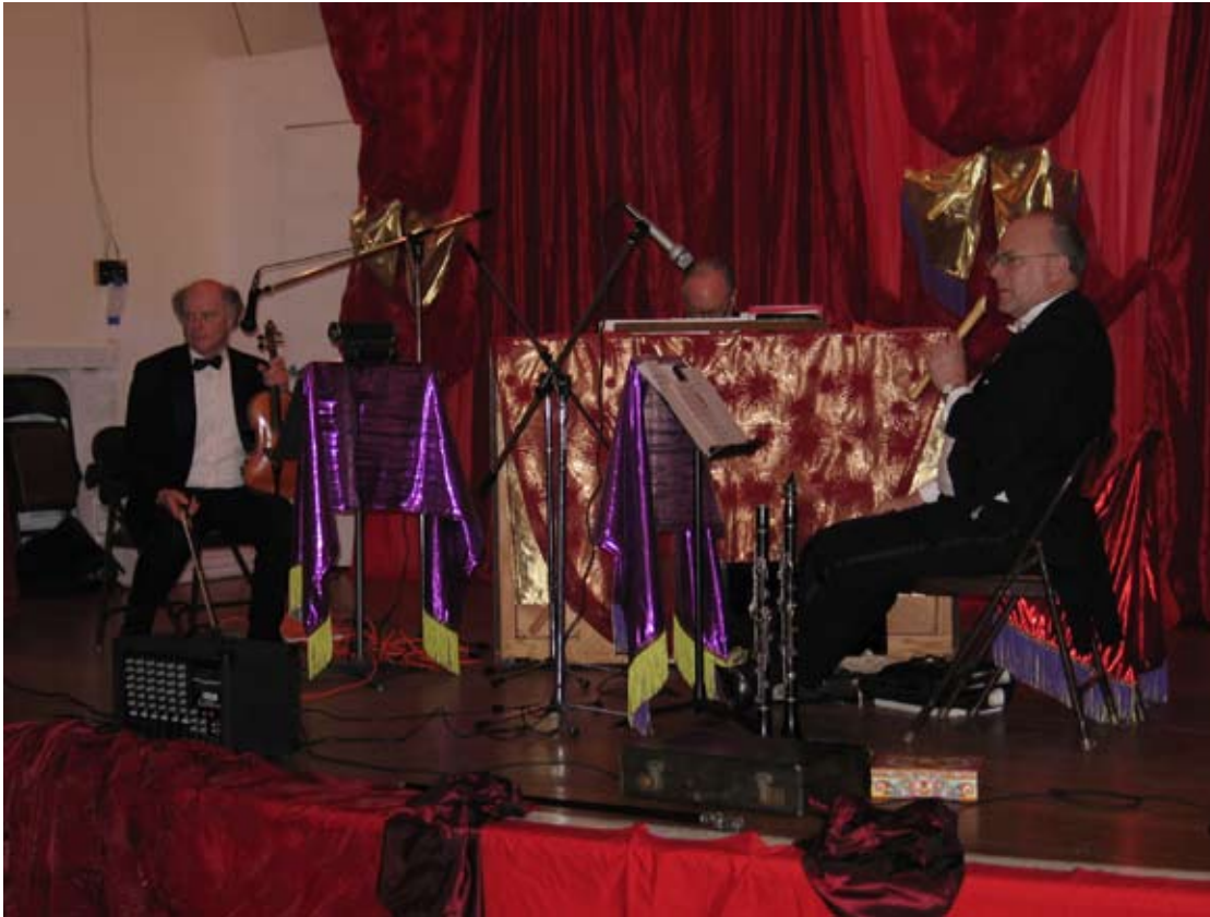
Divertimento Dance Orchestra

tunes. The dance can only be done to this music because the figures fit the unusual phrasing. In fact, it is that unusual phrasing, especially the long 14-bar A music that, in my opinion, makes the dance something special.