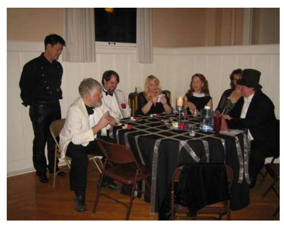
Gambers try their luck