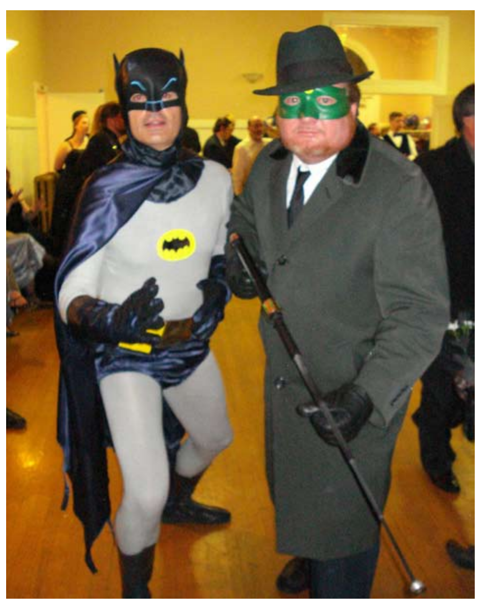
Batman and Green Hornet

if the character was showing up to a ball as their alter ego). I chose a tea-length black dress draped with sheer black that I would be Rachel to think of which