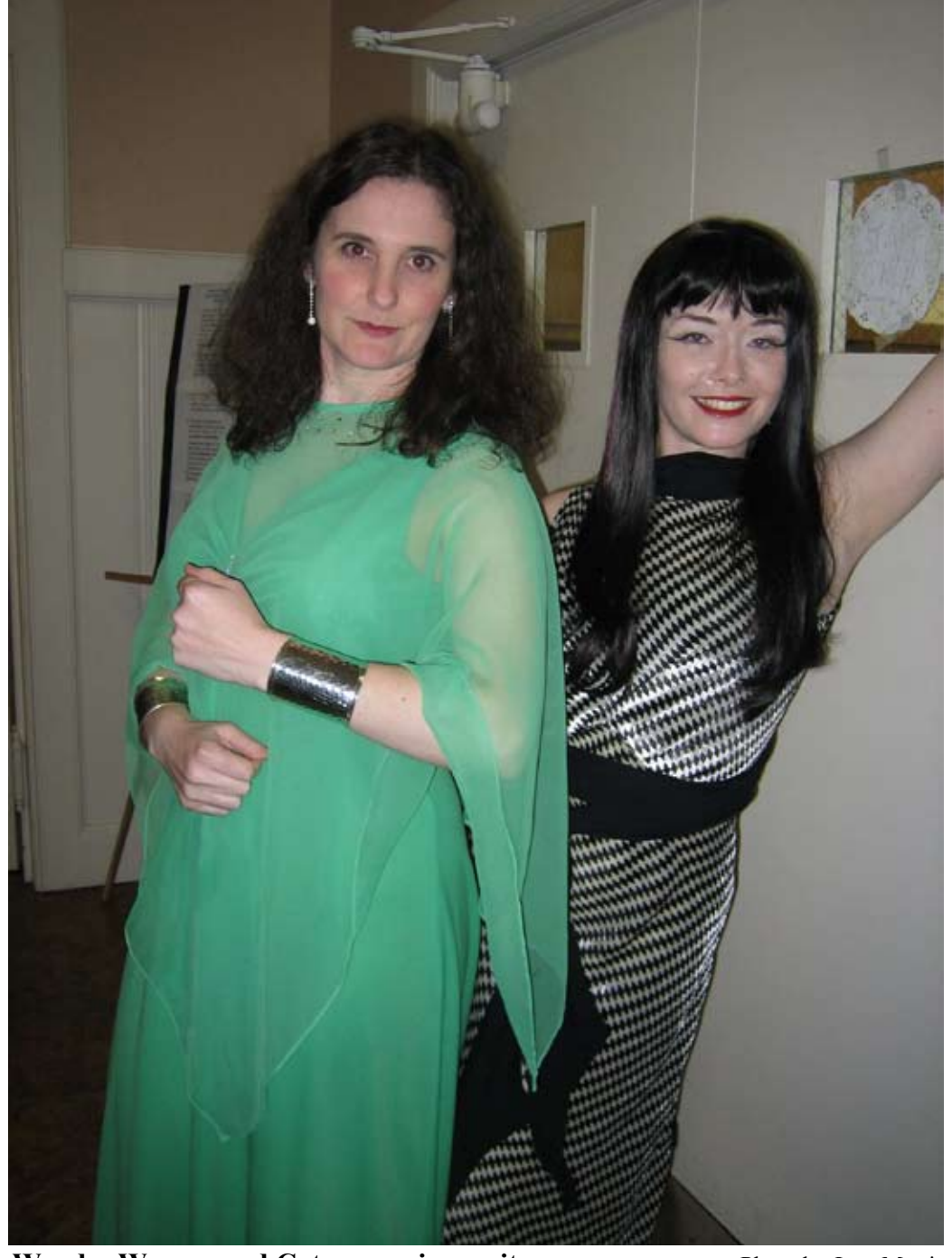
Wonder Woman and Catwoman incognito