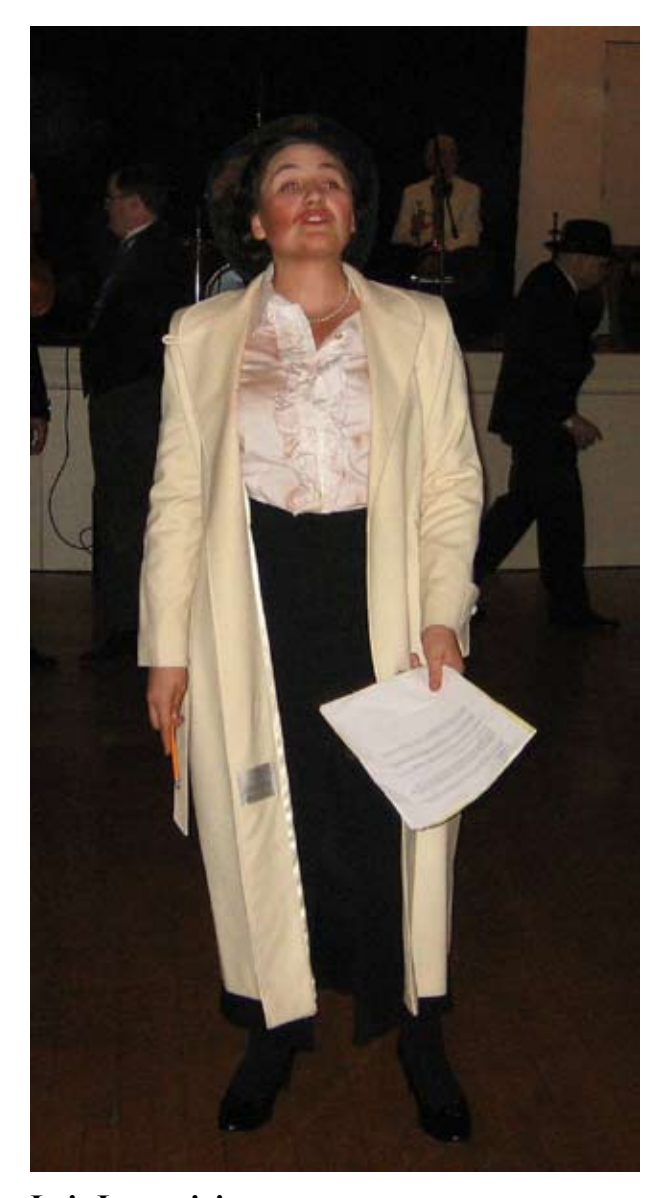
Lois Lane giving news updates