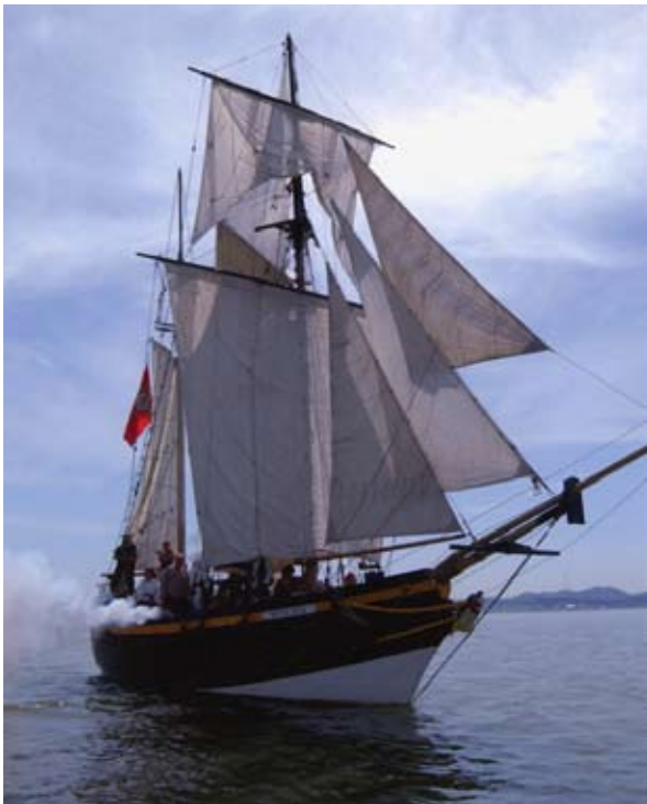
Royaliste in San Francisco

On Friday January 26, the tall ship Royaliste (a historic gaff-rigged ketch) went aground. She was making an inland waterway voyage from Georgia to her new home with a maritime museum in North Carolina when the accident occurred.