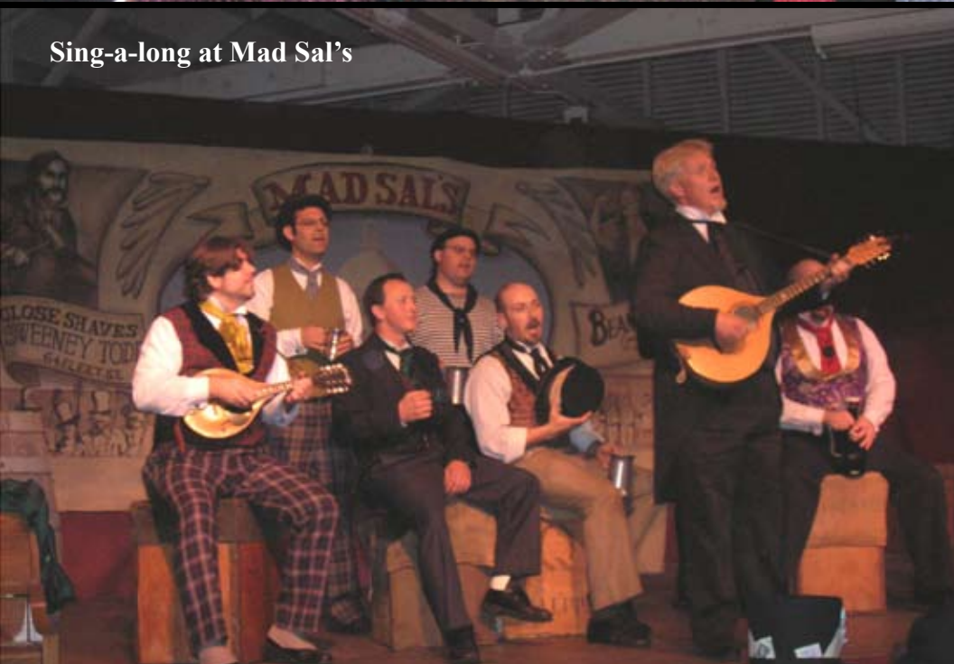
Sing-a-long at Mad Sal's