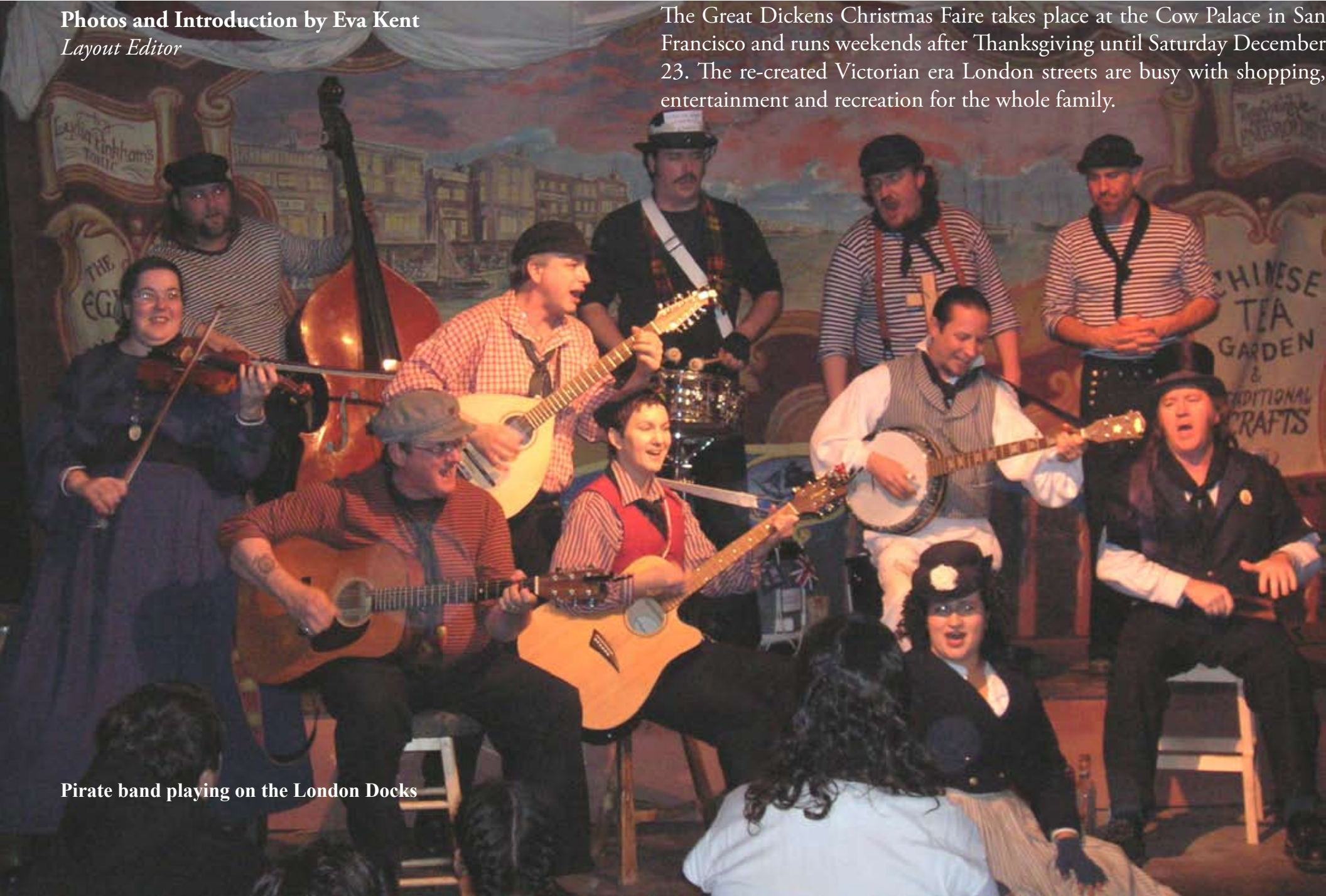
Pirate band playing on the London Docks

The Great Dickens Christmas Faire takes place at the Cow Palace in San Francisco and runs weekends after Thanksgiving until Saturday December 23. The re-created Victorian era London streets are busy with shopping, entertainment and recreation for the whole family.