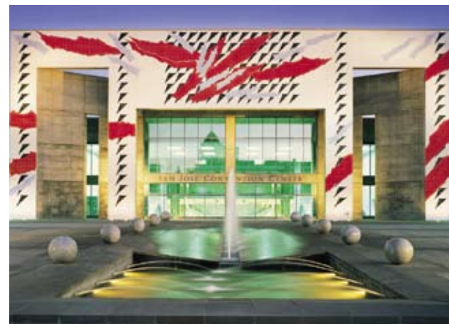
The San Jose Convention Center, scene of ConJose 2002