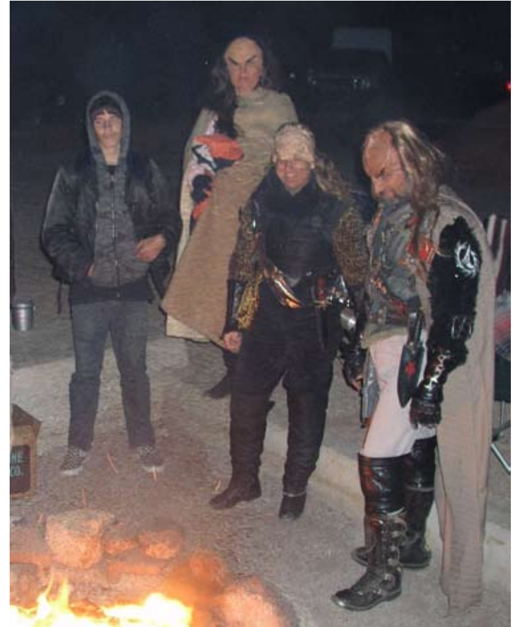
Klingons gather by the fire

then made the announcement that life situations she has been experiencing lately have made it impossible for her to continue to command the Ro for a time. To that end,