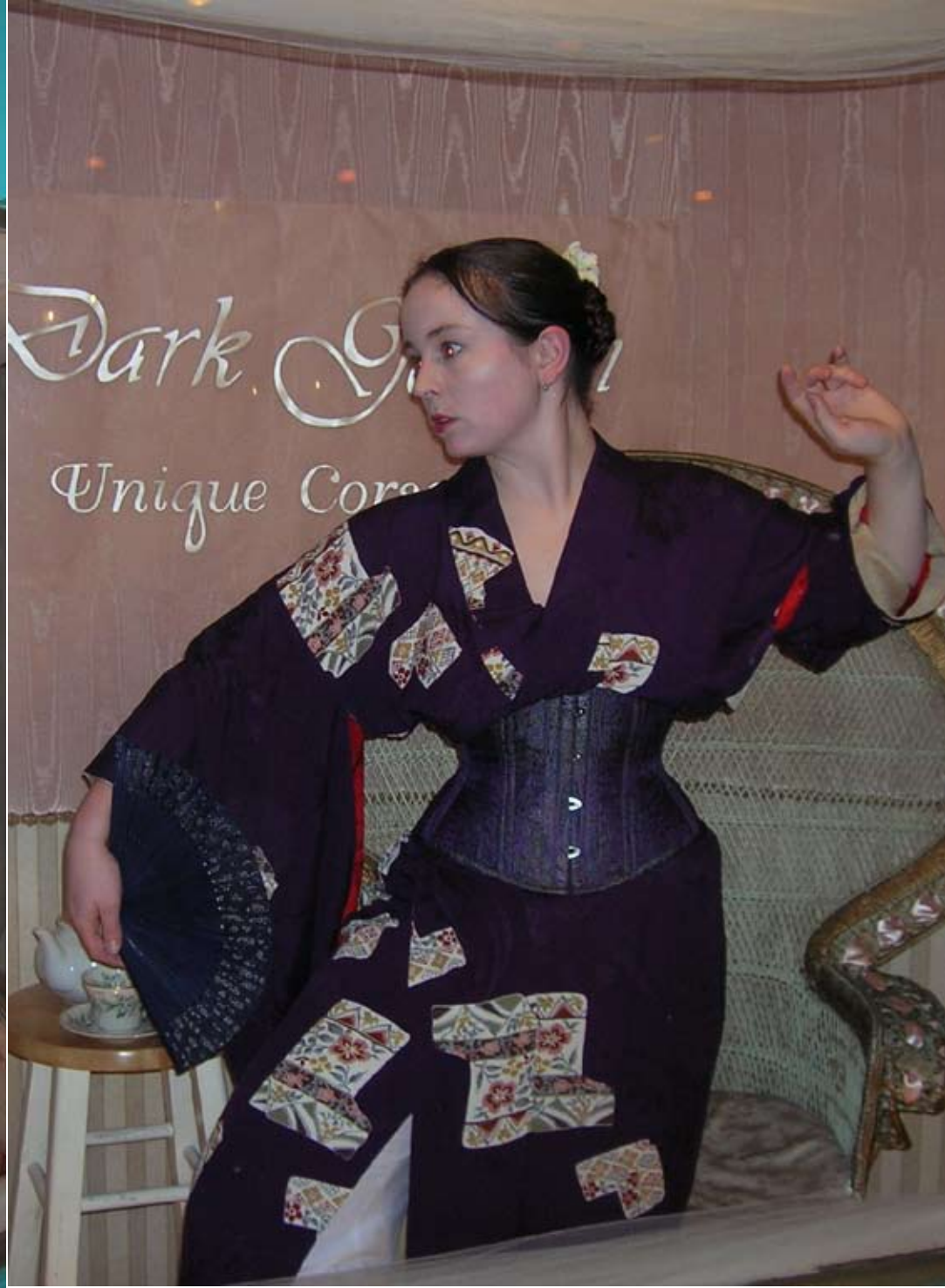
Corset model strikes a pose