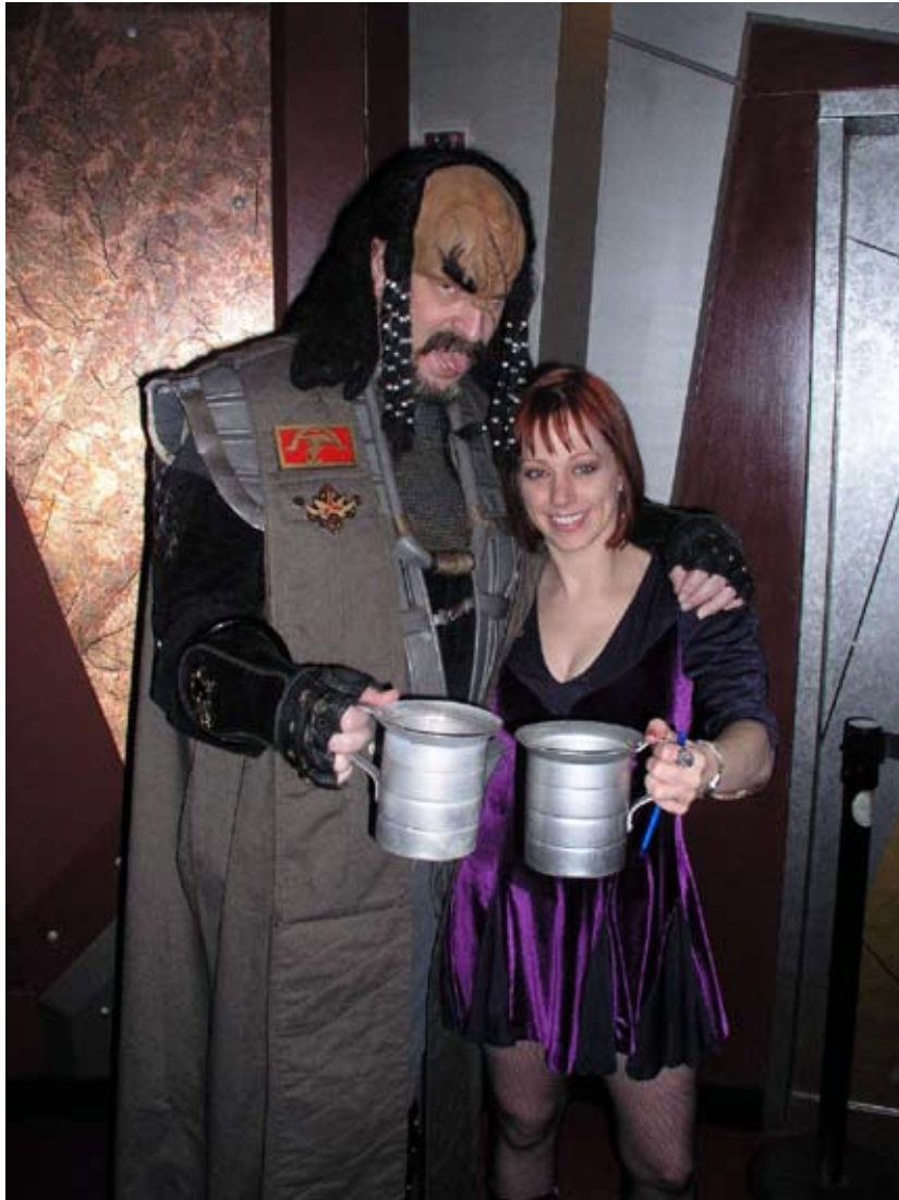
KataH warms up at the “Star Trek Experience”

Qapla’ to the Ring of Fire Fleet, and may we still stay strong.