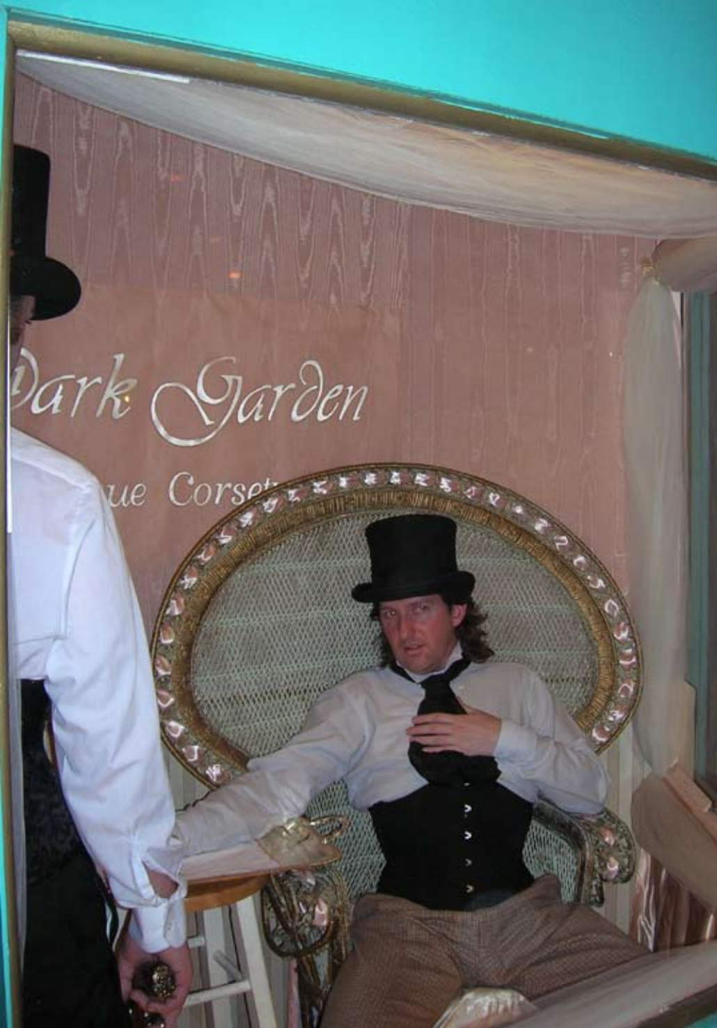
Victorian male models