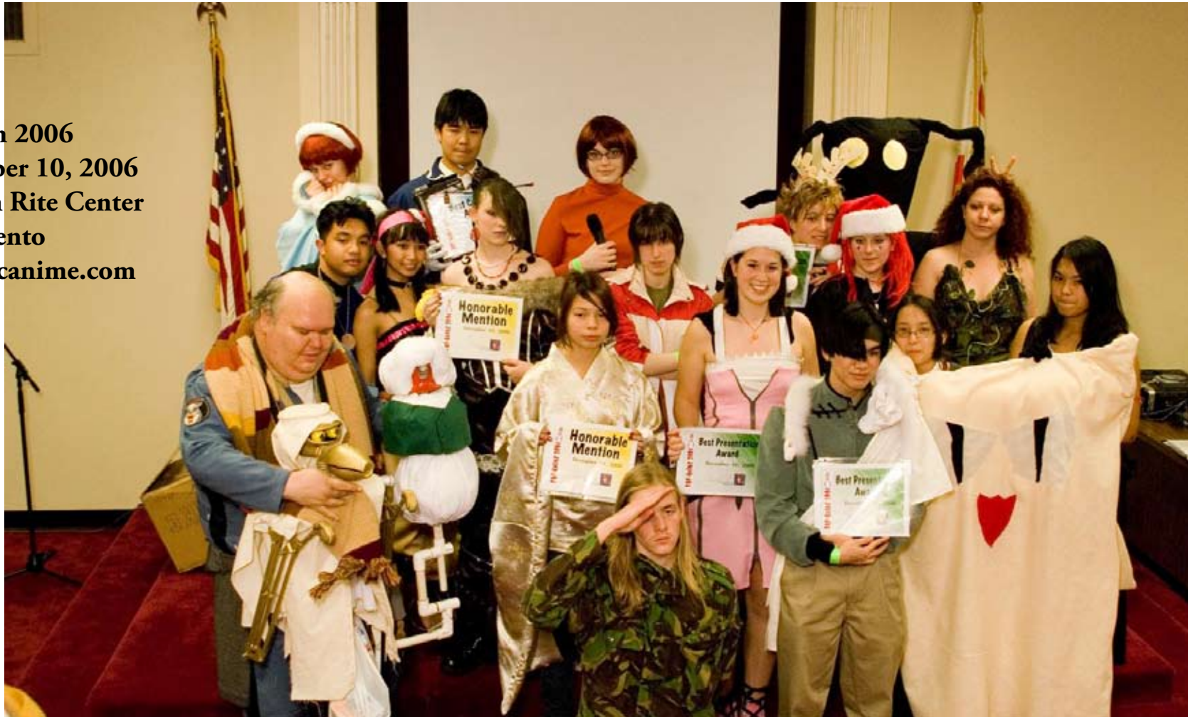
Winners at Sac-Con

Sac-Con 2006 December 10, 2006 Scottish Rite Center Sacramento www.sacanime.com