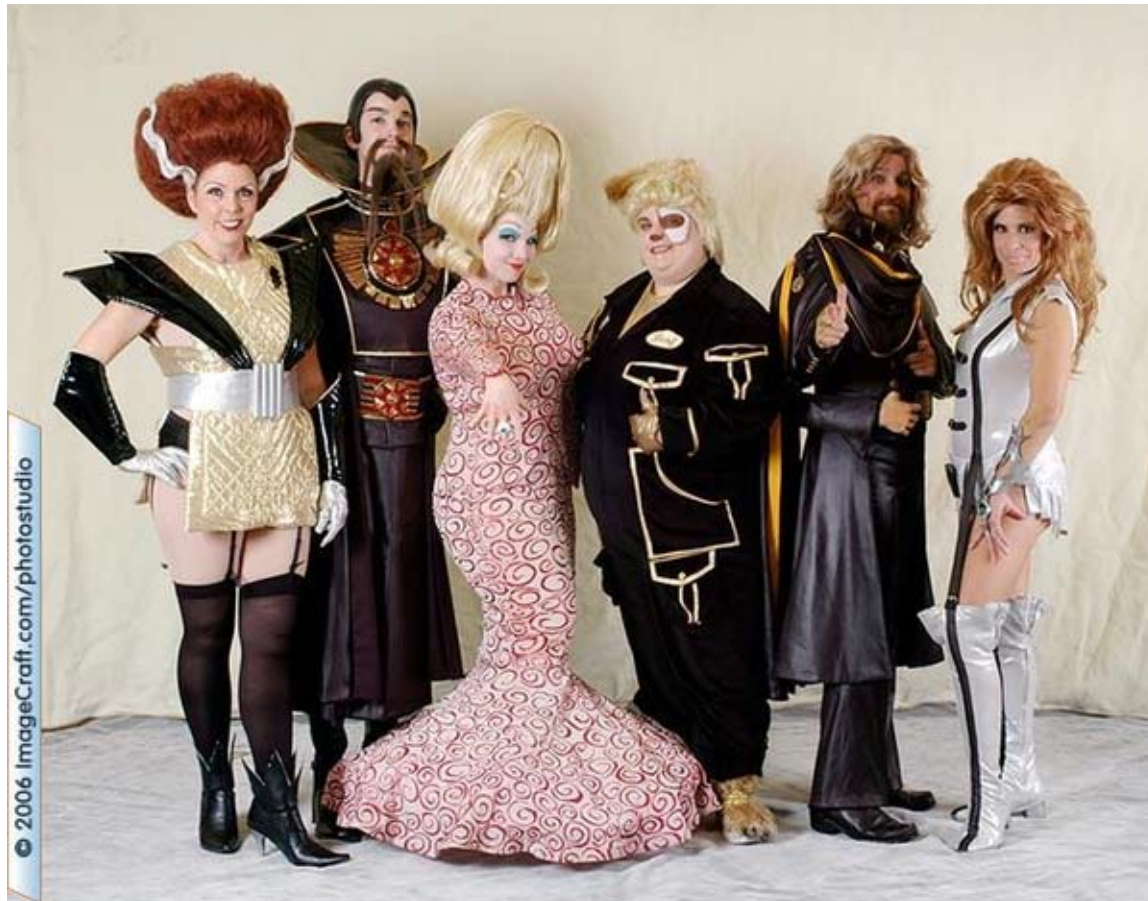
Dancing with Celebrities from the Stars