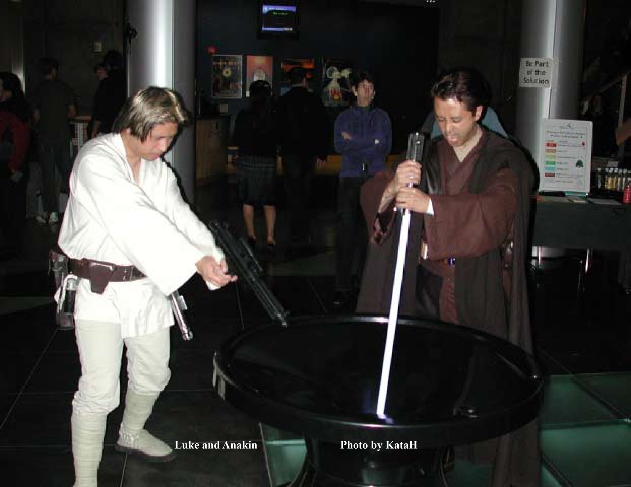
Luke and Anakin