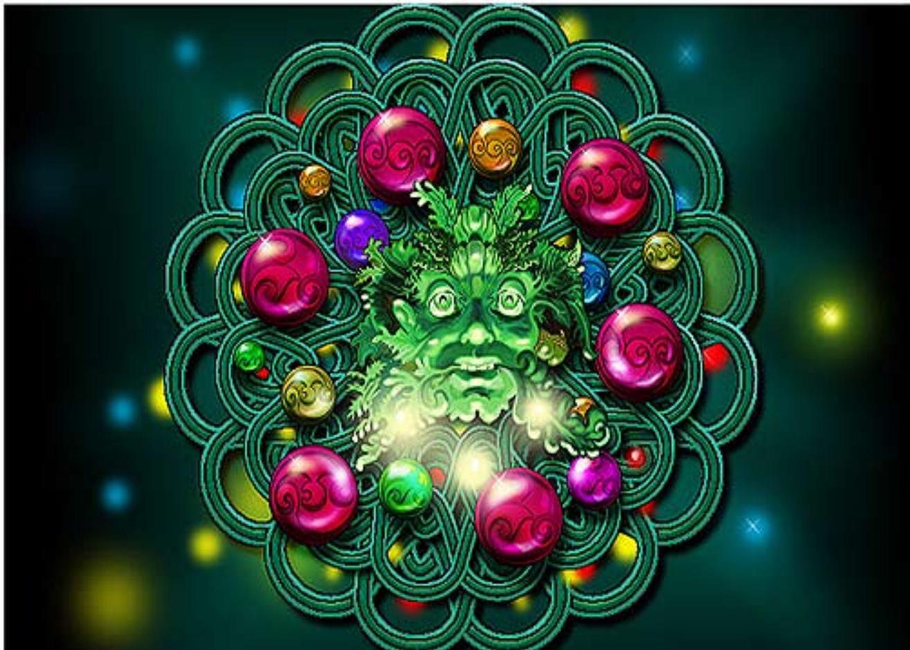
An Artist's Space www.mostarkey.com

And the rumor of the week was 'the AhwaneeCon chair's title will be "Dome Messiah."'