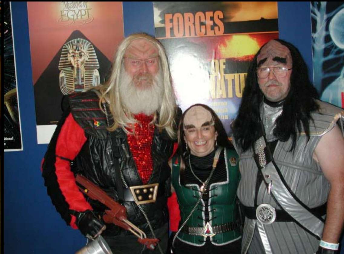
Klingon Cindy and Romulan Dakron