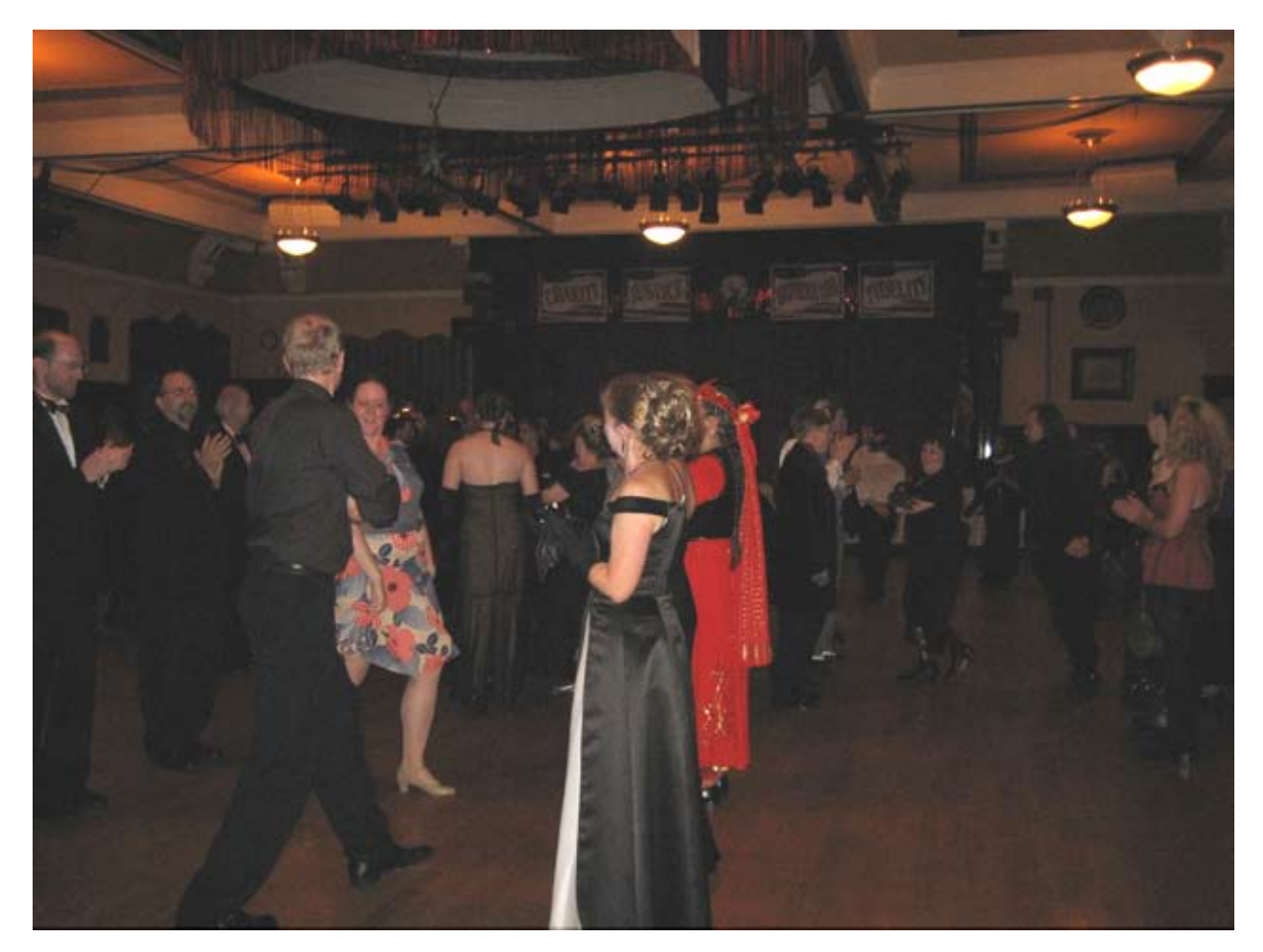
Country Dancing in Main Ballroom