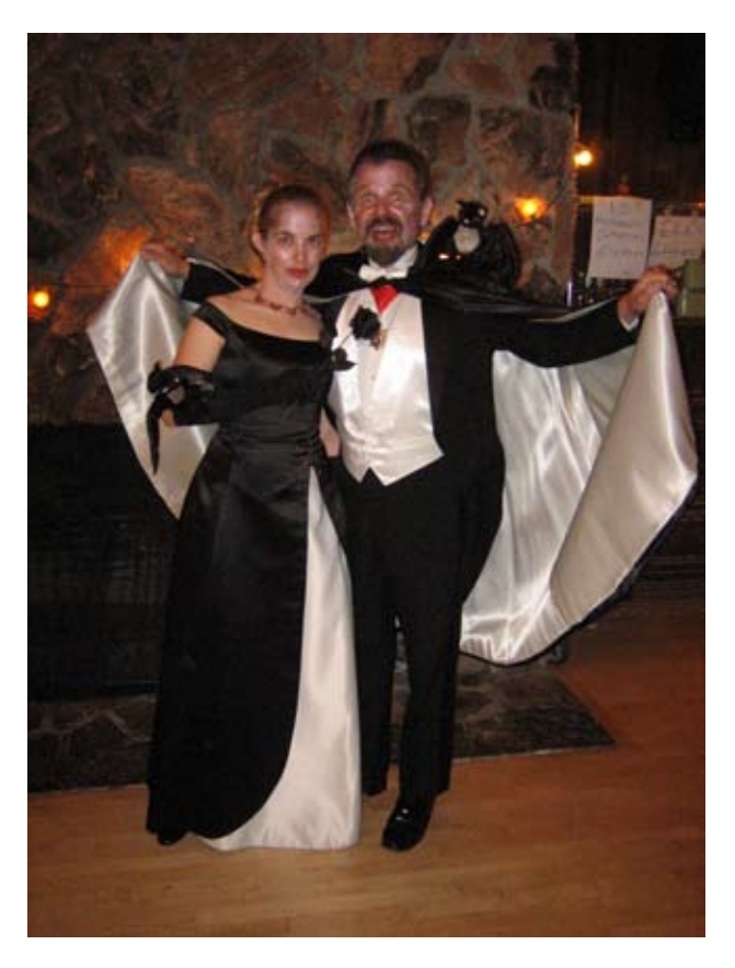
Dracula and His Lady

The Ratskeller, as the first floor was called, was decorated in Goth Halloween style, and the elaborately-carved bar