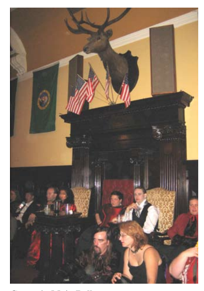
Guests in Main Ballroom

After my duties for the evening were done, I went back into the Ratskeller and enjoyed the catered food. I was told that it was going to be mostly finger food and not