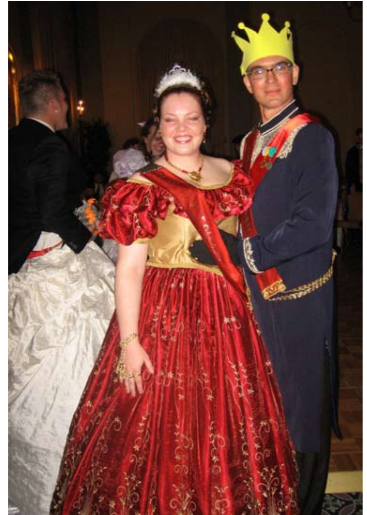
Prom King and Queen