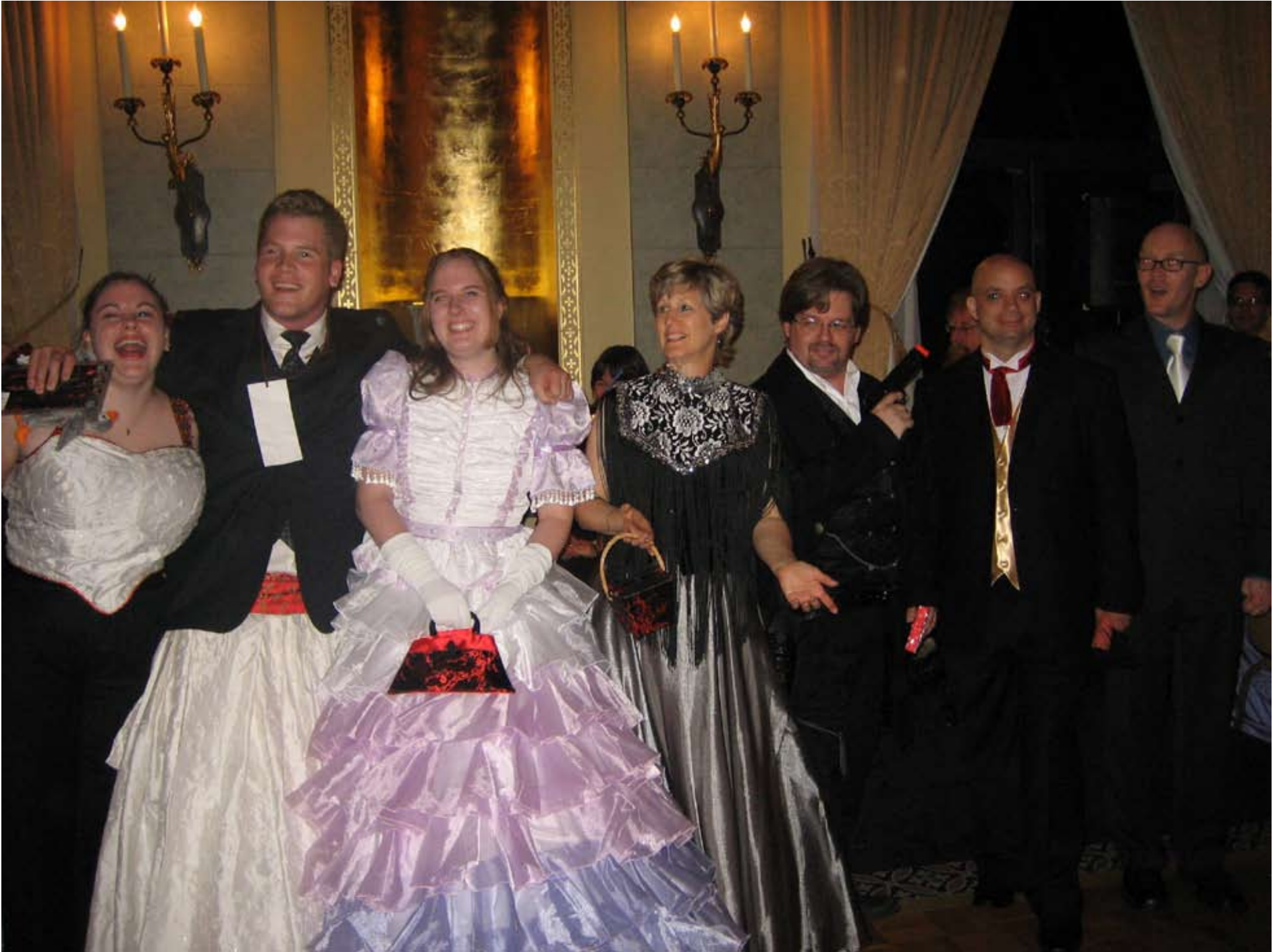
Some of the ball's winners