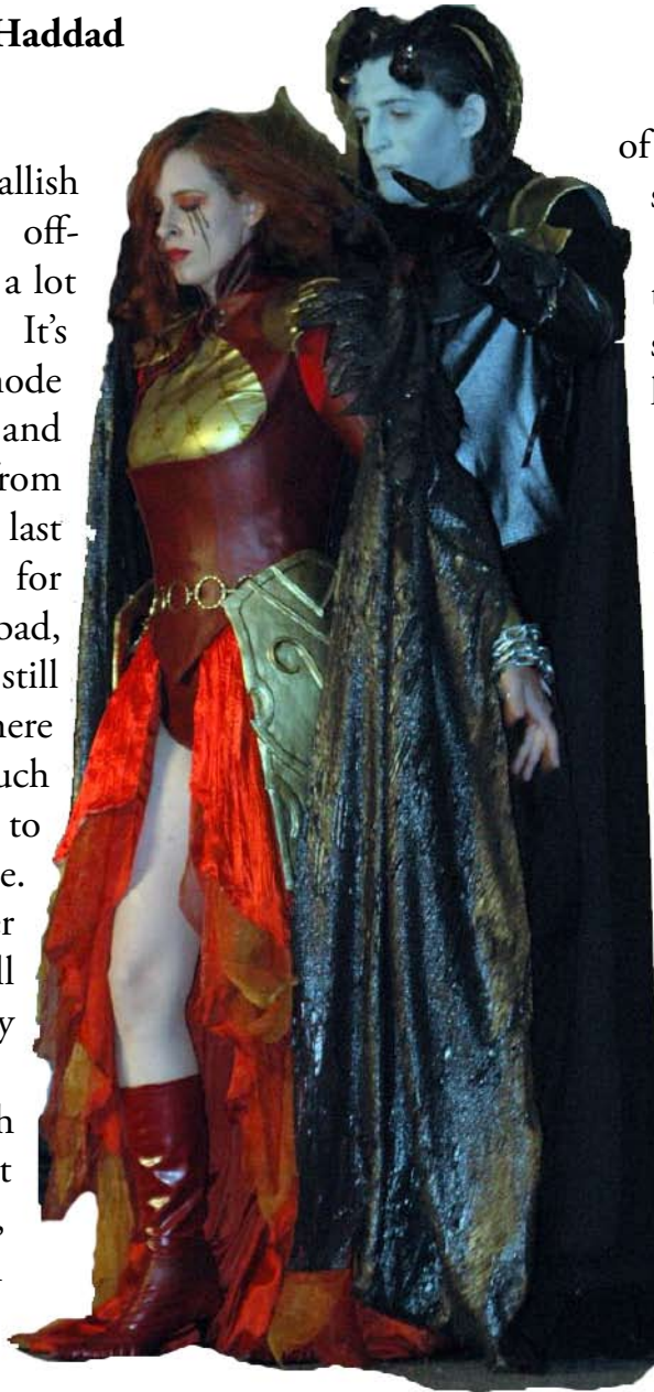
Dawn Costume Exhibition

For a smallish convention on an off-weekend, SiliCon had a lot to recommend itself. It's been in re-building mode for the last few years and has grown in size from 400-ish to mid-500s last year, to about 650 for 2006. All in all, not bad, but the Doubletree still dwarfs SiliCon and there seems to be too much hotel space for the con to use. At least at this time. Let it grow by another 200 members and it'll start showing the energy of other conventions. The main problem with the hotel layout was that the registration area, the largest presentation room, and dealers' room were on one side