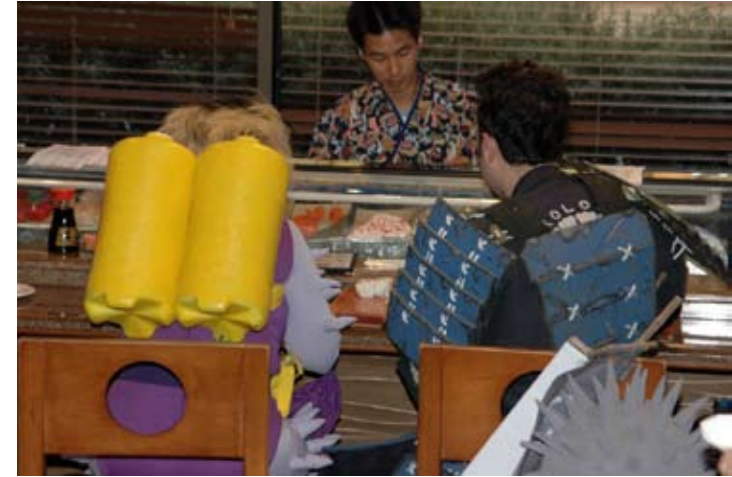
Anime Characters at Sushi Bar

The biggest flaw that came to light was the last-minute notification of a charge for parking (unless one was staying at the hotel), but the fee was beaten back to $3.00 from an initial $5.00, plus the right of multiple exits/entries as long as the receipt was kept. This should serve as a warning to future conventions that they need to check their hotel contracts and make sure everything is put in writing.