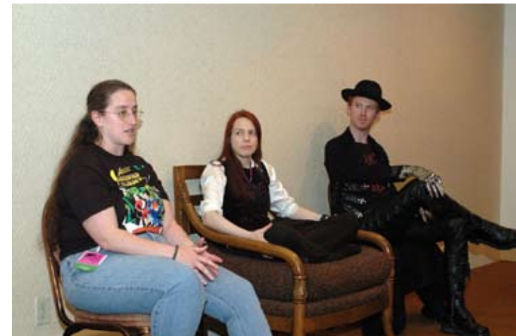
Real Vampire Panel