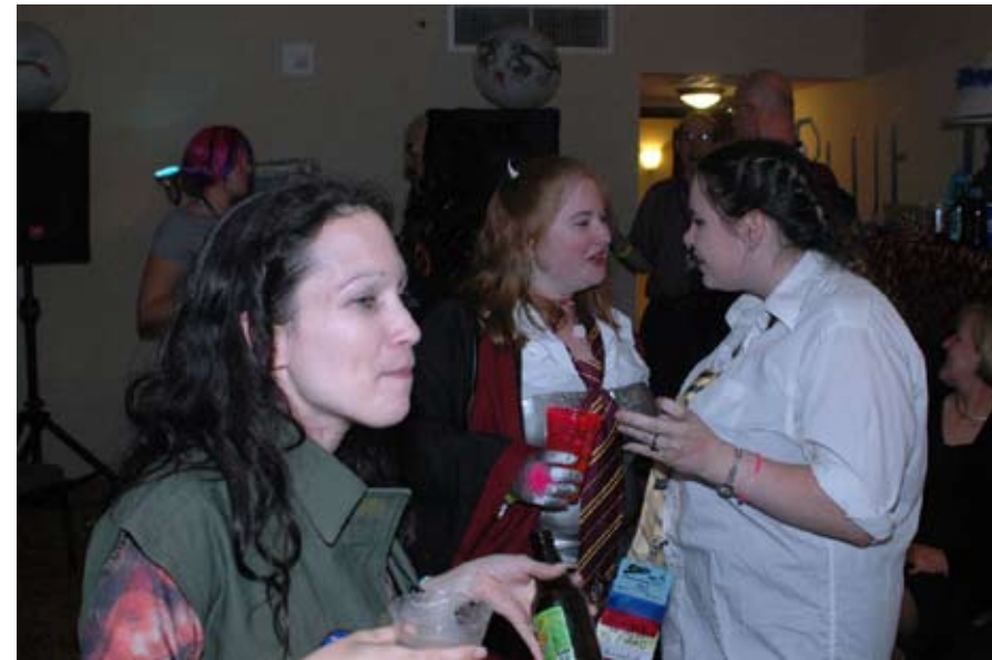
Blue Sun Party Room

My Sunday was unfortunately brief, since convention rooms began closing down around 3:00 p.m. In general, I had a very good time and definitely plan to attend SiliCon again next year.