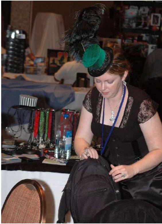
Ruby Raven Hats in Dealers Room