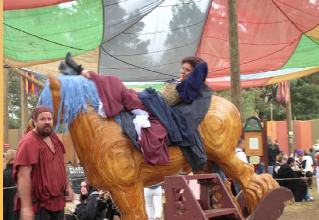
Large Rocking Horse