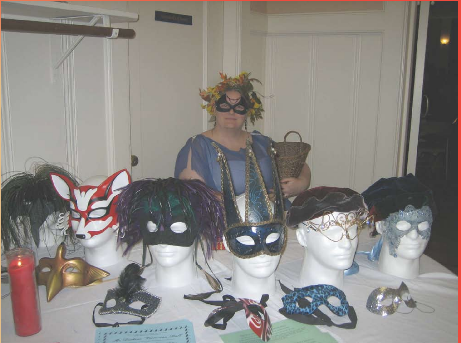
Lady of Fertility with Masks