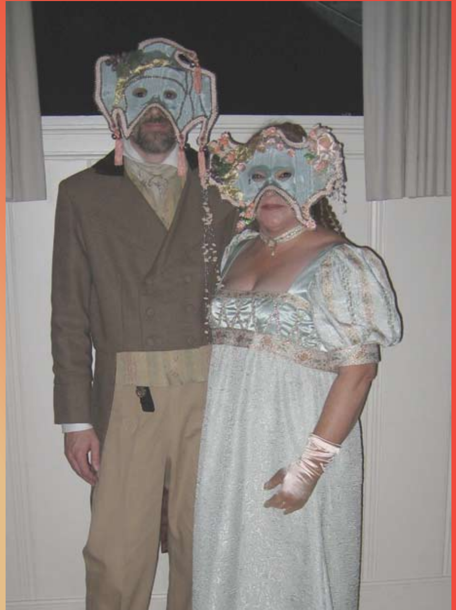
Masked Gentleman and Lady