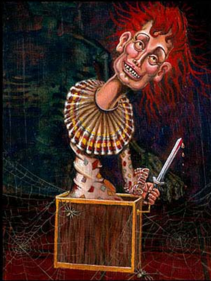
Jack in the Box