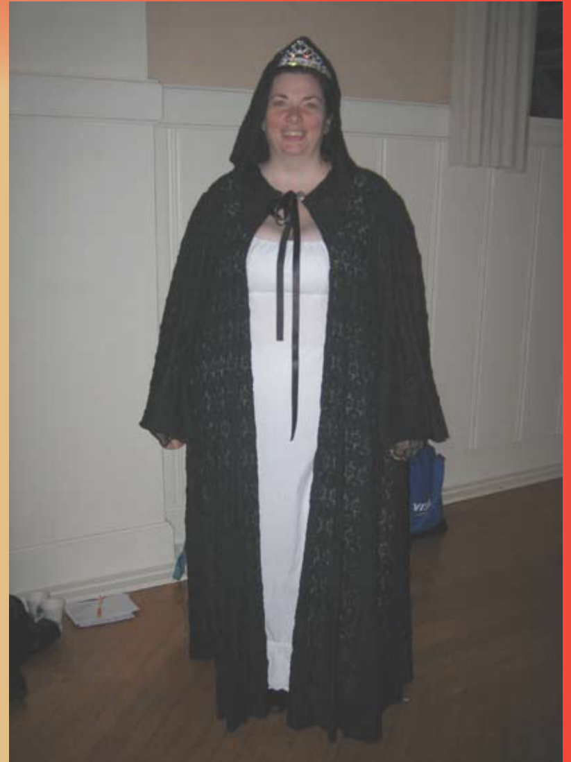
Czarina of the Ball