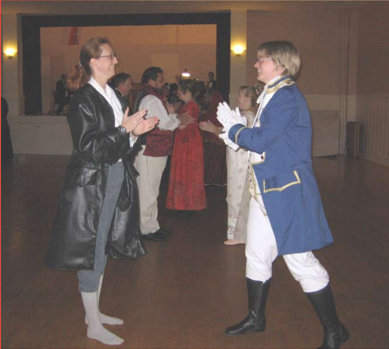
Will Turner and Captain Norrington Dancing

For more information, please visit: www.baers.org