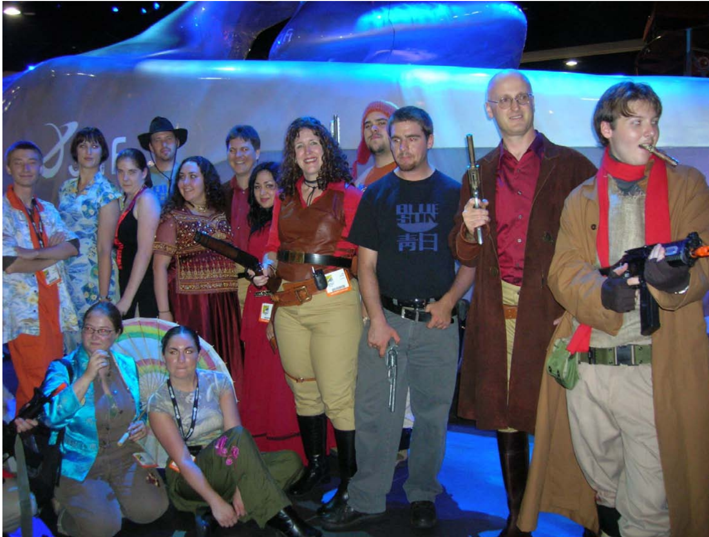
SF and Silicon Gulch Browncoats at the SciFi Channel booth

Some of the great costumes included the Cantina Band from Star Wars: A New Hope , the