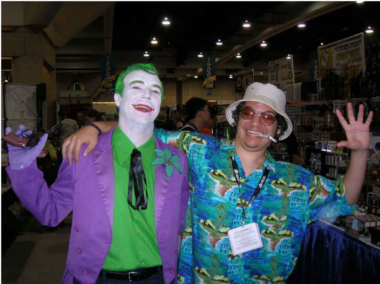
The Joker and Gonzo

My Saturday had started out pretty much shot, as the costume I had hoped and prayed for (not to mention spent a year and a lot of money on) did not make it in time to wear. So, it turned into an all Browncoat day, which isn't bad. By