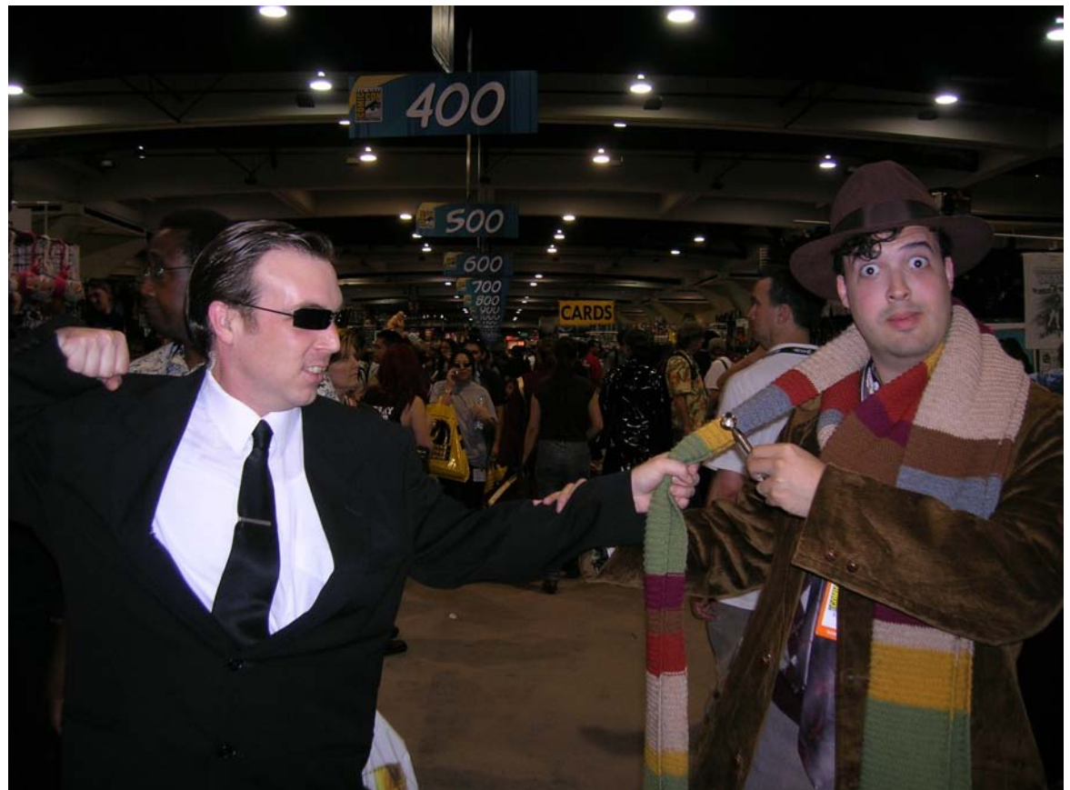
Agent Smith Versus Doctor Who

Comic-Con, while the largest con, still starts off with a bit of a slow spell, but quickly gets into full swing as conventioners