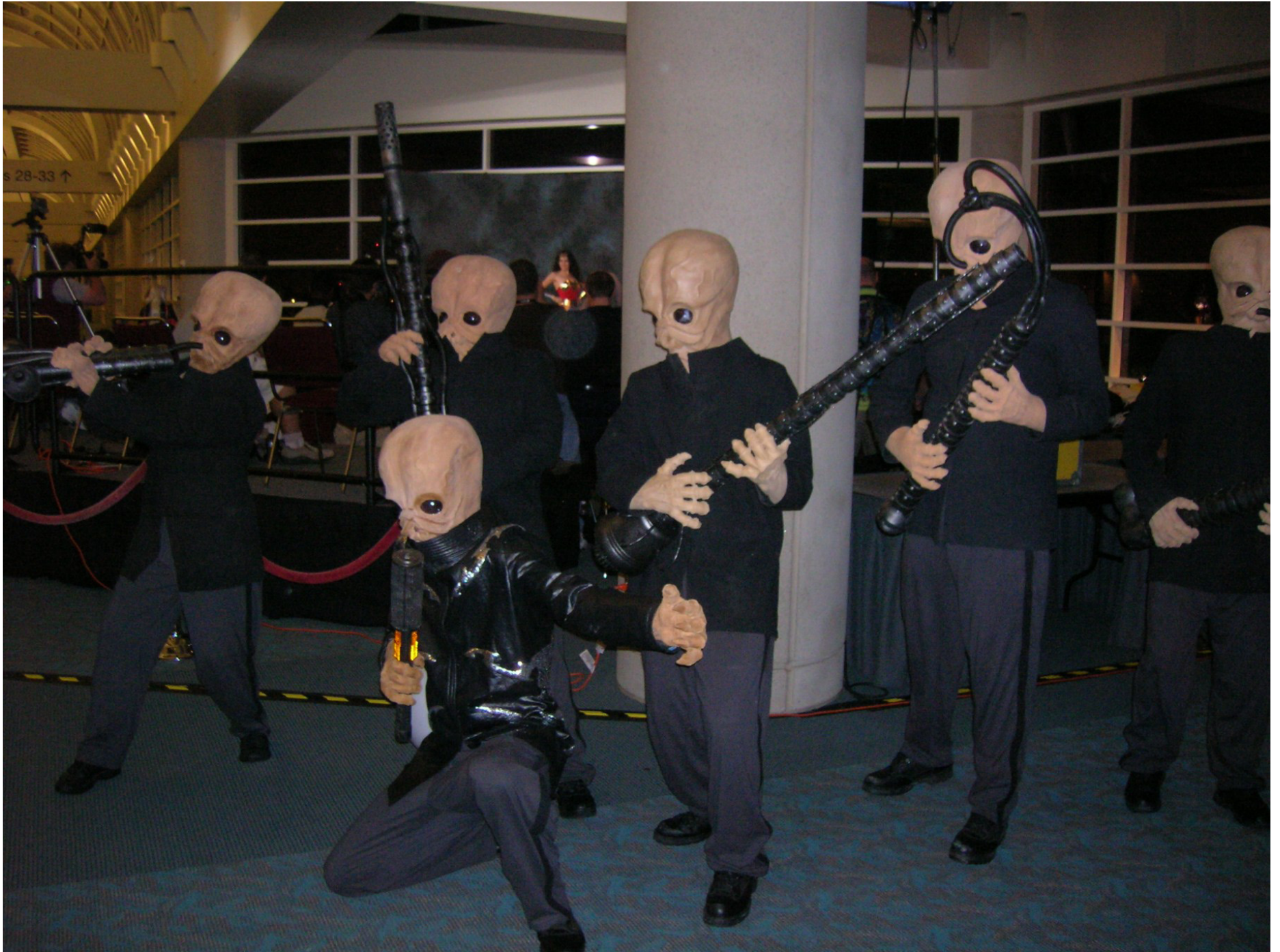
Star Wars Cantina Band