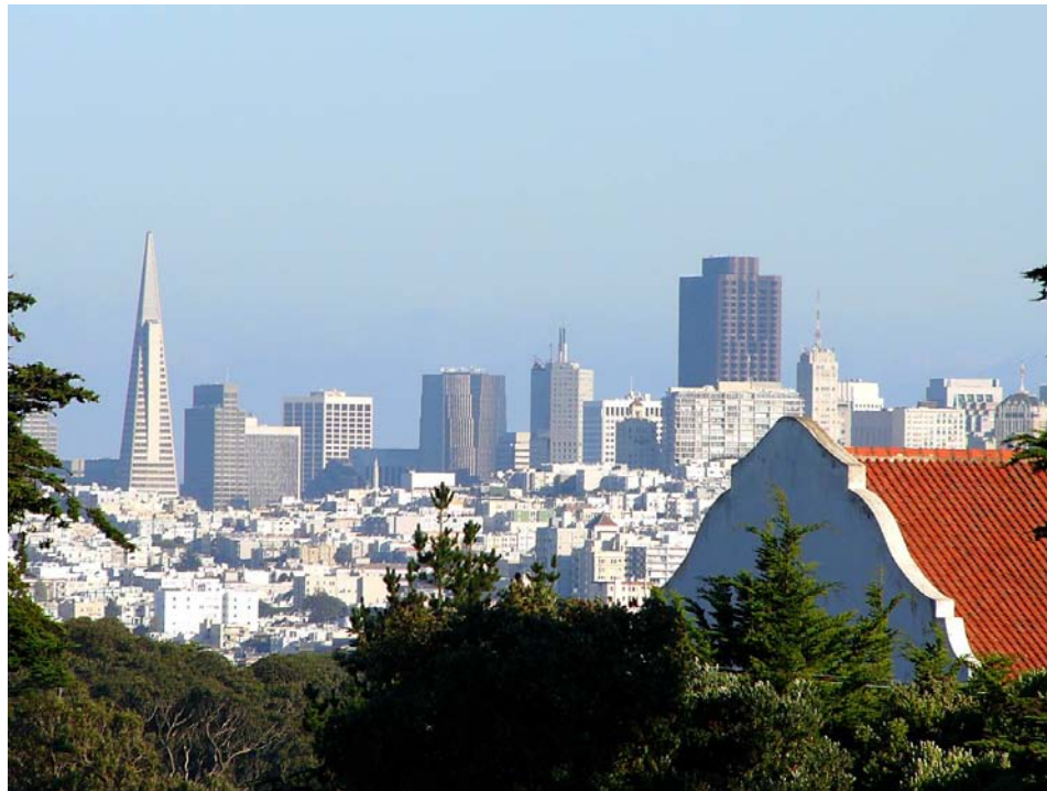
San Francisco sky line

Coming into San Francisco, I could have been forgiven for thinking that the