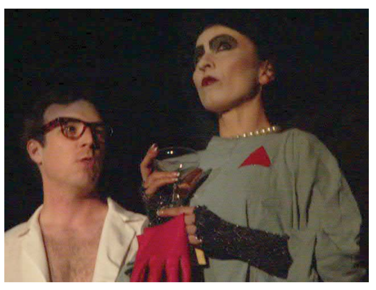
Barely Legal's June 10th performance of Rocky Horror

Science Fiction & Fantasy Writers' Group Borderlands Books