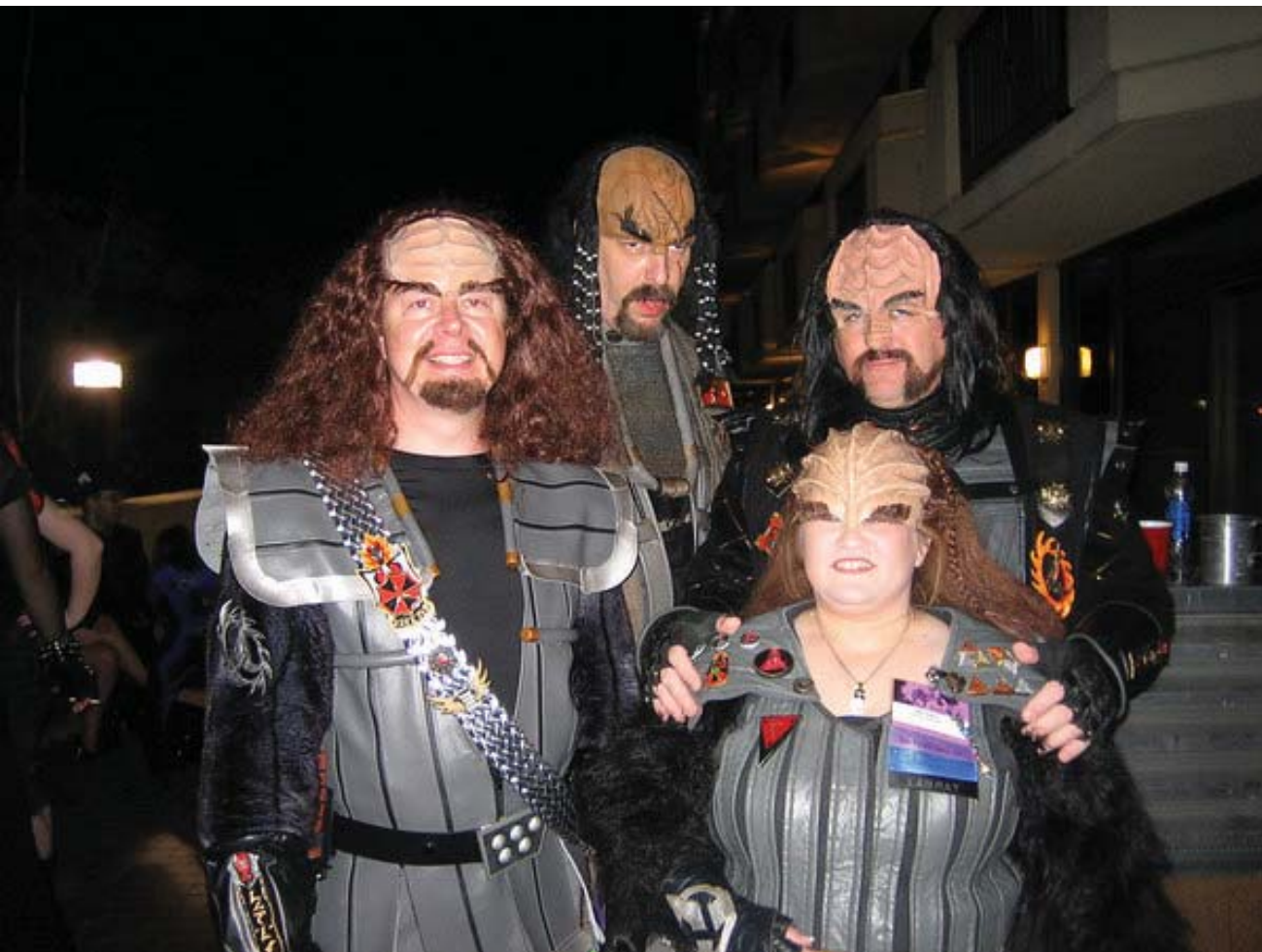
Klingons at Mara's Bar

before I had to go to the Legion of Rassilon The reason I didn't get to wear my meeting that same evening. This was really