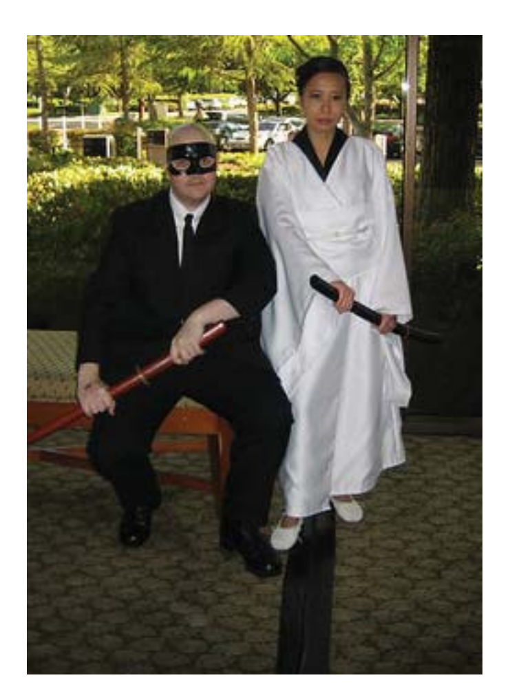
Kill Bill, Hall Costume award winners

costume, singing and dancing, so masquerades are a natural fit for me. I was a little nervous when we went on stage but after that it just finished so quickly! Our group was called the "Spam-ish Inquisition" and we performed the song "Knights of the Round Table." The first half was from the movie Monty Python and the Holy Grail (where we acted serious) and the second half was from the musical Spamalot (where we really hammed it up).