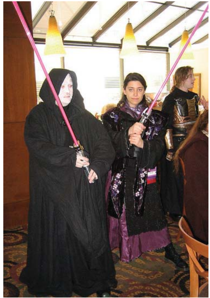
Star Wars group eating Sushi