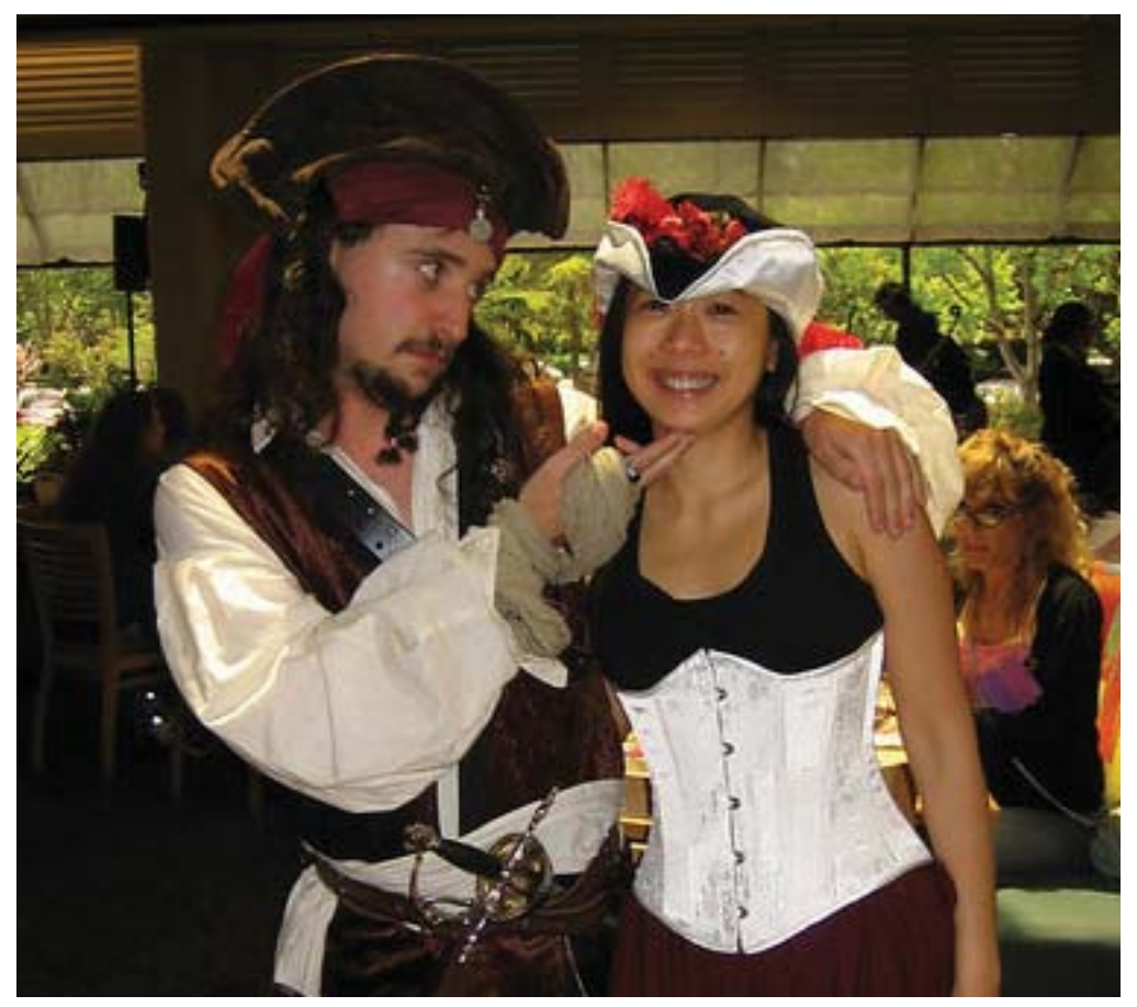
Captain Jack Sparrow and Pirate Lady

the other entries. The caliber of the performers was pretty high! Lots of clever, creative and original entries. Then at 6:30 a.m. our masquerade But everyone was so friendly and there was a sense of camaraderie as opposed to competition. There were several people I knew as well. Also, I was just there really to have fun and perform. I love dressing up in