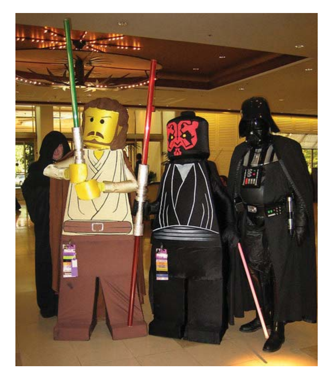
Star Wars Lego, Best in Show for workmanship