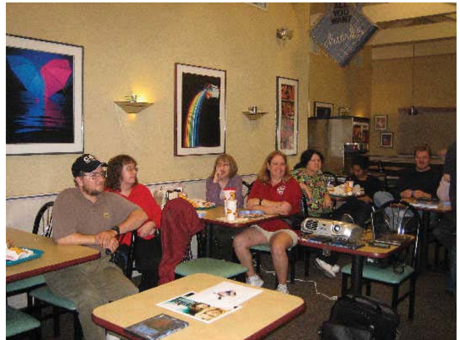
Legion of Rassilon

Finally, he played the first episode entitled New Earth . David Tennant finally came into his own in this episode. I like that he looks completely different from Chris Eccleston. He's charming and