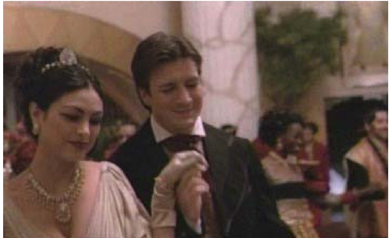
Mal steals dance

In the 19th century, dance is what people did, before there was television, radio, Pez dispensers, TiVo and Halo II . It was a bringing together of the community, of men and women, of life and celebration warmly wrapped up a gentle pastiche of motion, of touch, of concealed sensuality. Young men and women were expected to know