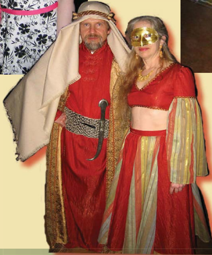
Arabian Nights Couple