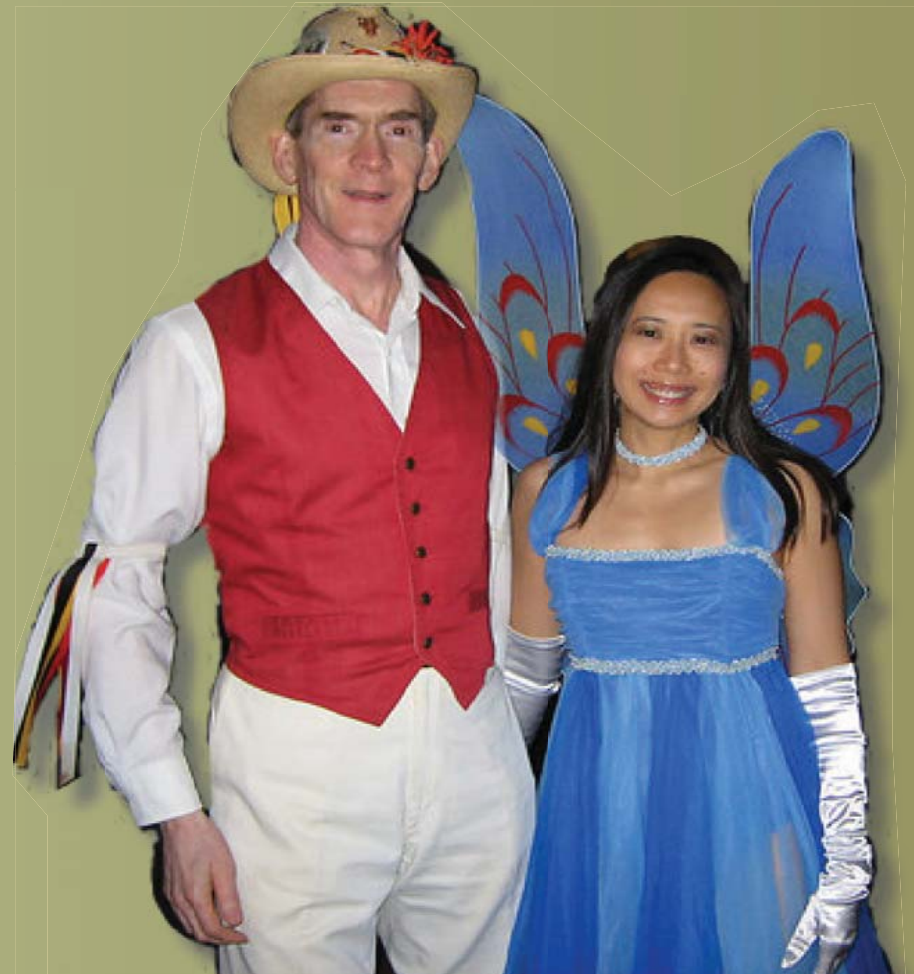
Morris Dancer and Blue Fairy