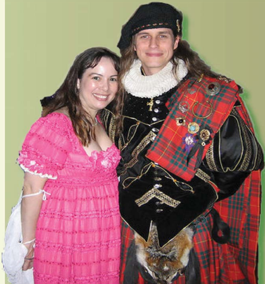
Regency Lady and Scottish Laird