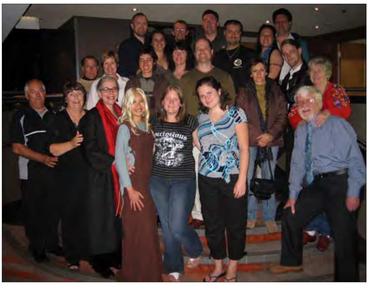
The March 2006 Fellowship

out to be not too bad as we had on-demand as I didn't want to get too excited just yet. movies in the comfortable 777, I had a I'm not a very outdoorsy person so I had window seat, and it was a direct flight. I some reservations about whether I would