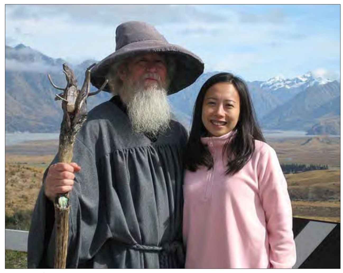
lean with Gandalf