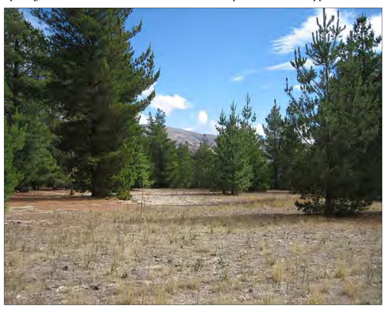
The scene of Arwen's great chase

The first LOTR location was the rock outcropping where the Wargs charged down onto the Rohan refugees. The second was the scene were Rohan refugees trudged beside a pond with snow-capped mountains