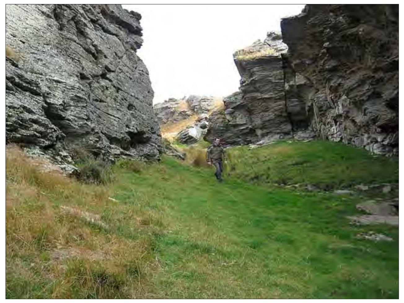
Gimli running after Orcs