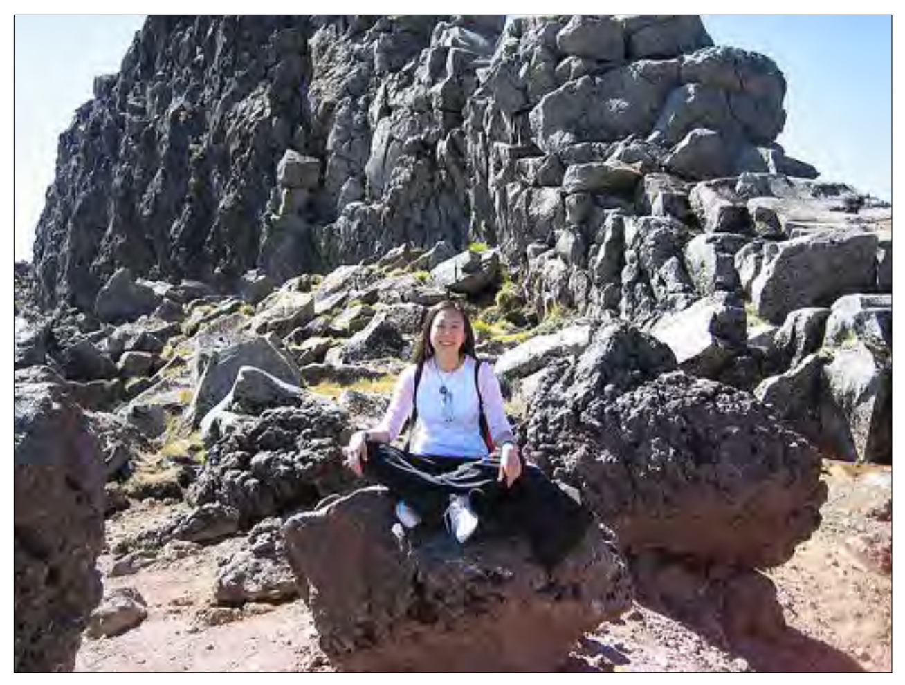
lean at Mordor

sparkling in the sunlight. On the left and in the Merry and Pippin scene, and several of us, including myself, did the Frodo scene. We then went to the water's edge and I borrowed someone's One Ring and pretended I was Frodo looking at the water and the ring. Our picnic lunch was a lot was the tree where Frodo responded in of fun. People wandered off in separate