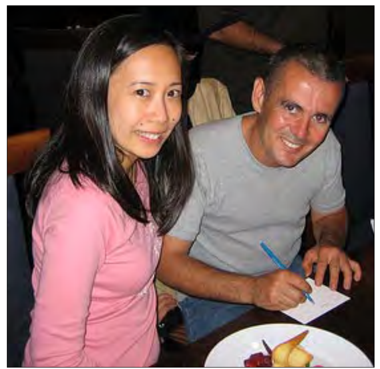
lean with Gimli's Double