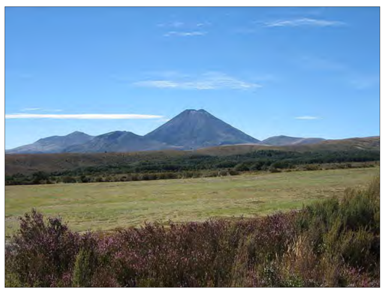
Mount Doom

I was so tired already but I had one more