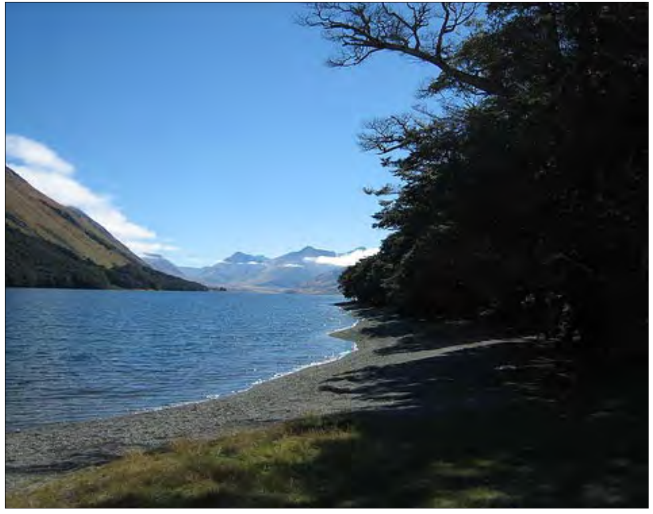
The Scene Where Frodo Leaves The Fellowship