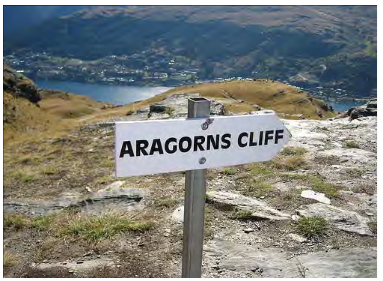
Aragorn's Cliff at Deer Park Heights

Day 13 Queenstown – San Francisco Most of us were flying out around noon.