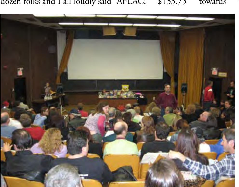
Overview of the Crowd