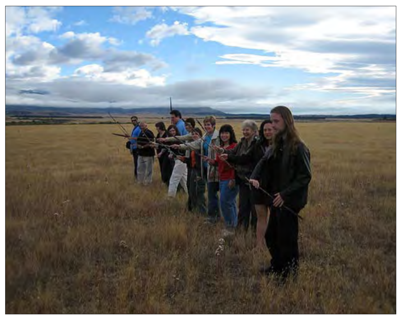
Charging on the Pelennor Fields