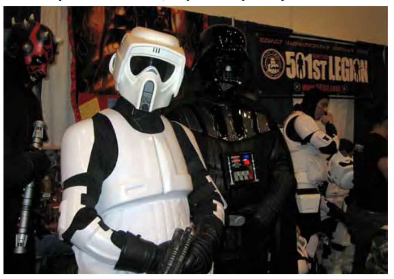
Th3 501st Legion Fan Table at WonderCon

Saturday, I got to the convention after lunch as I was still not feeling well. There was a long line to get into the 1<sup>st</sup> floor area