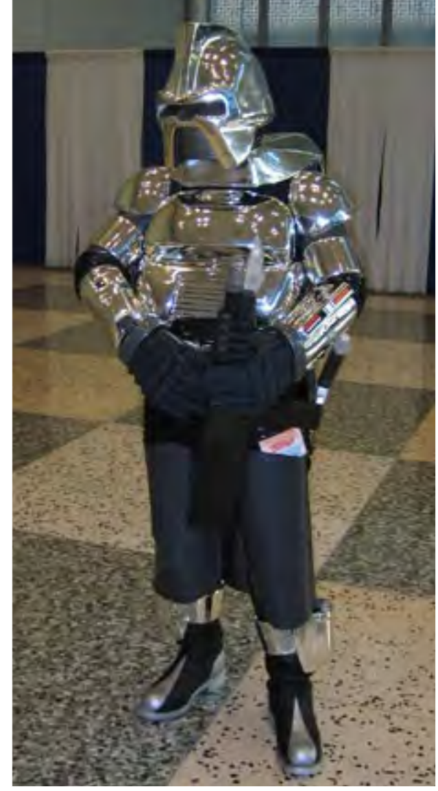
An original Cylon