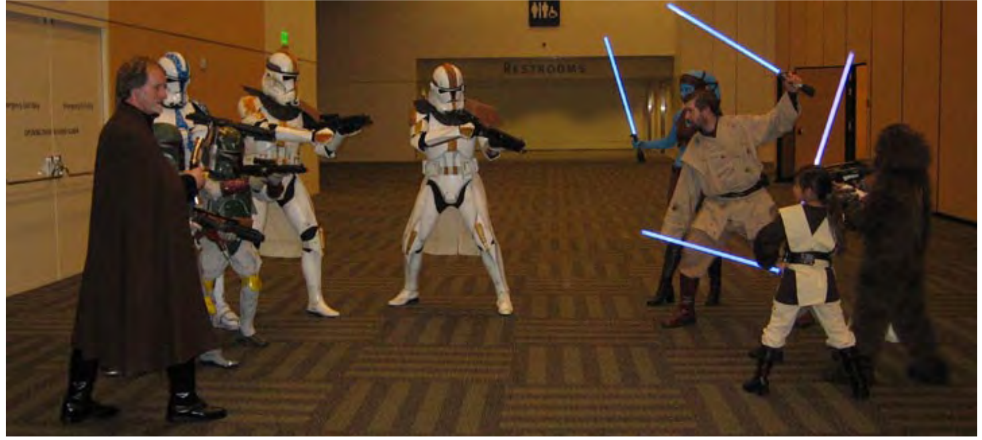
Empire versus Jedis

Our group was relatively huge with late last year, we hoped we'd get a better perform. We were placed last of 30 in the I knew most everyone in that group and ran