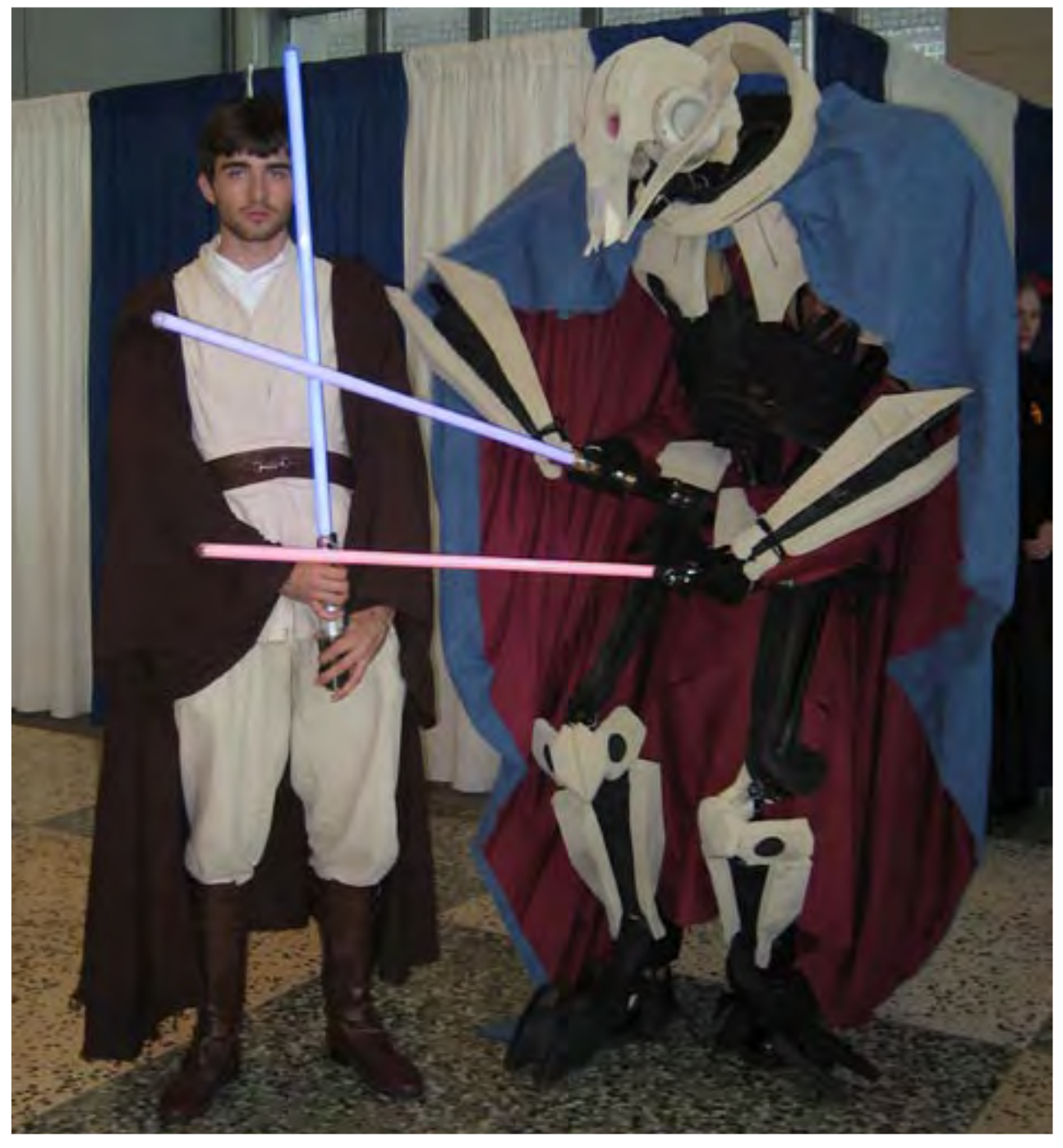
ledi with General Grievous