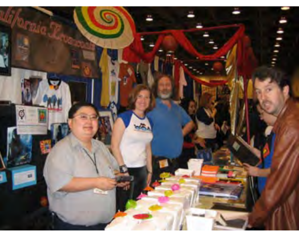
Browncoats Fan Table at WonderCon

sign. People have told me that WonderCon is smaller than Comic-Con, and with 100,000 people attending last July's Comicanything Con, would pale in comparison. Still, WonderCon was a larger event than I expected. The dealer and exhibitor room on the first floor was huge! The