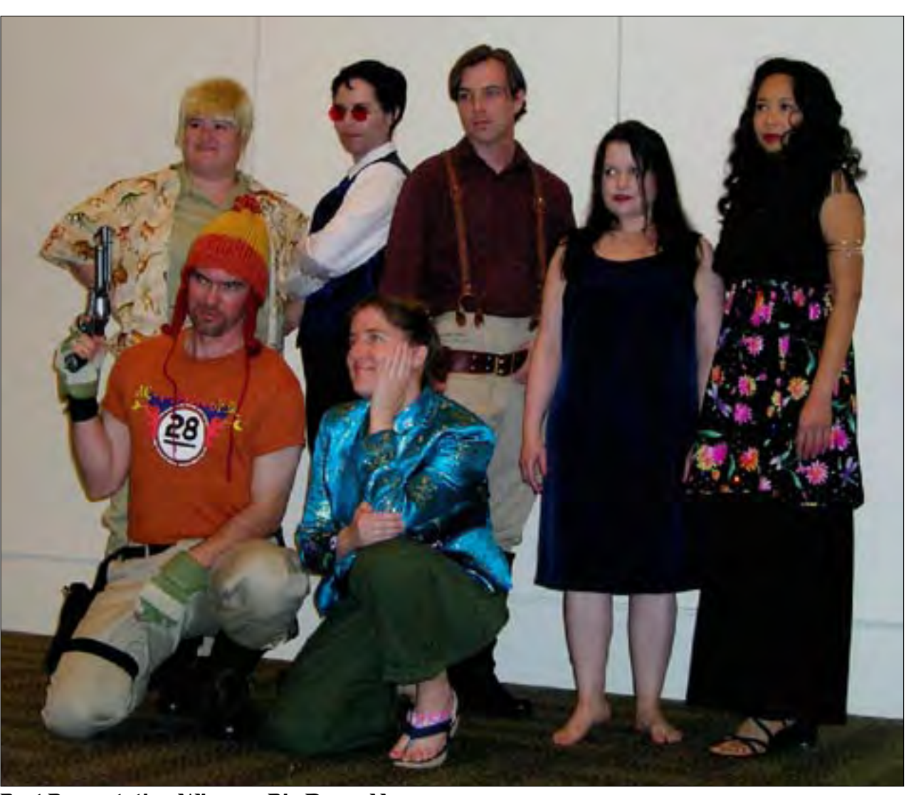
Best Presentation Winners Big Damn Heroes.

Because flash photography wasn't allowed in the masquerade room, members of the press waited for entrants to show their stuff at hallway photo ops immediately after their stage appearances. More photos were taken while waiting for the judges' decisions and after the winners were announced. Twenty-six entries came by to be photographed but there may have been a few that didn't come.