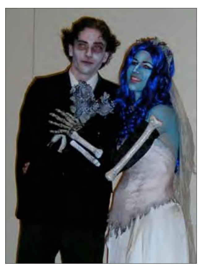
Victor and Corpse Bride.

General Grievous and Obi-Wan took Nouveau costume. The Best in Show and also the Lucasfilm prize fun for Best Adult costume, which was a huge foam ears airbrushed with aisle banner of Yoda from Celebration 3.