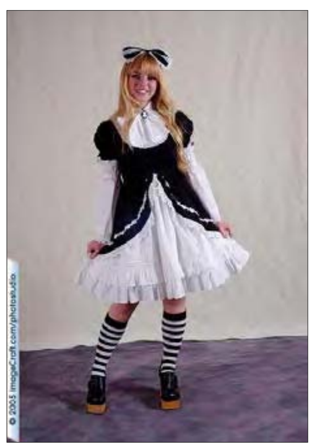
A masquerade contestant.

Several people quickly knocked out iced tea), and a slave auction. pirate costumes and accessories out of scraps found in the repair room for Friday night's "Rum" party. I was never quite sure on the rationale of the "Rum" party, but it seemed to satisfy the crowds. After the that it was still pretty "first day." Anime Music Video contest, a bunch of