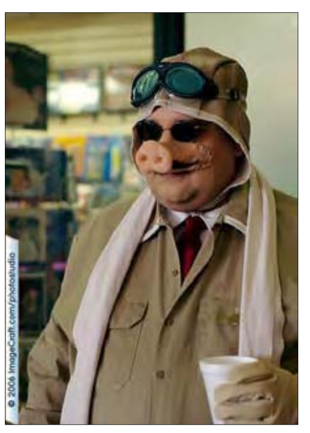
The Bay Area's Raider 3 as the title character from the movie Porco Rosso .

San Francisco, Santa Clara County or LA, but not everybody knows all the hidden pockets of Japanese shops or has easy access to them, and I've got to give the dealers'